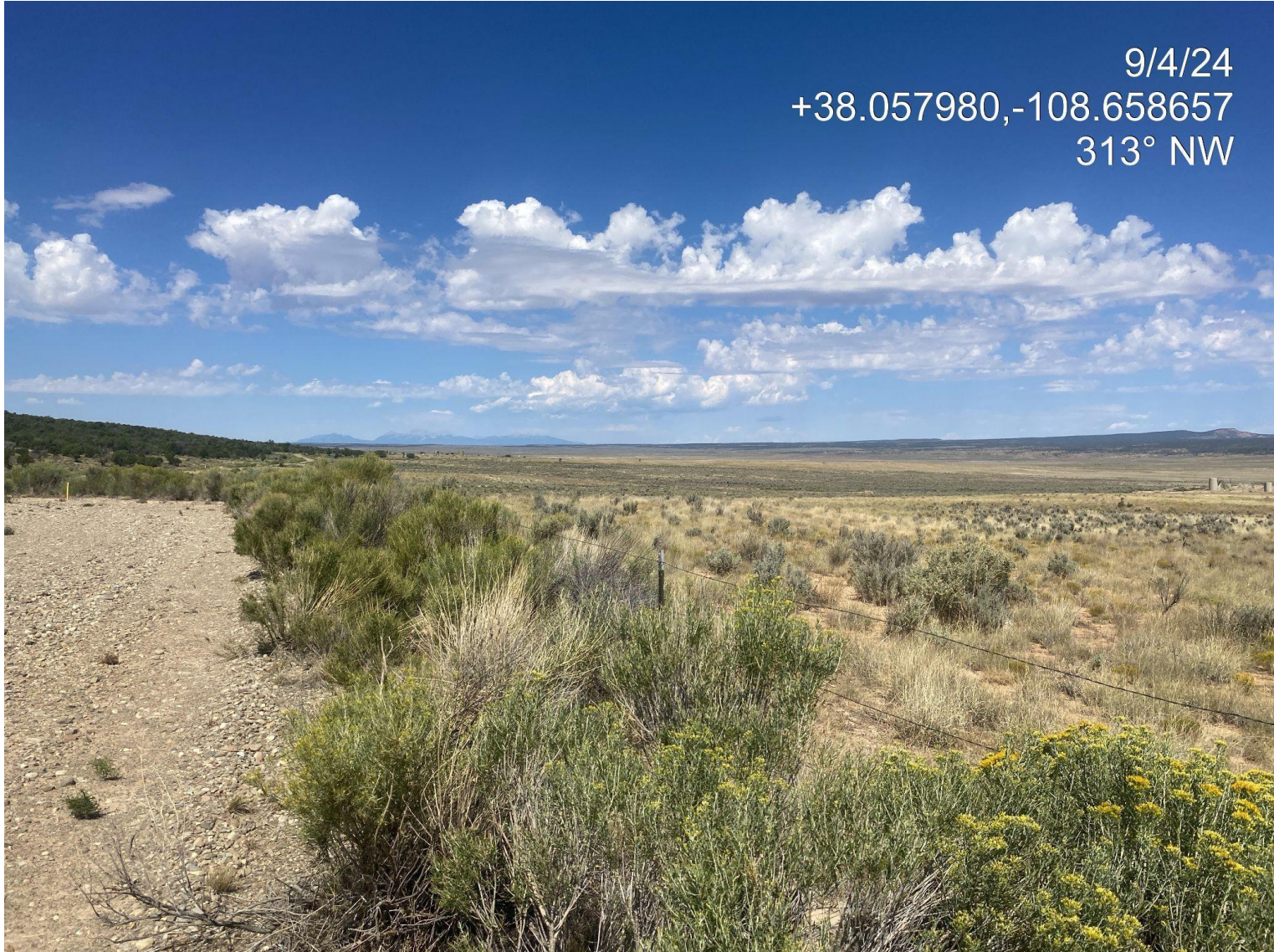
Photo 3. View of the northern interim reclamation area facing northwest.