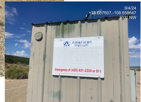
Photo 1. View of the well disturbance taken from the access point facing center.