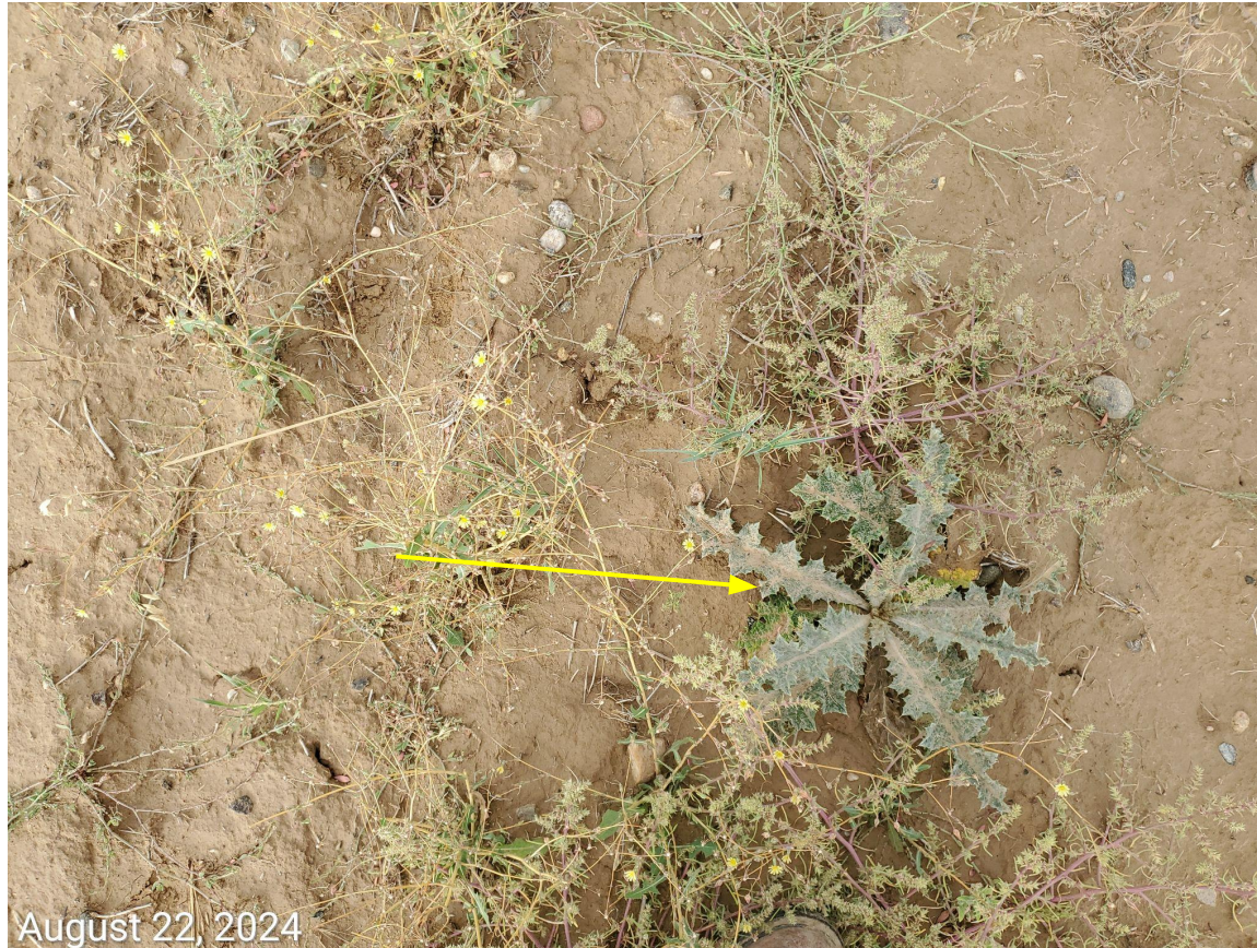
Photo 15: Continued from photo 14. Desirable plant germination/establishment was not observed within the recently reclaimed areas. Vegetation establishing within the interim areas are predominantly Undesirable and Noxious Plant Species, including Scotch thistle (arrow).