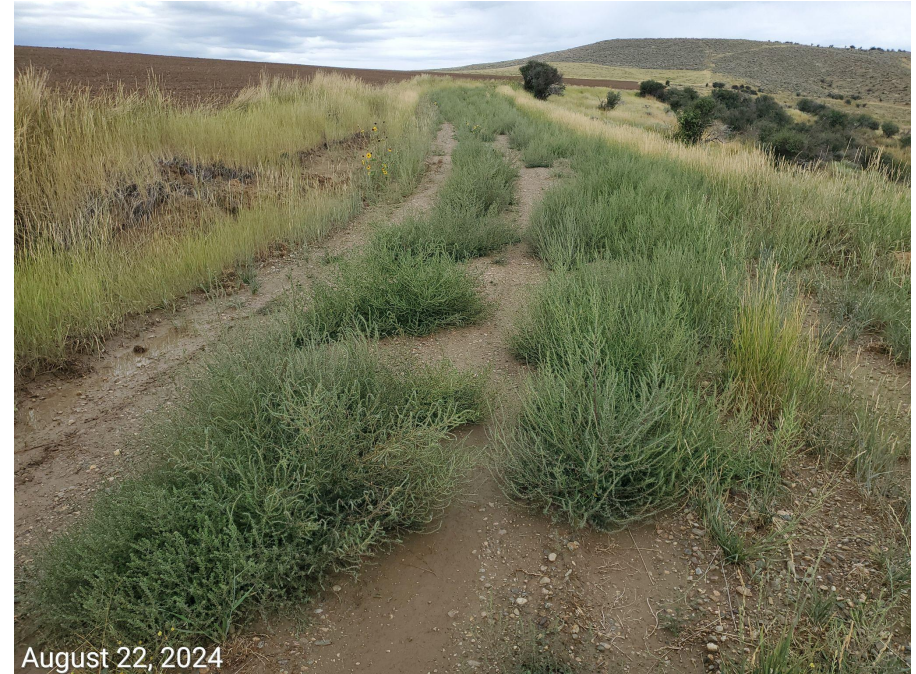
Photo 21: Photos 21-22 taken from the access road. Photos show weeds (Russian thistle, Kochia, Scotch thistle) have continued to spread and establish along the access road.