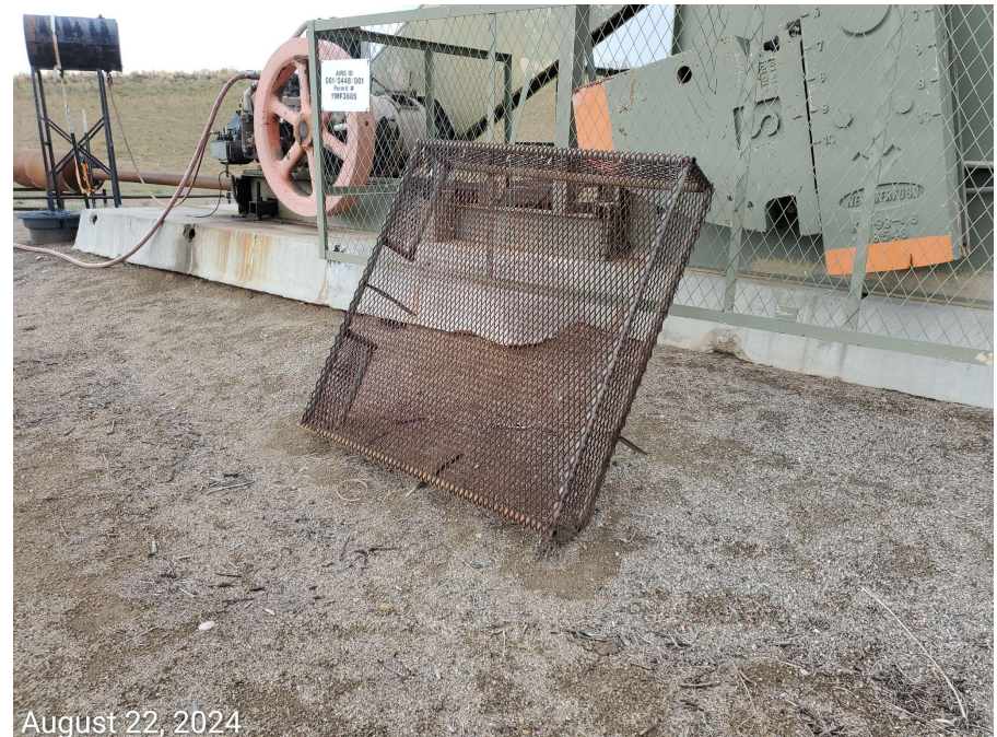
Photo 10: Photo left taken during the 5/8/2023 inspection. Inspection noted that the guard was not installed on the pumpjack. Operator submitted a Resolution stating guard was replaced. Photo right taken 8/22/2024 and show guard remains improperly stored, and has not been replaced.