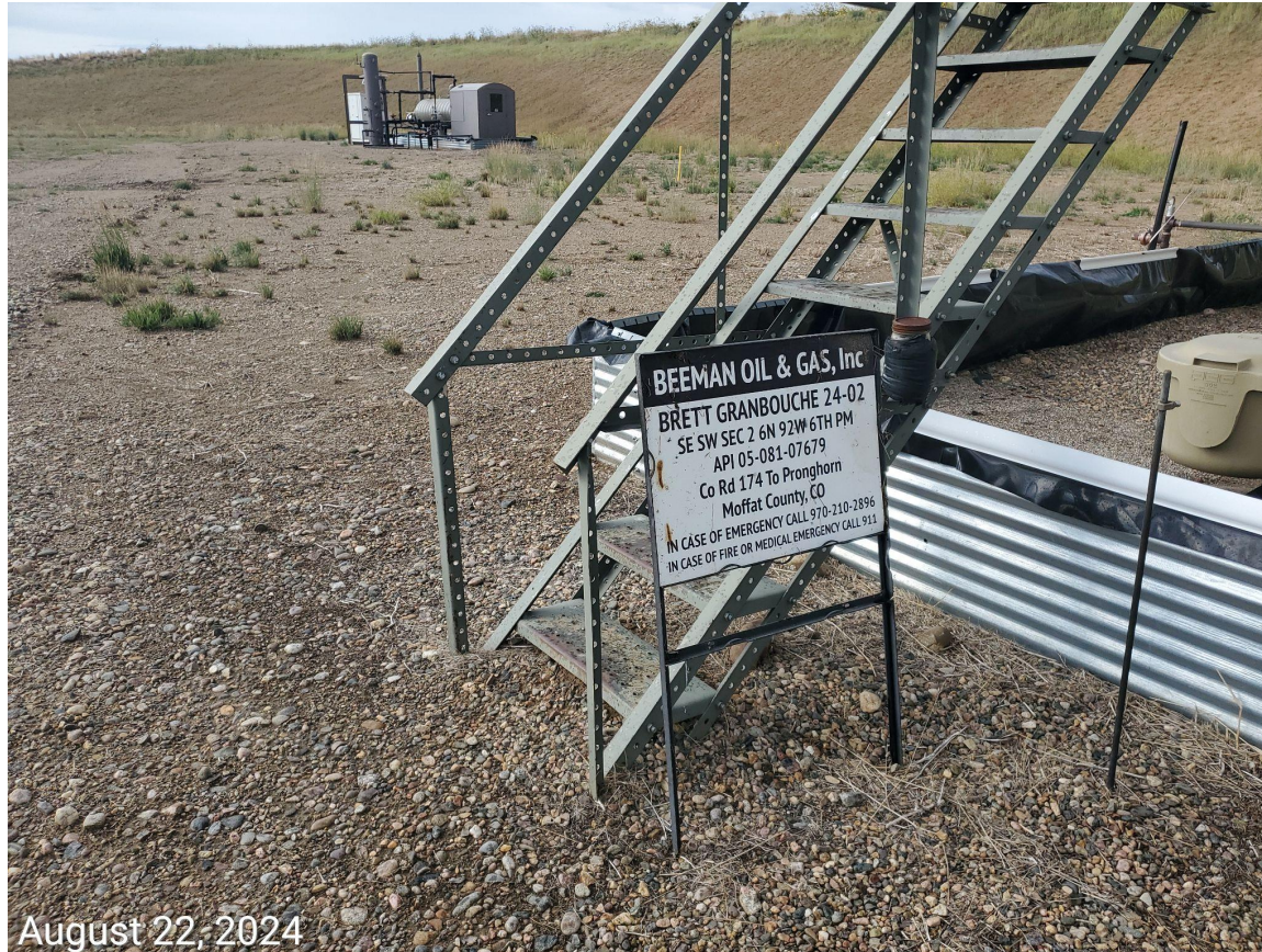
Photo 6: Photo taken from the tank battery facility on the north end of the Location, facing south. Photo shows signage at the facility has been installed.