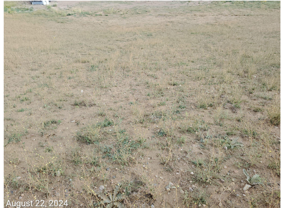
Photo 14: Photos taken from the top of the fill slopes on the south end of the Location, facing northwest and north. Revegetation efforts have not been performed, or have failed; desirable plant germination/establishment was not observed within the recently reclaimed areas. Vegetation within photos are predominantly Undesirable and Noxious Plant Species. Unable to find evidence that soils had been "crimped" with any materials such as mulch. BMPs along slopes have either not been implemented or not maintained until long-term stabilization is achieved; slopes remain predominantly bare.