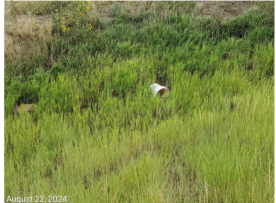
Photo 20: Photo left from the 5/8/2023 inspection. Photo right from the 8/22/2024 inspection. Photo example showing trash debris remaining