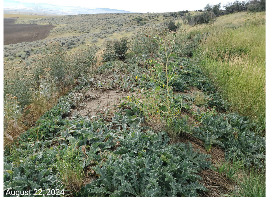
Photo 18: Photos taken from the east end of the Location. Photos show Noxious Weeds (Scotch thistle) have continued to spread and establish on the fill slopes and berms of the Location. Weeds are also spreading onto the adjacent, off-location areas.