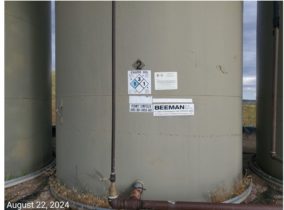
Photo 7: Photo taken from the tank battery facility on the north end of the Location, facing north. Photos examples showing information pursuant to Rule 605.h (NFPA Label, Capacity information) has not been posted.