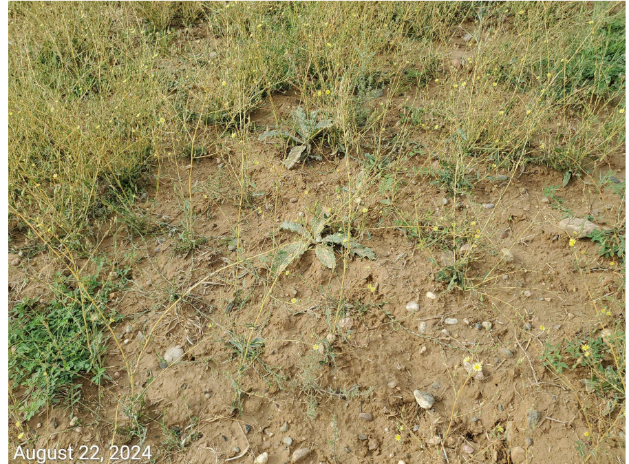
Photo 16: Photos taken from the interim areas/fill slopes on the east end of the Location, facing northwest. Revegetation efforts have not been performed, or have failed; desirable plant germination/establishment was not observed within the recently reclaimed areas. Vegetation within photos are predominantly Undesirable and Noxious Plant Species. Unable to find evidence that soils had been "crimped" with any materials such as mulch. BMPs along slopes have either not been implemented or not maintained until long-term stabilization is achieved; slopes remain predominantly bare.