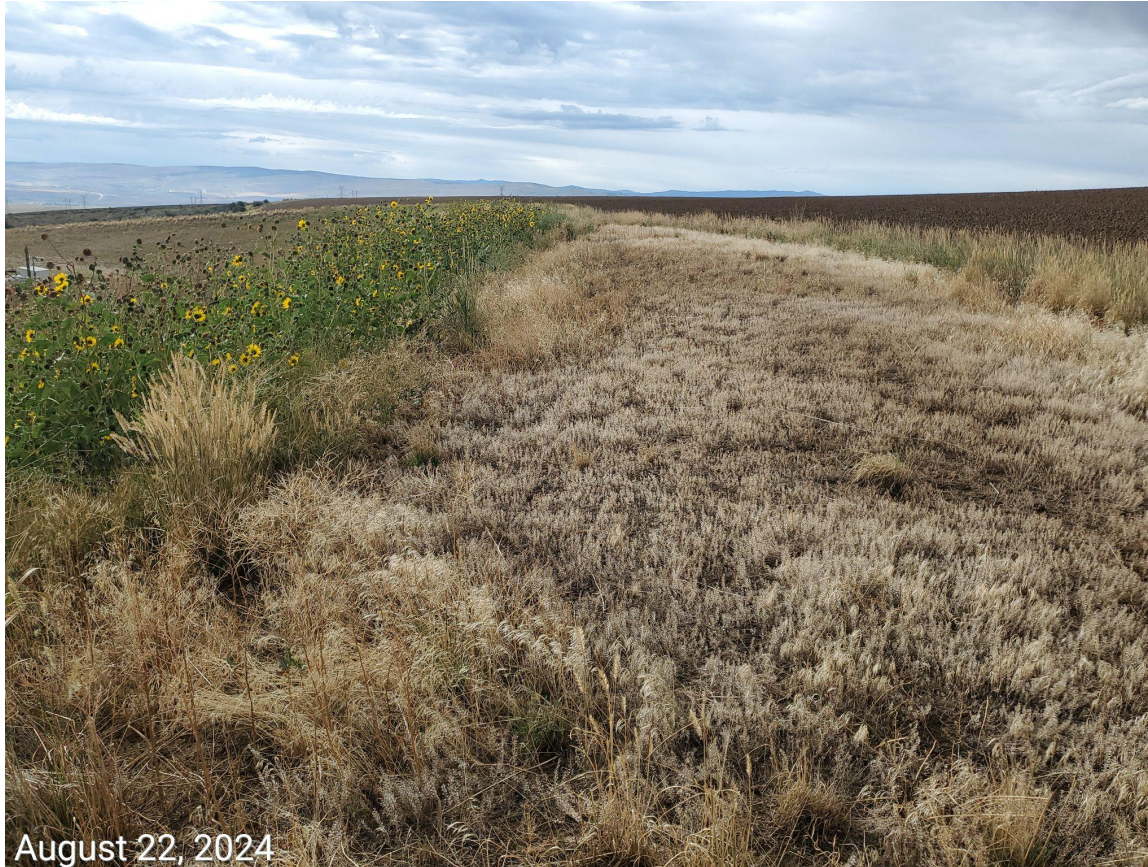
Photo 13: Photo taken from the west end of the Location, facing southeast. Photo shows areas of the Location where interim reclamation does not appear to have been performed. Vegetation is predominantly Undesirable Plant Species such as Cheatgrass, Field Pennycress, etc...