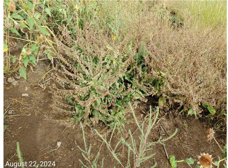
Photo 12: Photos taken from the top of the cut slopes along the west end of the Location. Photos examples showing Noxious Weed establishment (Scotch thistle, Houndstongue). Weed management efforts have not been performed, or has been insufficient.