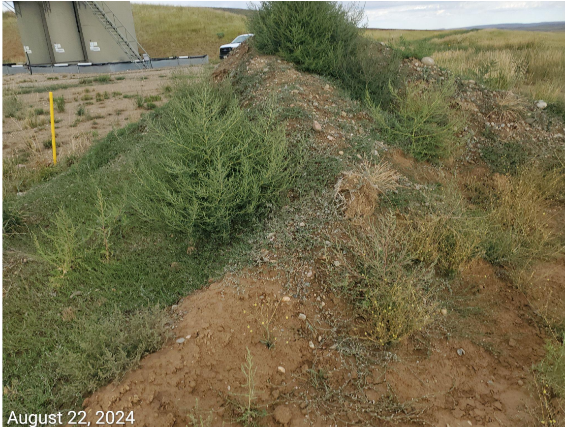
Photo 5: Photo taken from the northeast end of the working pad surface. Photo shows stockpile of material stored on Location. Photo also shows that BMPs to protect the stockpile from wind/water erosion, BMPs to minimize sediment transport, and BMPs to protect stockpile from weed establishment are missing or insufficient. BMPs required pursuant to Rule 1002.c and 1002.f, or, If materials are not necessary, materials require removal.