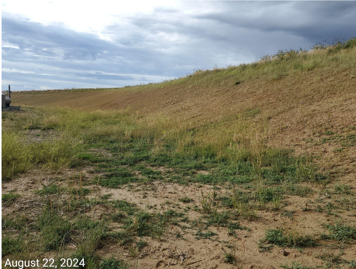
Photo 11: Photo taken from the west end of the Location facing southeast. Photo shows cut slopes have been recontoured. Vegetation establishing on the slopes are predominantly undesirable plant species.