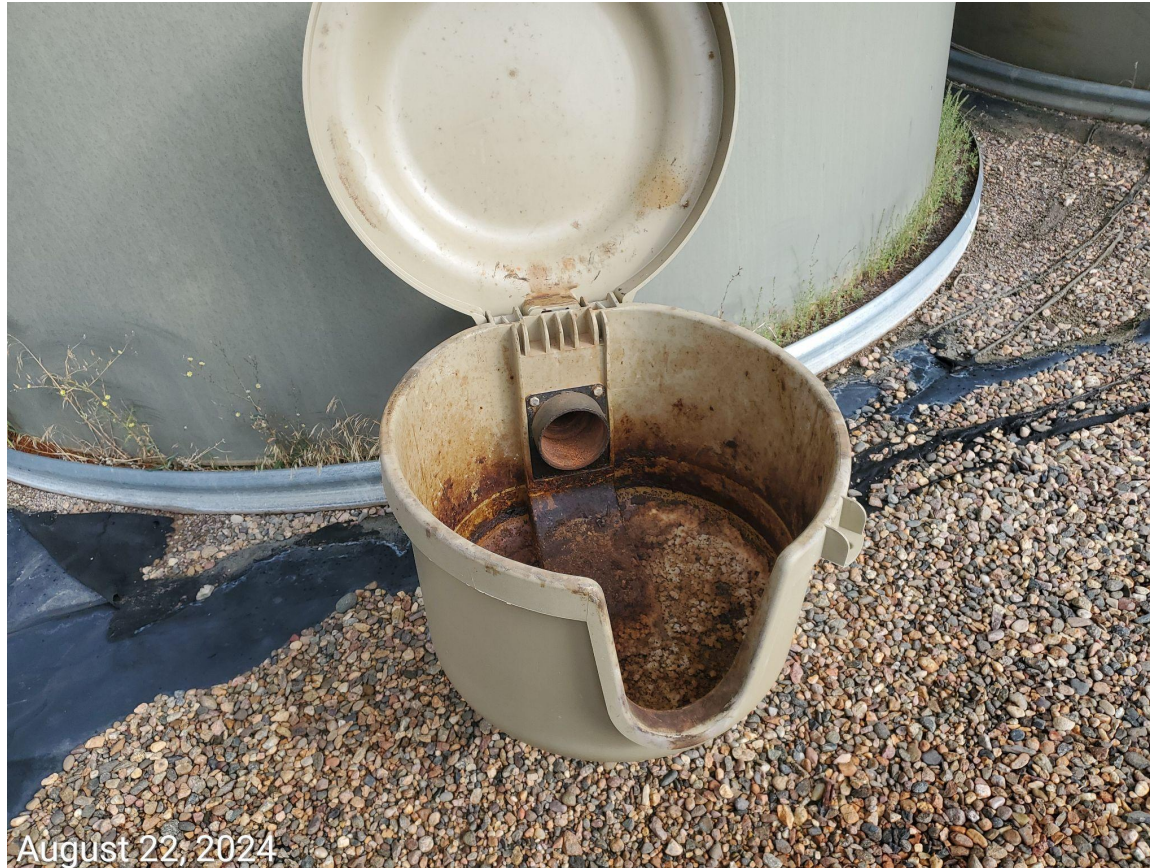
Photo 8: Photo taken from the tank battery facility on the north end of the Location. Photo shows line at tank has not been capped or plugged.