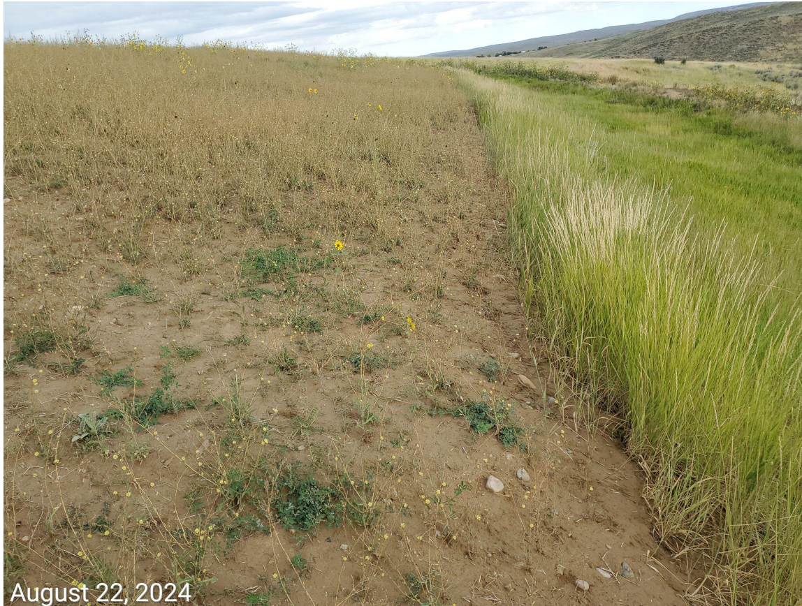
Photo 17: Photos taken from the interim areas/fill slopes on the east end of the Location, facing northwest. Photo shows boundary of the reclaimed areas, and vegetation at the toe of the slope. See comments under photo 16.