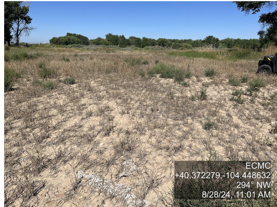
Photo 5. The photo was taken at the well location facing West. Refer to the comment for photo 2.