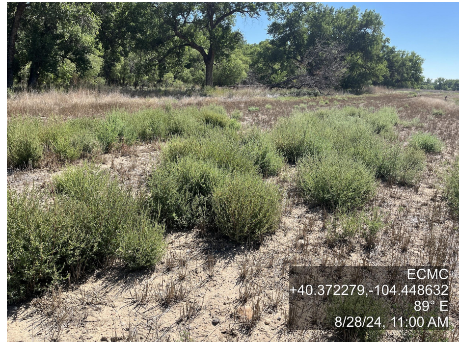
Photo 3 The photo was taken at the well location facing East. Refer to the comment for photo 2.

Note - Cultivated wheat and cereal rye was also observed having germinated from what appeared to be the crimped straw.