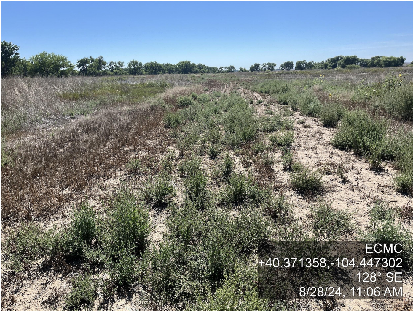
Photo 6. The photo was taken along the access road facing Southeast. Refer to the comment for photo 2.