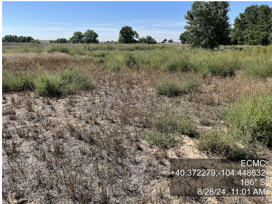
Photo 4. The photo was taken at the well location facing South. Refer to the comment for photo 2.