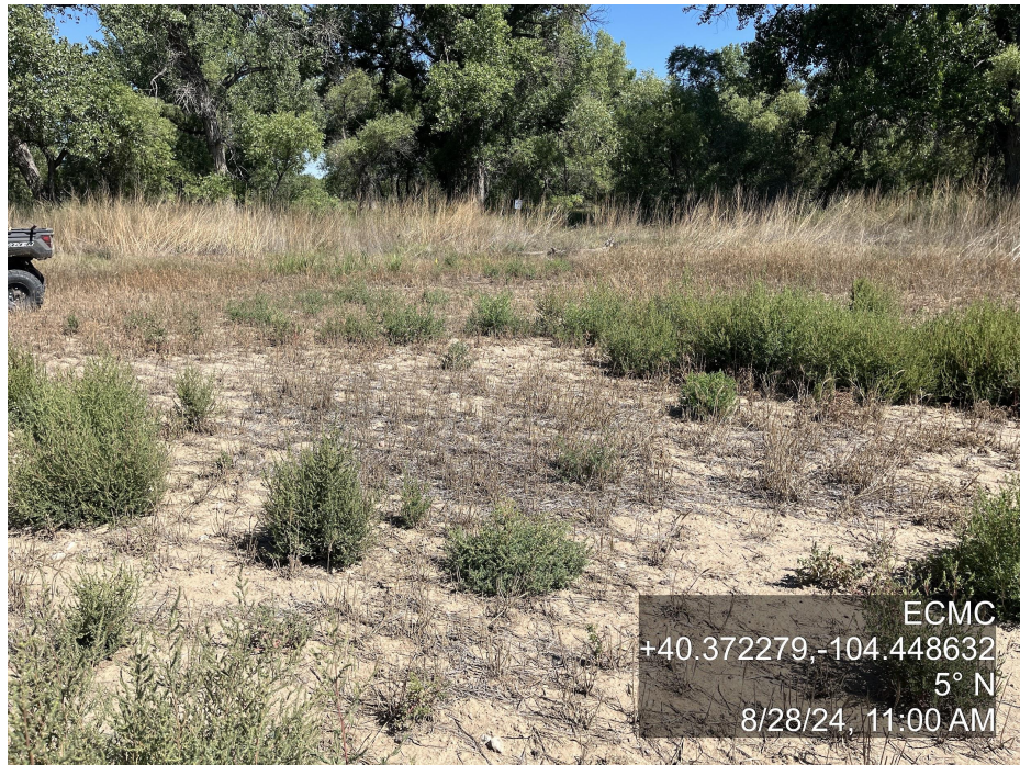
Photo 2. The photo was taken at the well location facing North. The photo illustrates the location is dominated by weeds and bare soil that is not reflective of reference areas.

Note - Cultivated wheat and cereal rye was also observed having germinated from what appeared to be the crimped straw.