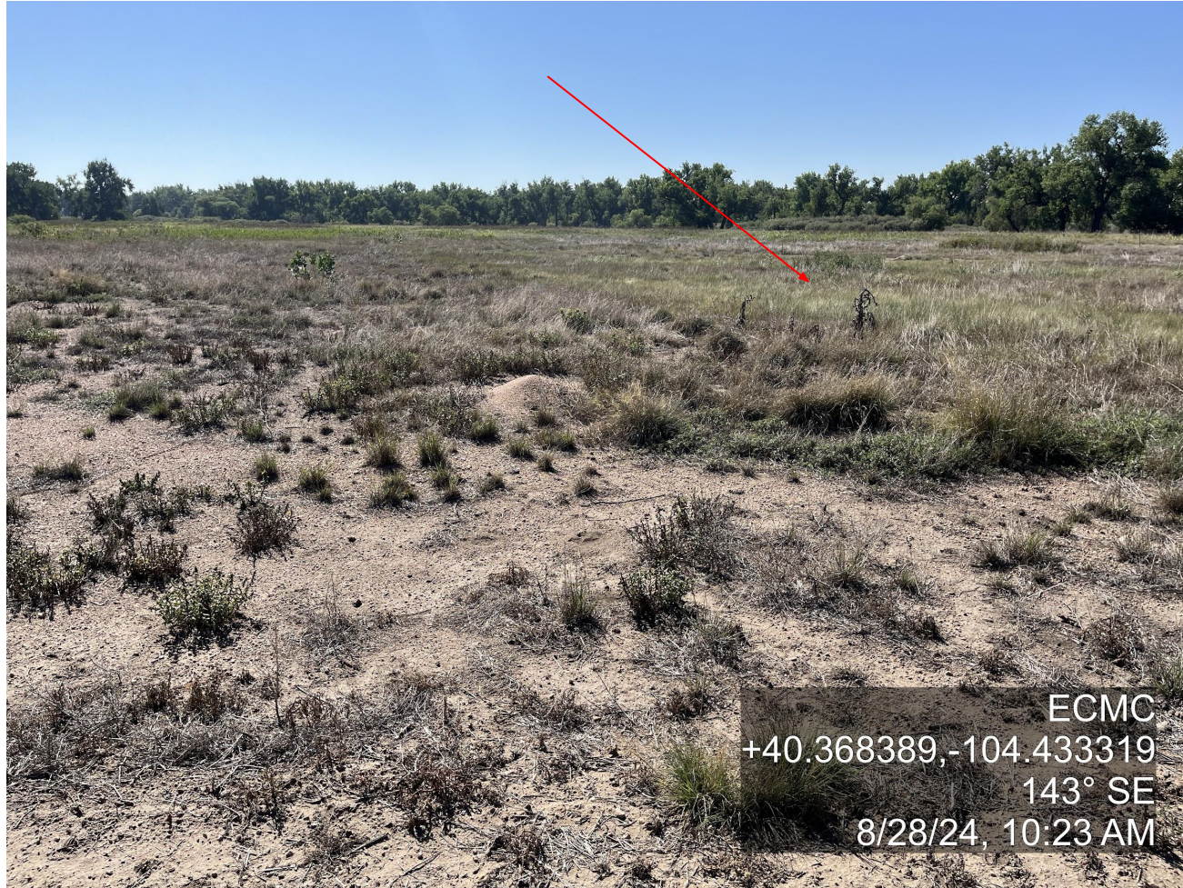
Photo 2. The photo was taken Northwest of the well location facing Southeast. The photo illustrates the approximate area of the location, noted by the Red arrow. The location appears to meet final reclamation standards however the focus of the inspection was on nearby well 123-20594 and the disturbance associated with it.