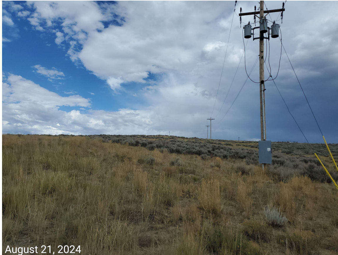
Photo 3: Photo shows utility equipment on, and leading to, the Location has not been removed.