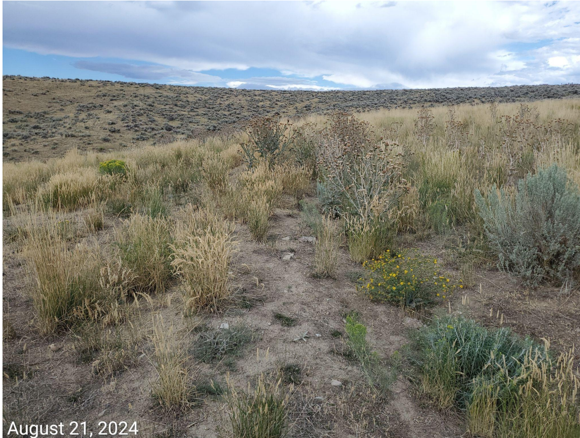
Photo 4: Photo example showing noxious weeds (Scotch thistle) established on the Location.