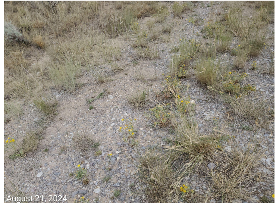
Photo 5: Photos 5-7 show access road has not been reclaimed in accordance with 1004 Rules- culverts remaining. Gravel has not been removed; road has not been decompacted, recontoured/regraded and reclaimed.