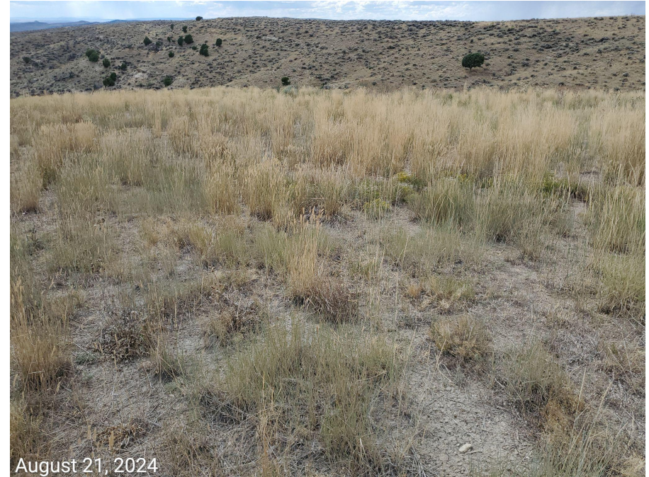
Photo 1: Photos 1-2 taken from the east end of the Location. Photos provide an overview of the Location from south, southwest, northwest to north.