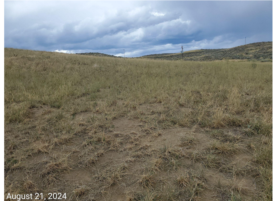
Photo 1: Photos 1-2 taken from the south end of the Location. Photos provide an overview from west, northwest, northeast to east.