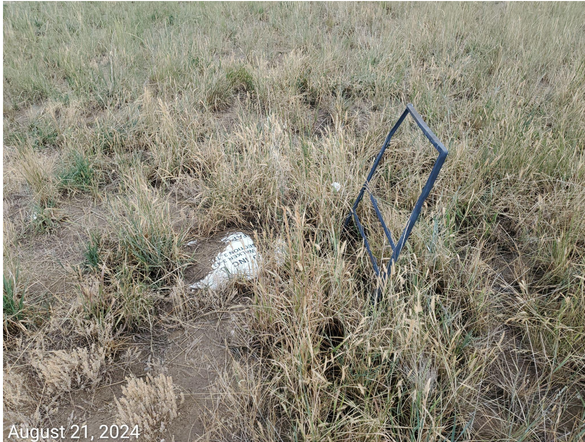
Photo 5: Signage on Location has not been maintained; signage posted with incorrect Operator information.