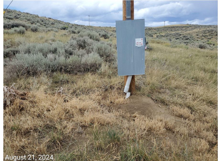
Photo 4: Photos show utility equipment on, and leading to, the Location has not been removed.