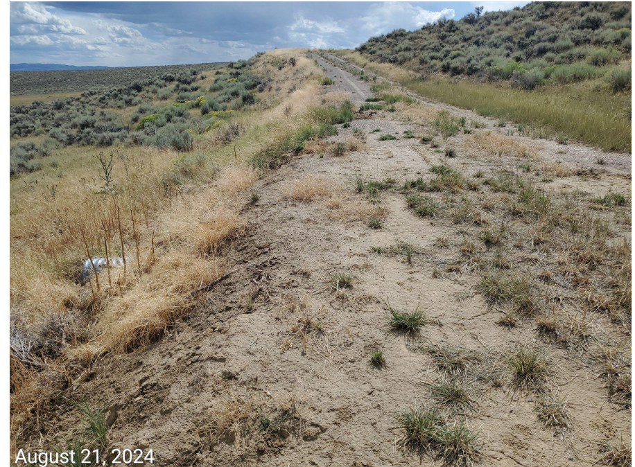
Photo 6: Photos examples showing access road to the Location has not been reclaimed.