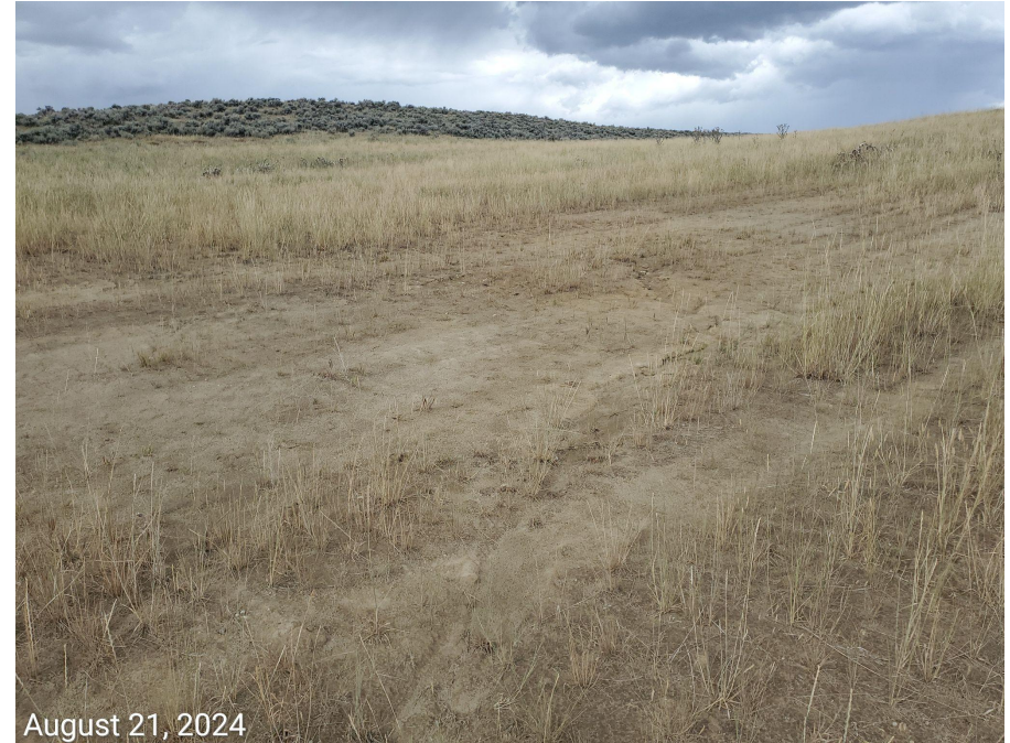
Photo 2: Photos examples showing vegetation on the Location has not achieved uniform establishment. Erosion degradation due to runoff evident.