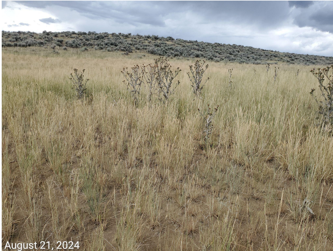
Photo 3: Photos examples of Noxious weeds (Scotch thistle) observed on the Location.