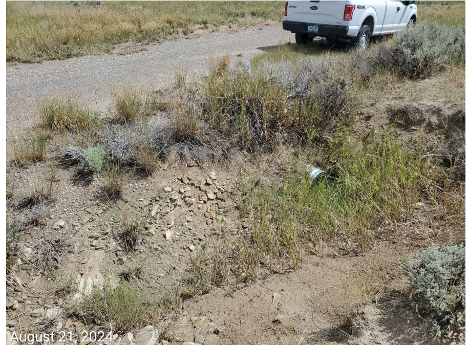
Photo 6: Photos 6-7 shows the access road to the Location has not been reclaimed. Photo right example of culverts remaining along access road.