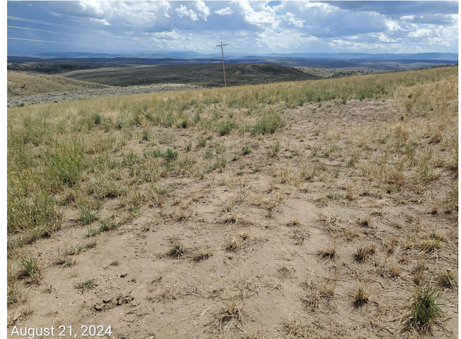
Photo 1: Photos 1-2 taken from the North end of the Location. Photos provide an overview from east, southeast, southwest to west.