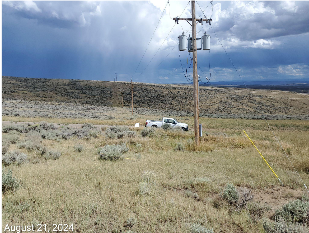
Photo 5: Photos shows Utility equipment on, and leading to, the Location has not been removed