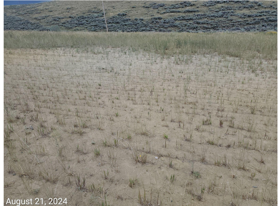
Photo 1: Photos 1-2 taken from the central areas of the Location. Photos provide an overview from north, east, south and west. Vegetative establishment, though not uniform, appears to be progressing towards 1004.c.(2) standards.