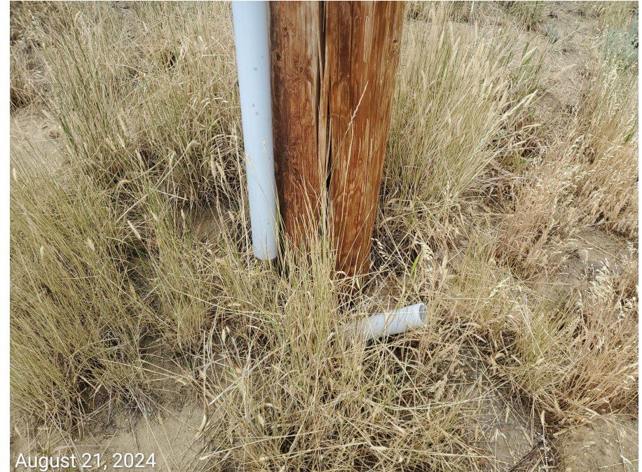
Photo 3: Photos taken from the east end of the Location, facing east. Photo shows Utility equipment on, and leading to, the Location has not been removed.