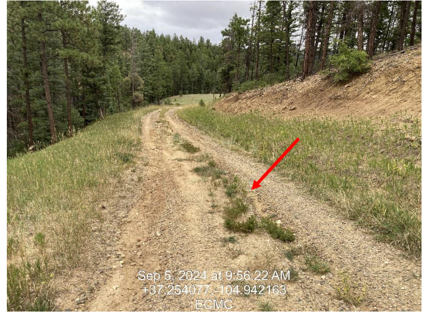
Photo 5 – Stormwater is running down the center of the access road causing riling.