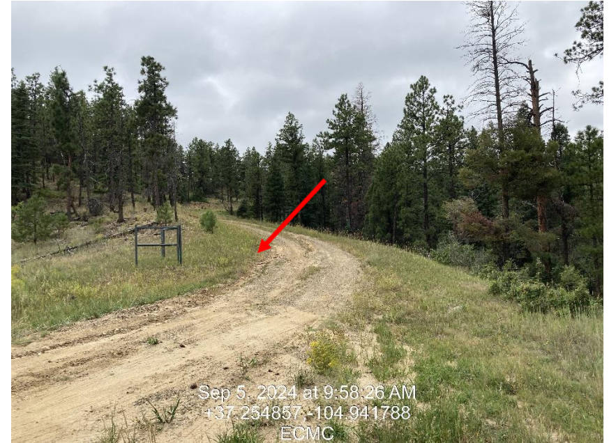
Photo 7 – Stormwater is running down the center of the access road causing riling.