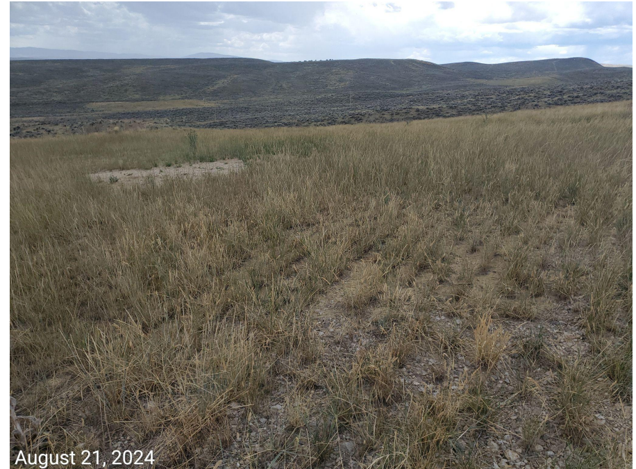
Photo 1: Photos 1-2 taken from the east end of the Location. Photos provide an overview from south, southwest, northwest to north.