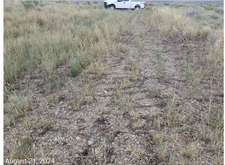
Photo 4: Reclamation work at the access road/location entrance on the east end of the Location inadequate; Operator appears to have seeded directly into the road; compaction issues and gravel remain evident.