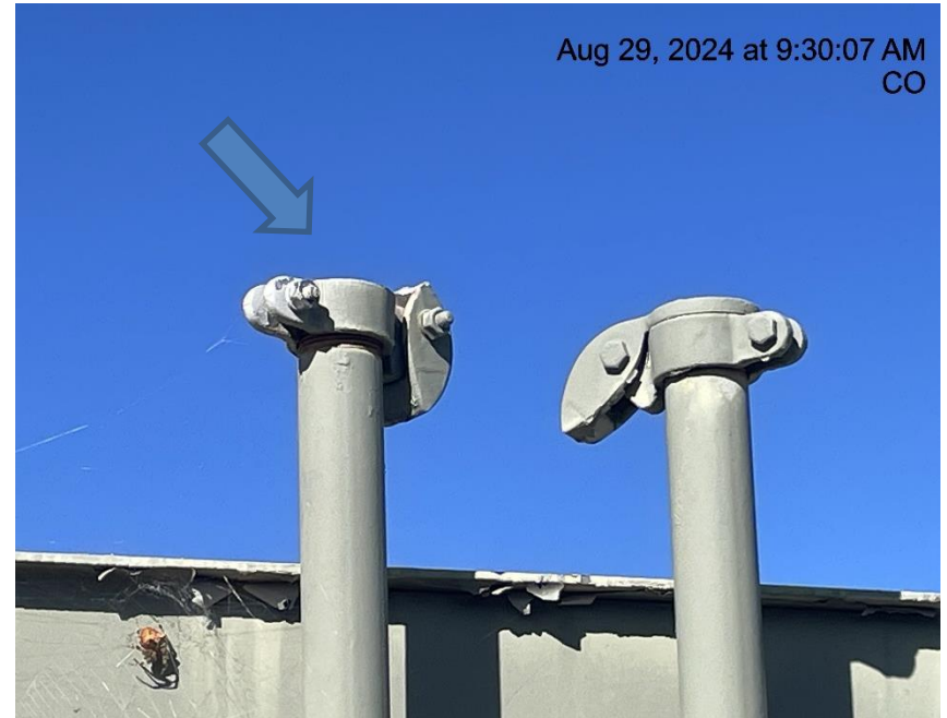
Photo # 7315 PRV vent line does not comply with CECMC pressure safety device rules