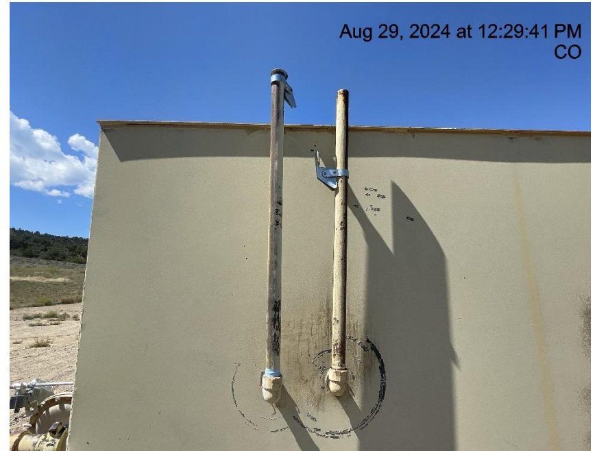
Photo # 7543 Rupture disc vent line does not comply with CECMC pressure safety device rules