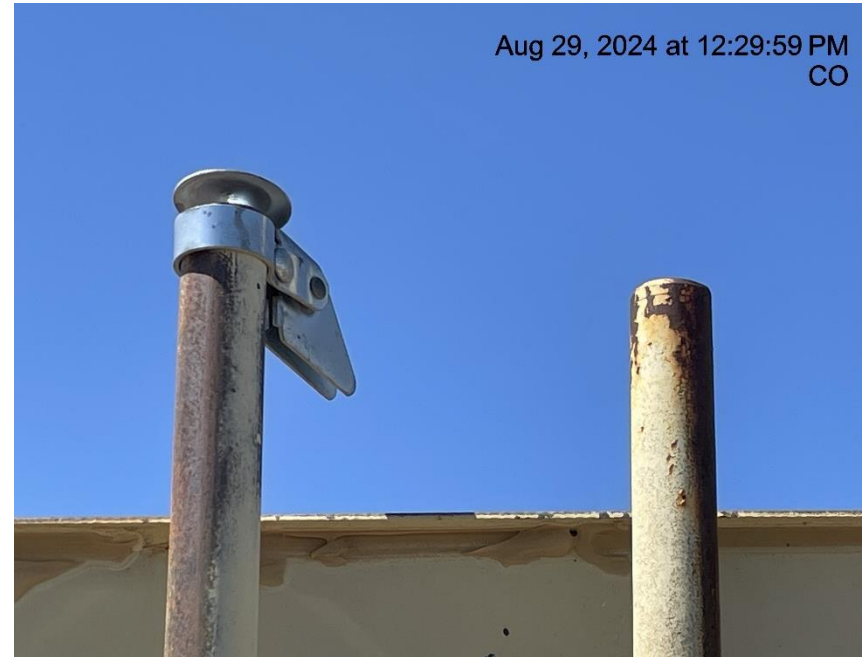
Photo # 7544 Rupture disc vent line does not comply with CECMC pressure safety device rules