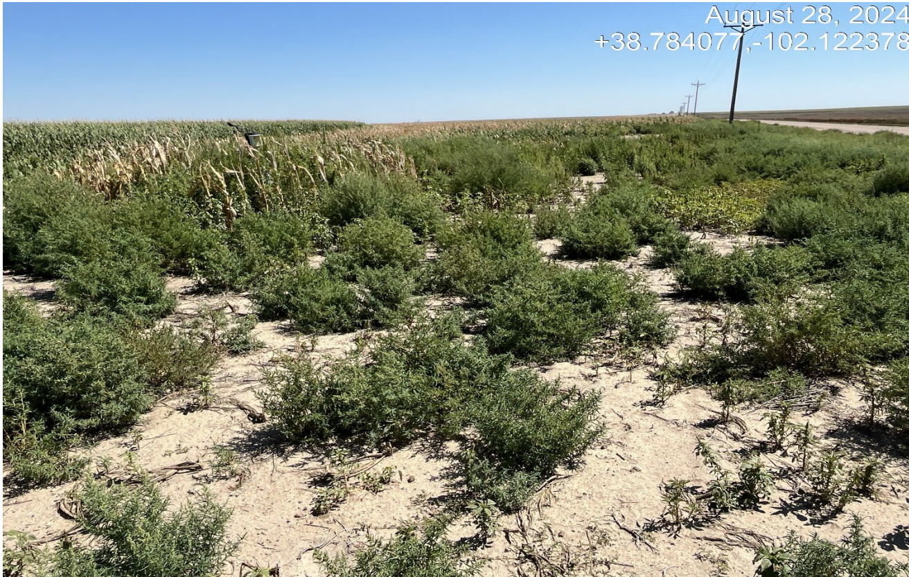
Photo 1. Facing east at the associated tank battery location. This area was planted to corn but the corn did not establish and there are undesirable weeds.