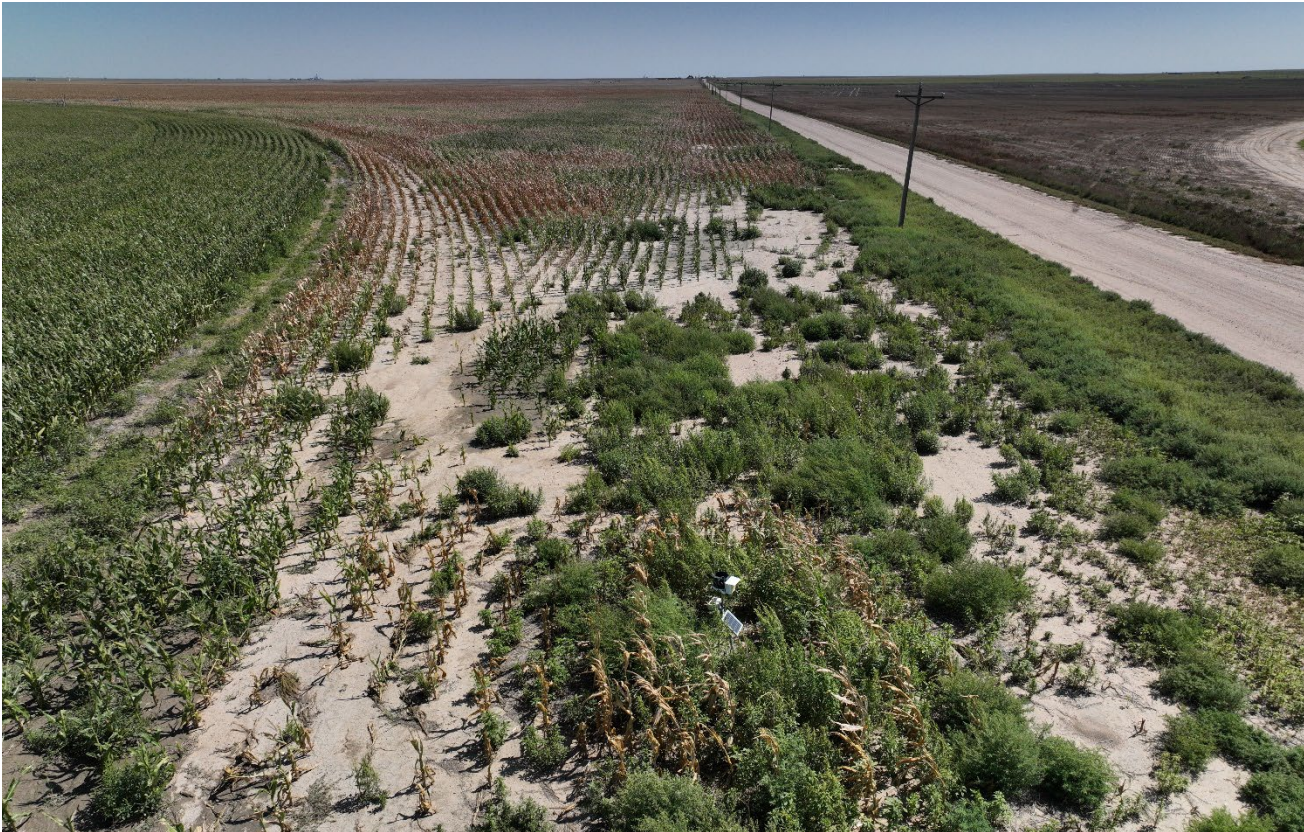
Photo 3. Drone aerial photo facing east down toward the associated tank battery location. There is impacted crop growth in this area.