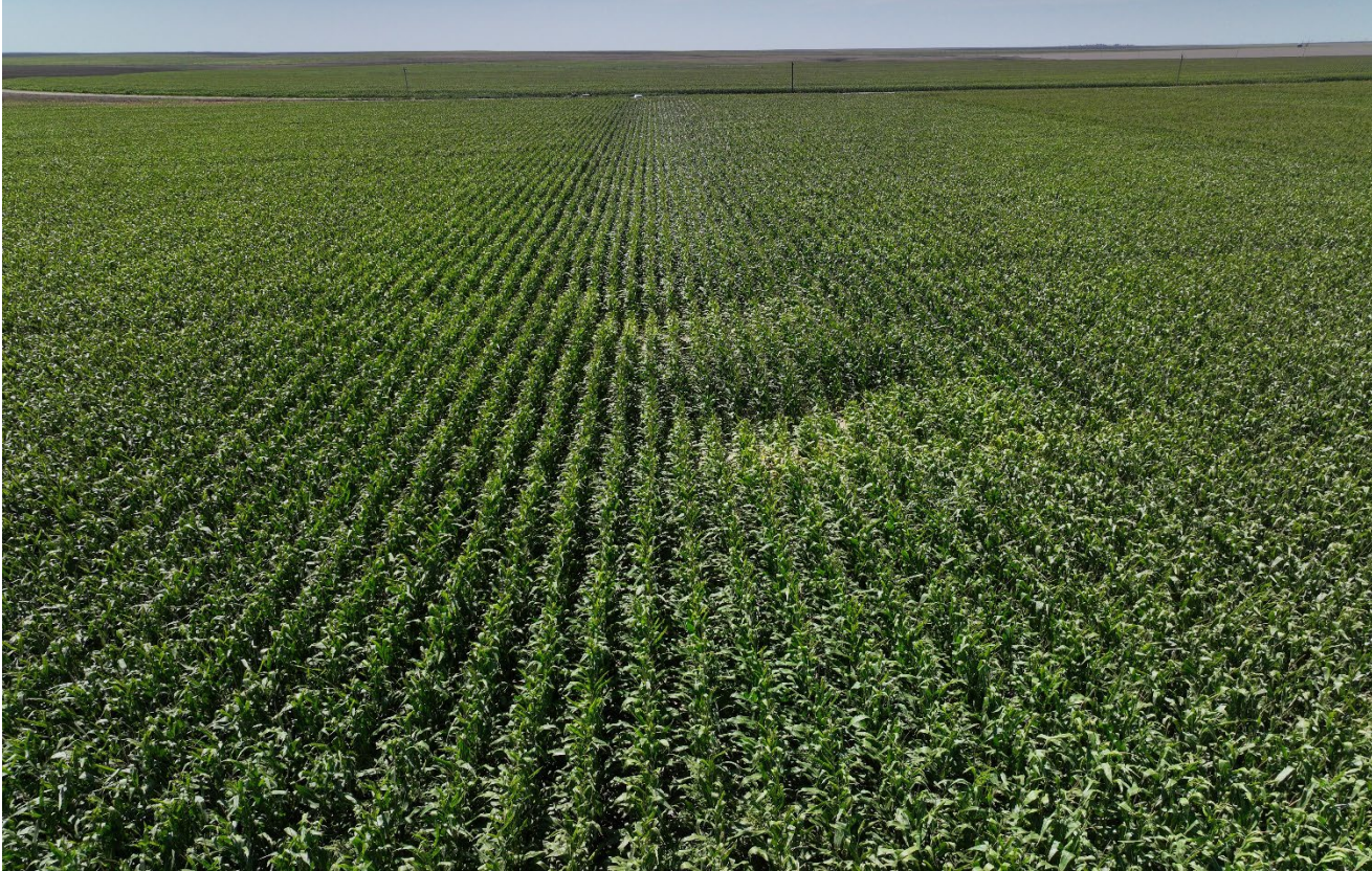
Photo 6. Facing south overlooking the abandoned wellsite. The crop appears to have uniformly reestablished.