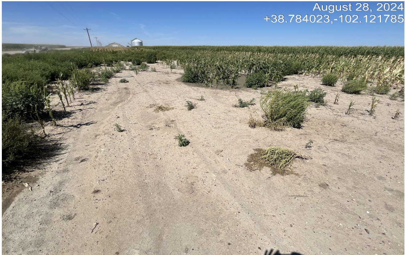
Photo 2. Facing east at the associated tank battery location. This area was planted to corn but the corn did not establish and areas of no crop growth.