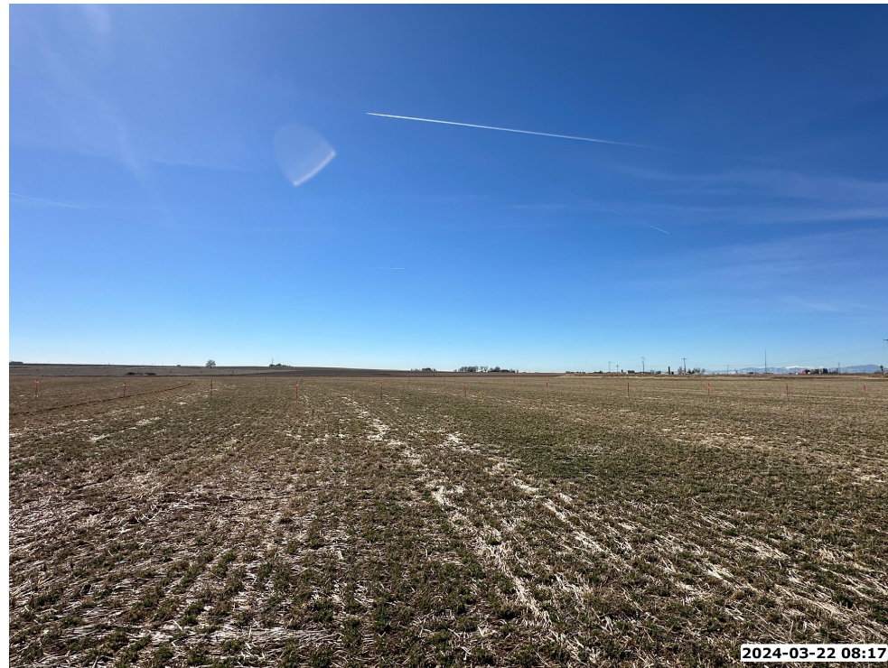
LOCATION PICTURE OF TULIP WELL PAD - CAMERA VIEW SOUTH