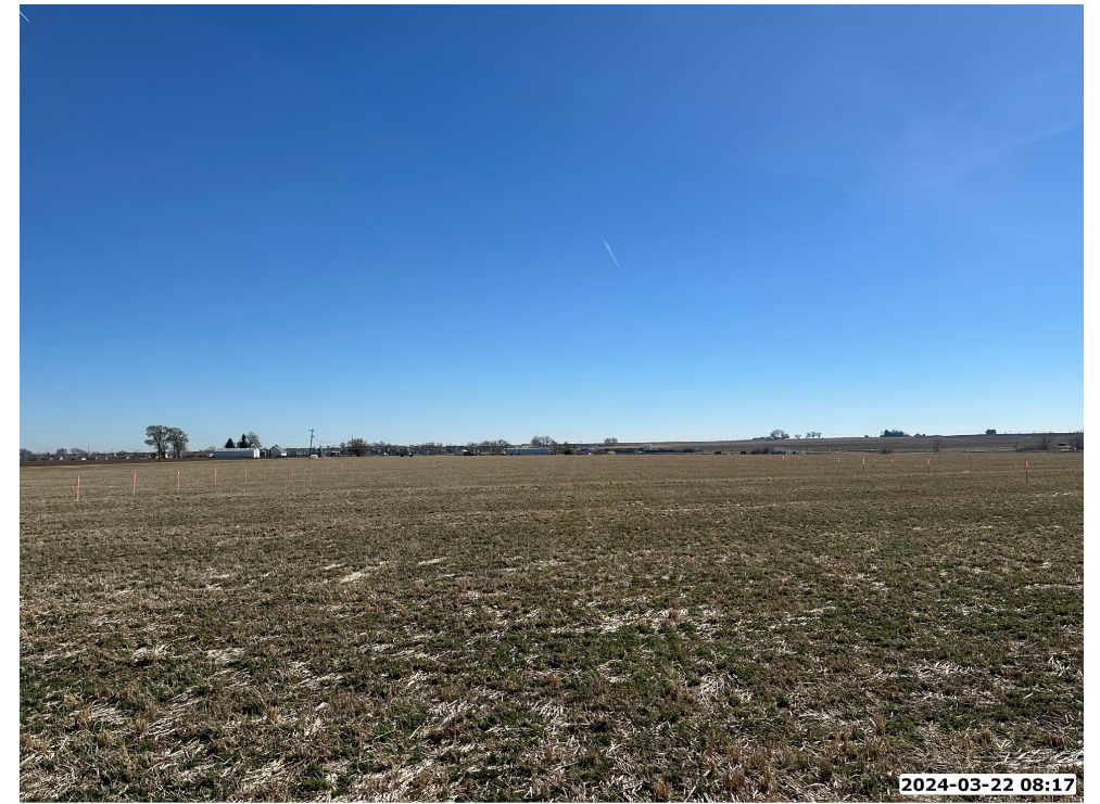
LOCATION PICTURE OF TULIP WELL PAD - CAMERA VIEW EAST