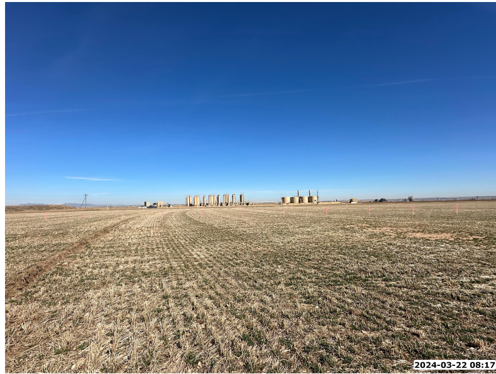
LOCATION PICTURE OF TULIP WELL PAD - CAMERA VIEW NORTH

NW1/4 NE1/4 SECTION 30, TOWNSHIP 4 NORTH, RANGE 67 WEST, 6TH P.M., WELD COUNTY, COLORADO