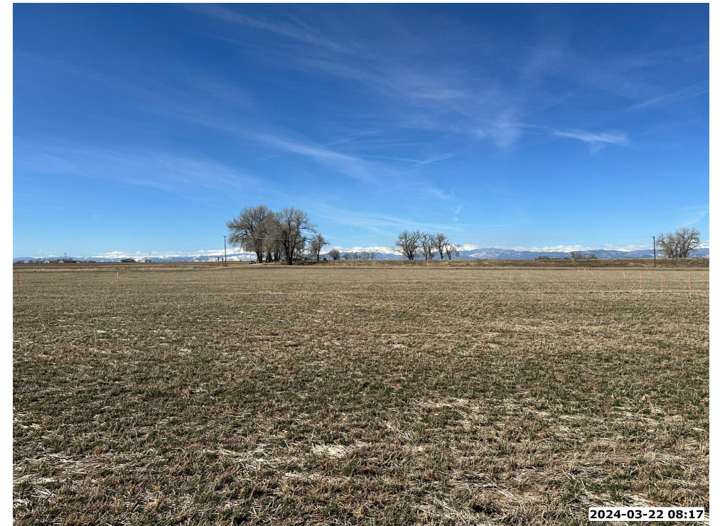
LOCATION PICTURE OF TULIP WELL PAD - CAMERA VIEW WEST

K:\AMDRK\2018\219_TULIP_INVGEN_8_OLSON_THM_R67W_SEC_30\DWG\TULIP_THM_R67W_SEC_30.DWG, 4/29/2024 11:43:39 PM, sundberg