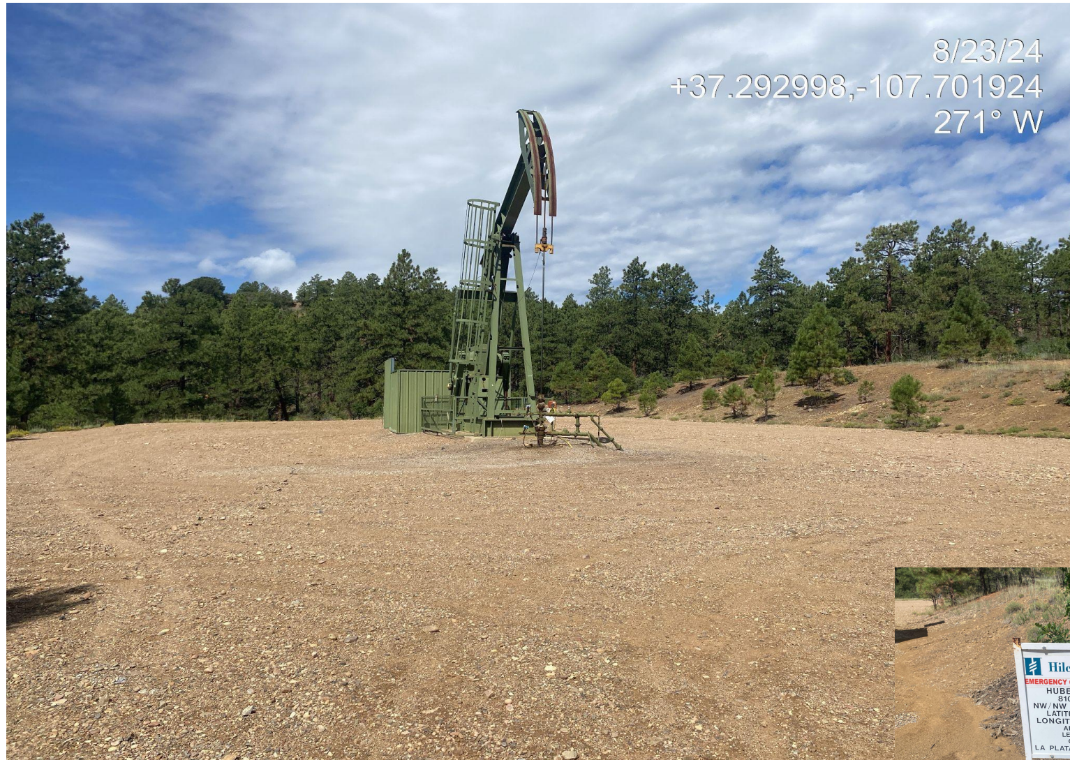
Photo 1. View of well pad taken from the access point facing center.