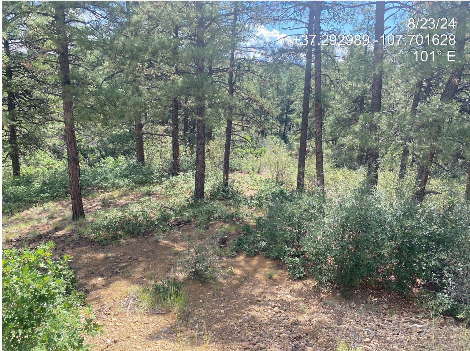
Photo 4. Reference area comprised of Indian ricegrass, Gambel oak and Pine.