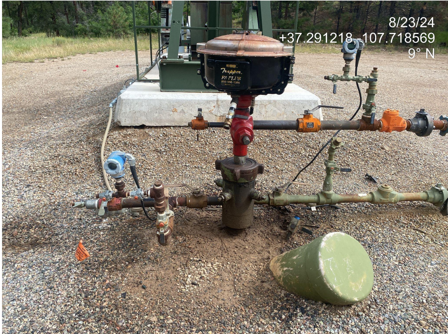
Photo 2. Impacted surface material has been removed from around the well head.

Inspection Photos Location Name: Tycksen A 1 Location ID: 325914