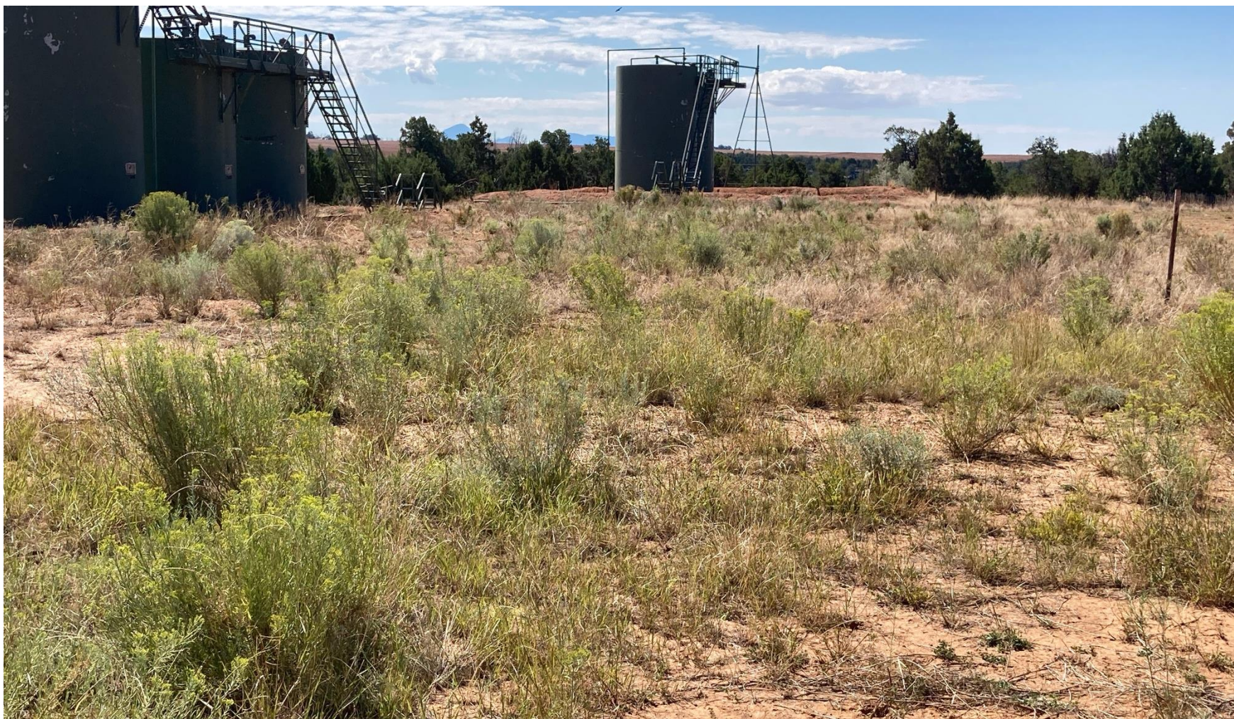
PHOTO 7: WEEDS THROUGHOUT LOCATION HAVE NOT BEEN MAINTAINED. MAINTAIN WEEDS PER RULE 606.