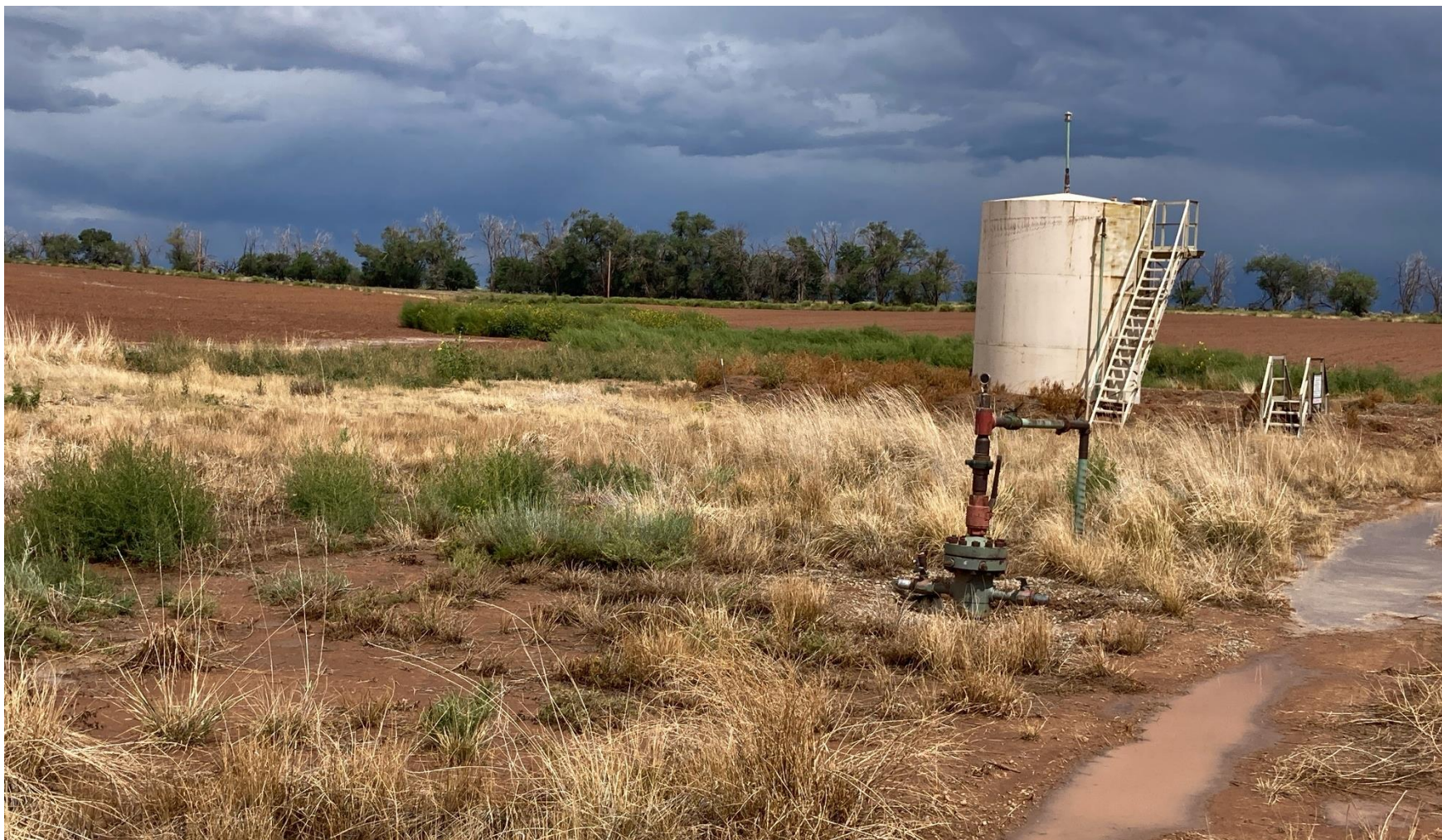
PHOTO 3: WELLHEAD AND EQUIPMENT/ WEEDS AROUND WELLHEAD. MAINTAIN WEEDS PER RULE 606.