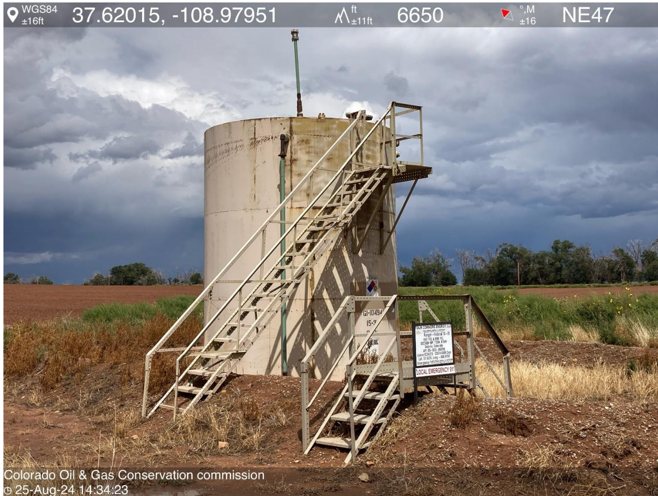
PHOTO 4: TANK BATTERY/ WEEDS ON AND IN TANK BATTERY BERMS. REMOVE WEEDS ON AND INSIDE TANK BATTERY BERMS PER RULE 606.