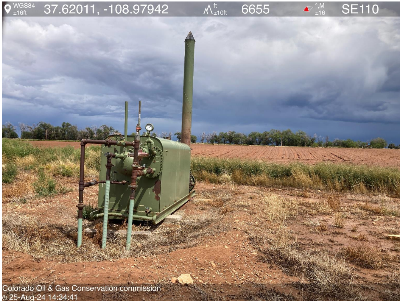
PHOTO 5: TANK BATTERY/ WEEDS ON AND IN HEATED SEPARATOR BERMS. REMOVE WEEDS ON AND INSIDE HEATED SEPARATOR BERMS PER RULE 606.