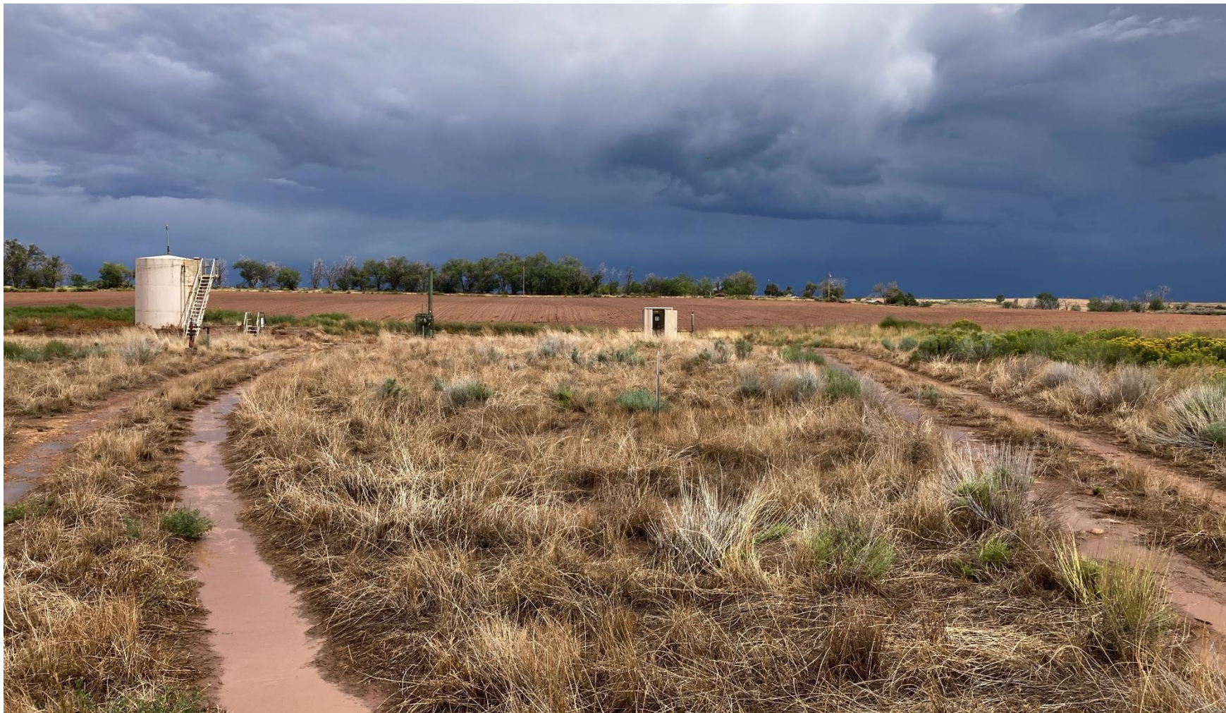
PHOTO 2: LOCATION/ WEEDS AROUND LOCATION NOT MAINTAINED. MAINTAIN WEEDS PER RULE 606.