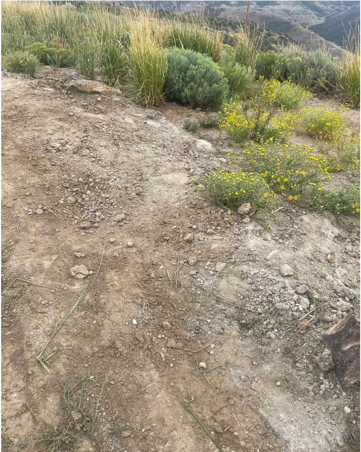
Erosion that has been fixed.