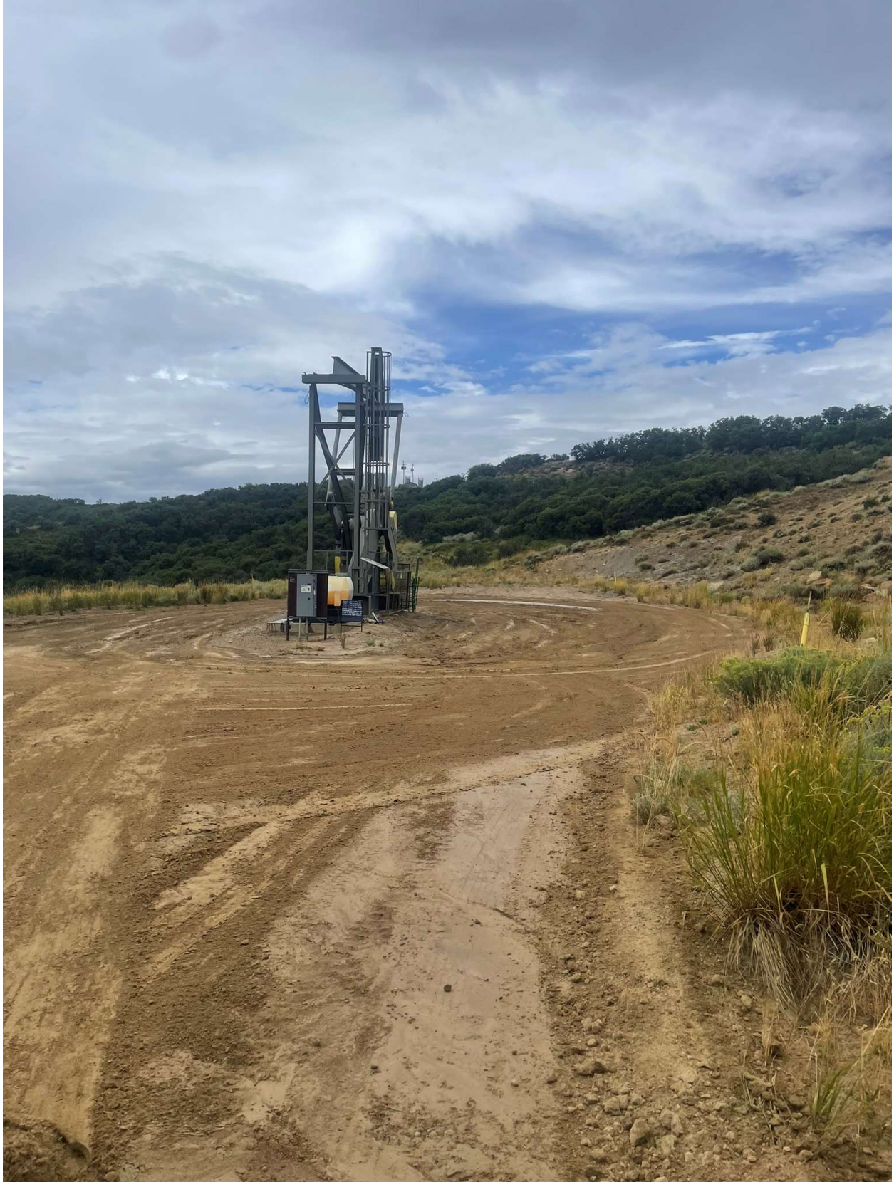
Erosion that has been fixed.