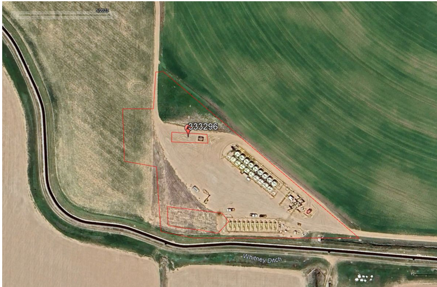
Photo 8. Google Earth aerial imagery (circa 05/2023) illustrating the Great Western/PDC location after the wells and tank battery were decommissioned.