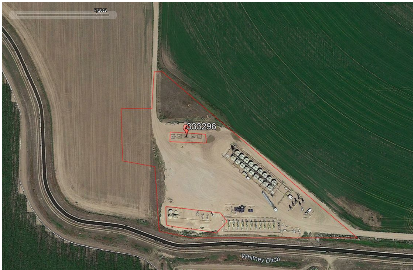
Photo 7. Google Earth aerial imagery (circa 07/2019) illustrating the Great Western/PDC location after the active tank battery operated by Extraction Oil & Gas was constructed and before the Great Western/PDC location underwent final reclamation.