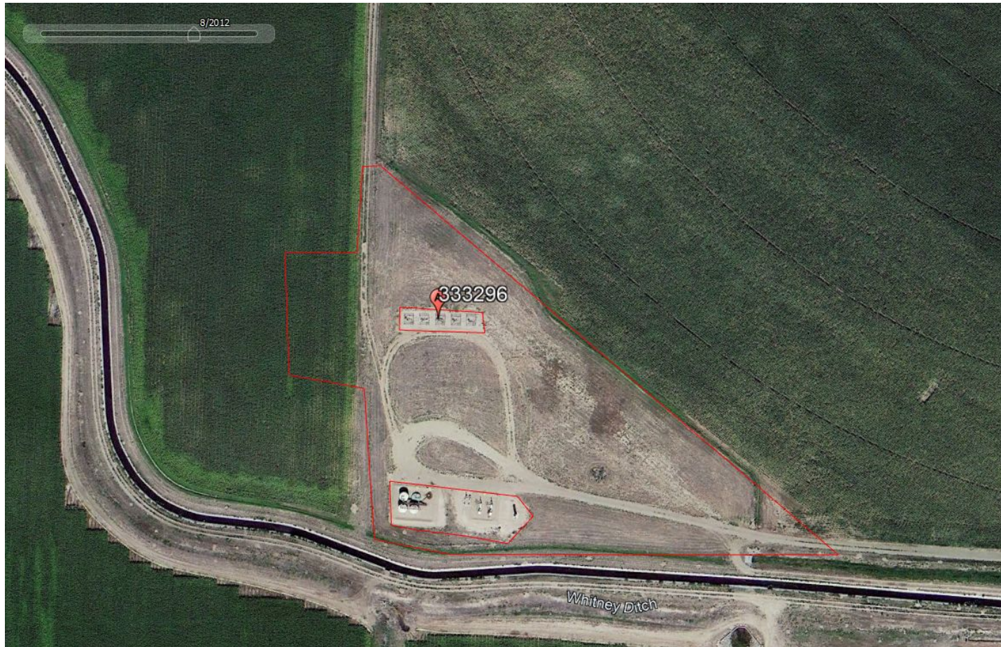
Photo 6. Google Earth aerial imagery (circa 08/2012) illustrating the Great Western/PDC location after interim reclamation activities were performed.