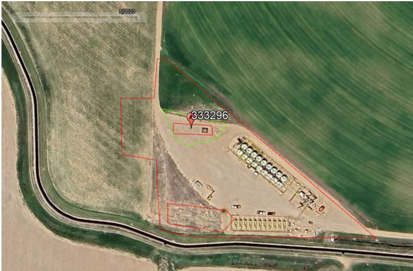
Photo 9. Green polygon illustrates areas that require additional final reclamation activities. Note - green polygon is only approximate as this area does not appear to be in use by the active tank battery location.