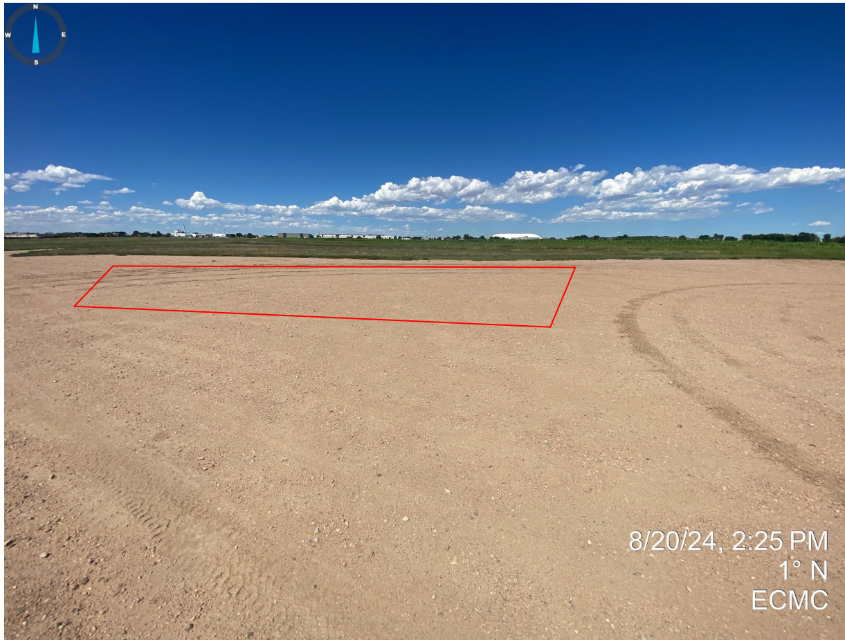
Photo 1. Red polygon illustrates approximate location of former PDC wells. It does not appear that the former well location has been reclaimed with evidence of road base material still observed. This portion of the former location does not appear to be in use by the active tank battery operated by Extraction Oil & Gas.