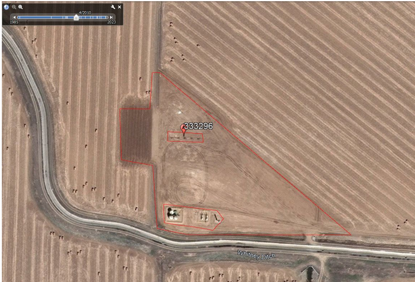
Photo 5. Google Earth aerial imagery (circa 04/2010) illustrating the Great Western/PDC location footprint prior to any additional oil and gas activity. Red outlines indicated wells, tank battery, and approximate extent of original disturbance.