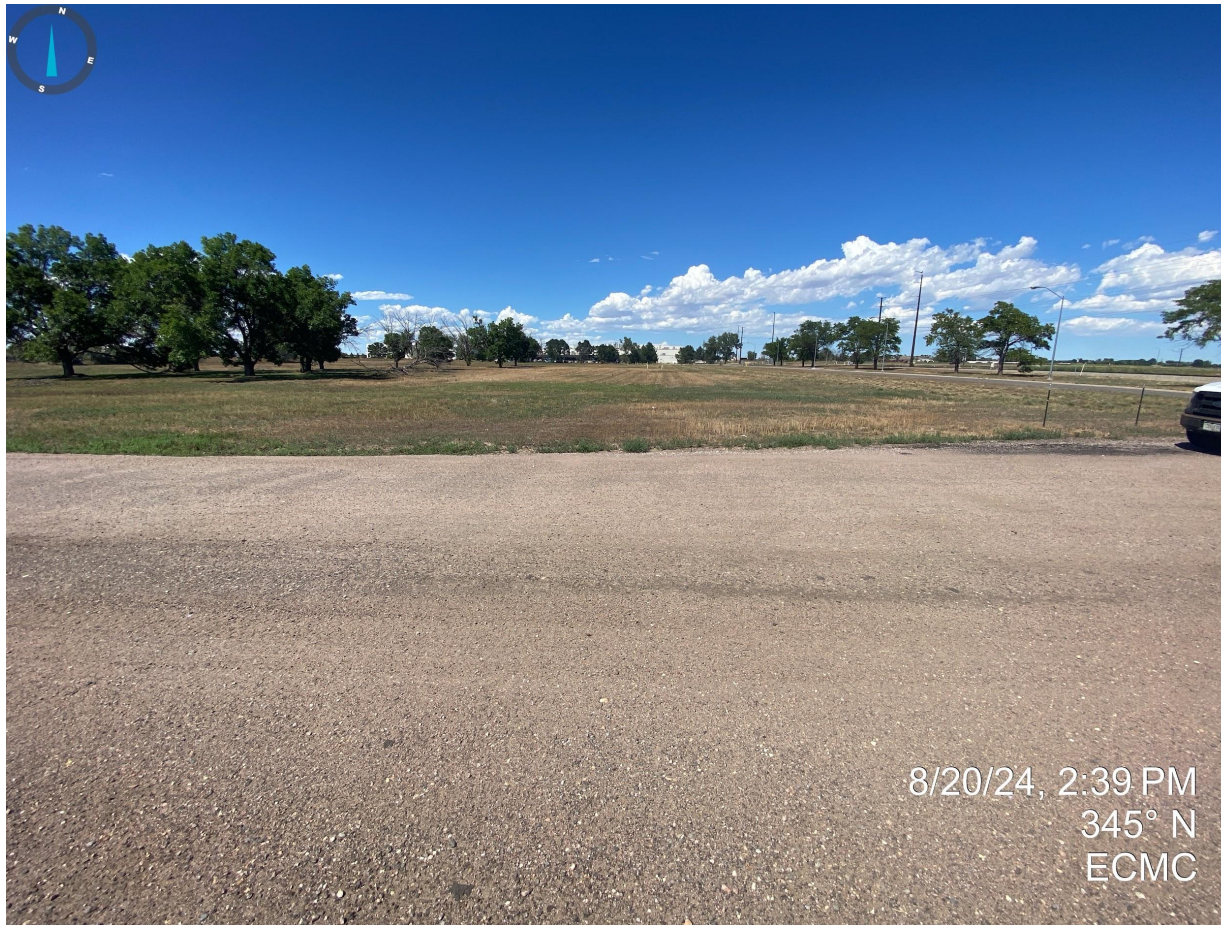
Photo 1. Facing north. The well location (Location ID 333030 with well APIs 123-23573 (PA), 123-23574 (PA), 123-23575(PA), 123-23572 (AL) and 123-23576 (AL)) meets final reclamation regulations and standards. Unable to find evidence of oil and gas activities and/or disturbances. The former well location has been paved over and turned into a road for industrial use and the former tank battery location has been superseded by an active location (333035).