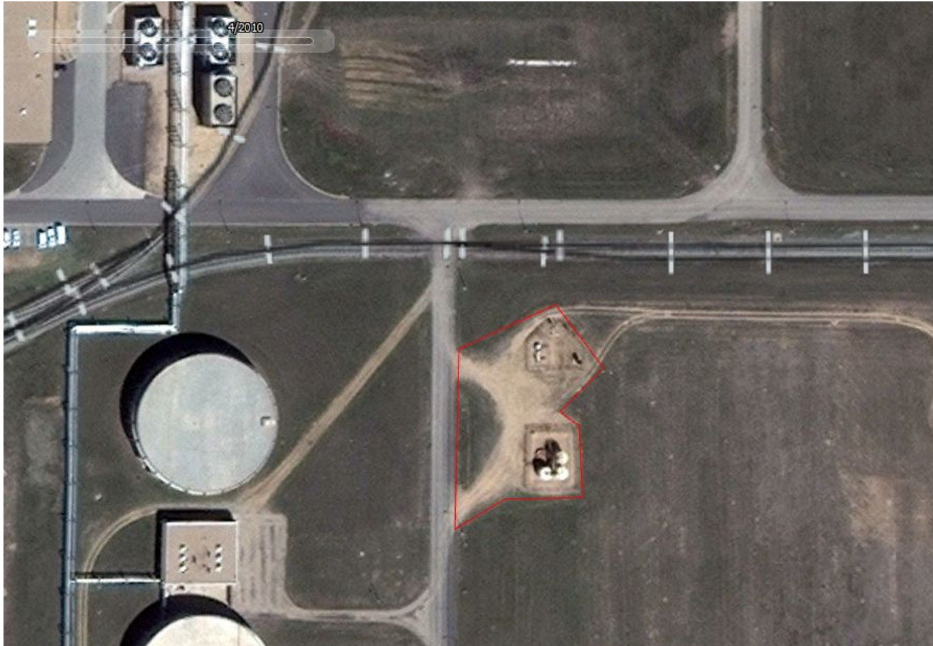
Photo 5. Google Earth aerial imagery taken circa 04/2010 illustrating the associated tank battery in red polygon.