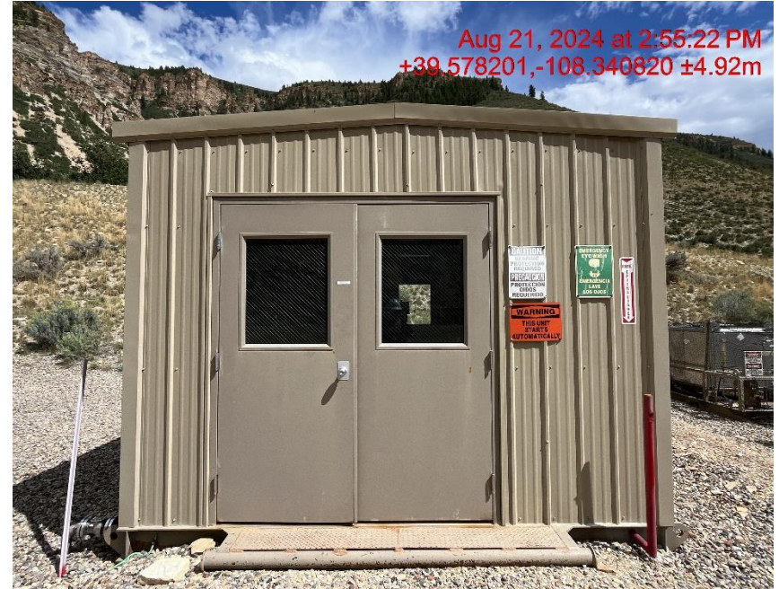
Air compressor building - Photo #04915