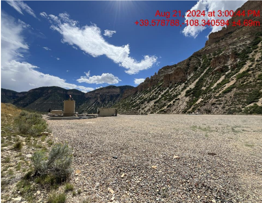
NE corner of location - Photo #04919