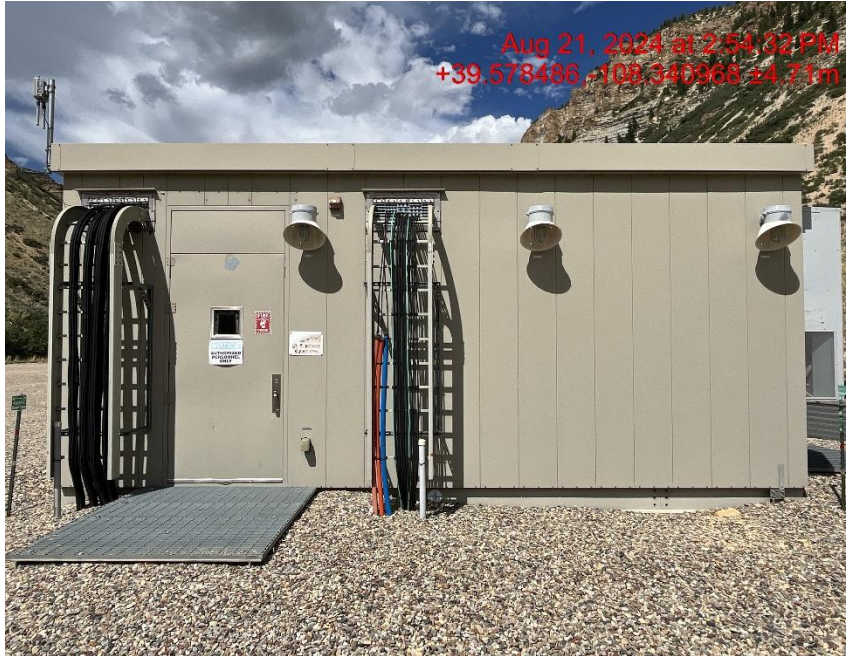
Control building - Photo #04914