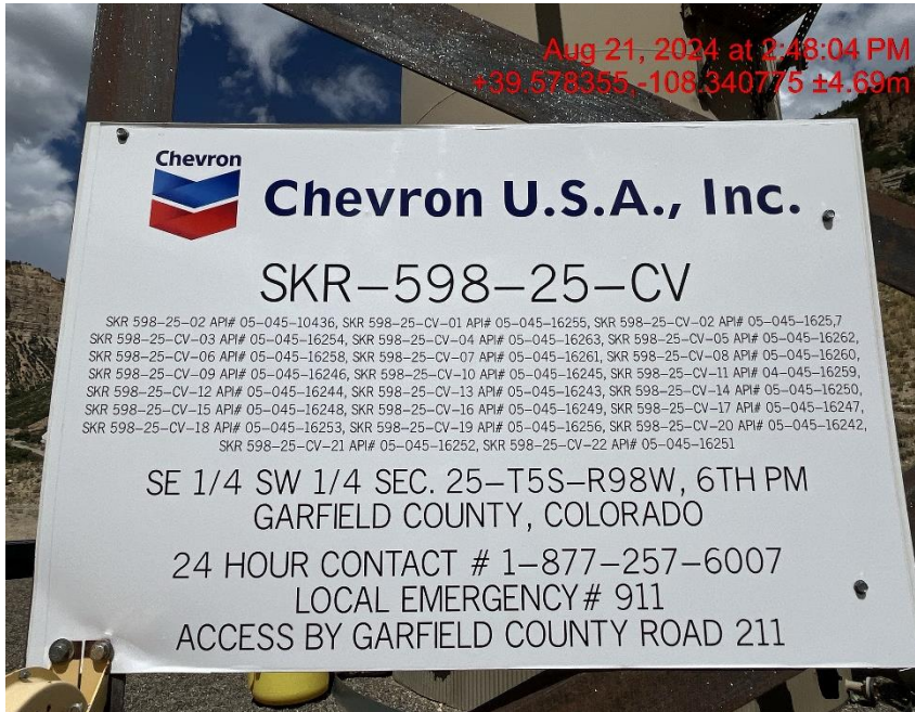
Location - Photo #04908