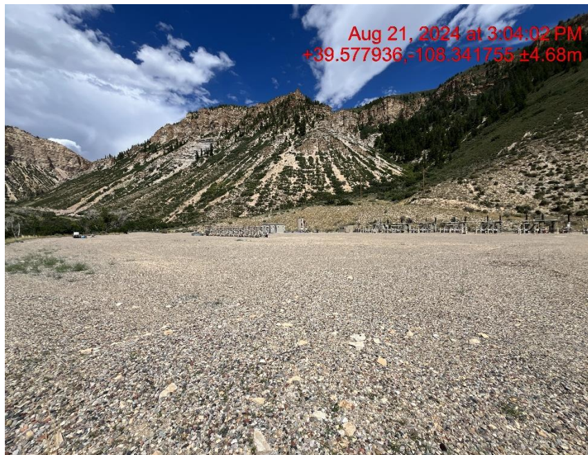
SW corner of location - Photo #04921