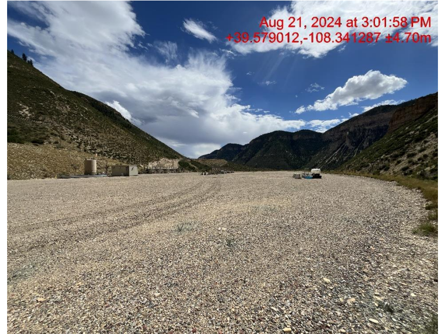
NW corner of location - Photo #04920