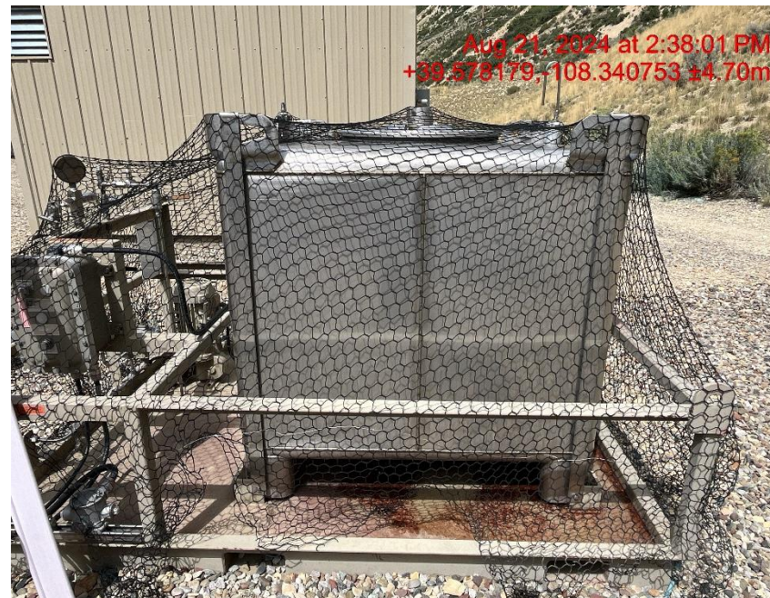
No tank labeling - Photo #04891