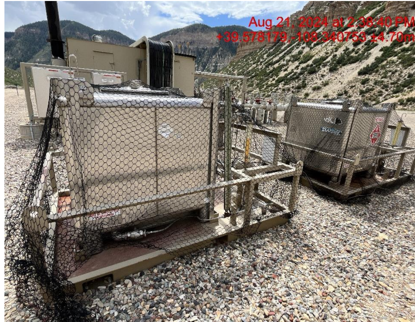
No tank labeling - Photo #04892