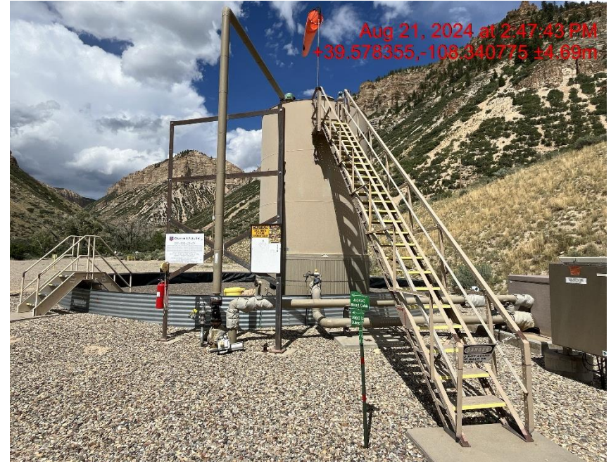
Tank battery - Photo #04907