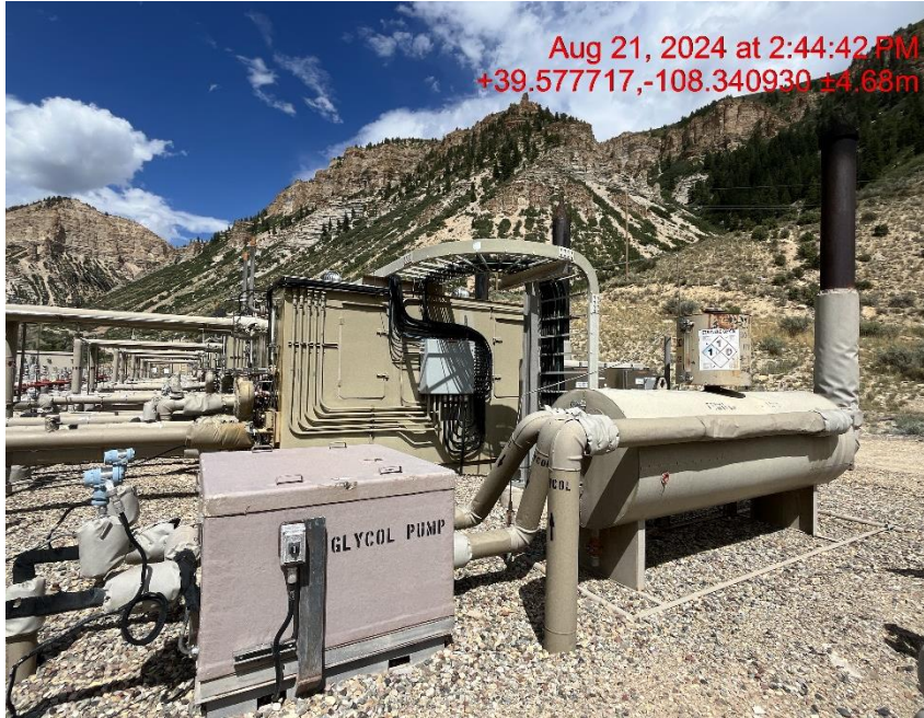
Glycol heater/pump - Photo #04904