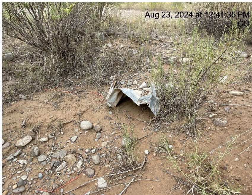
Photo # 6230 Culvert inlet shows some signs of damage & sediment buildup (on lease road near entrance to location)