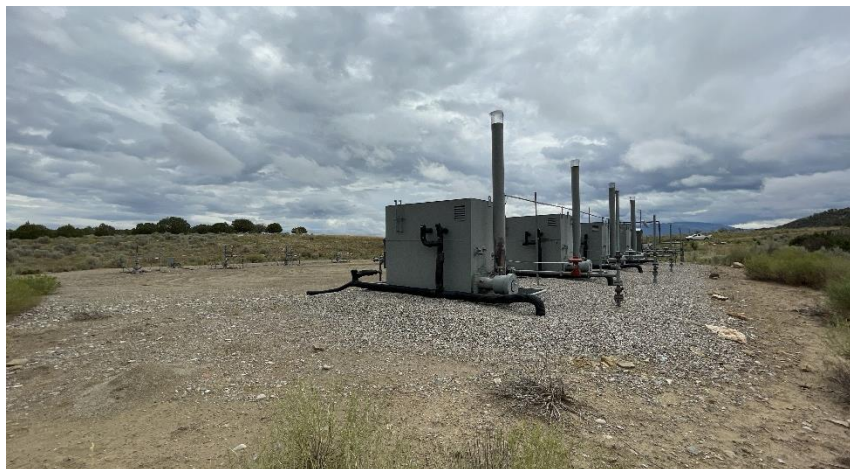
North West corner of location.