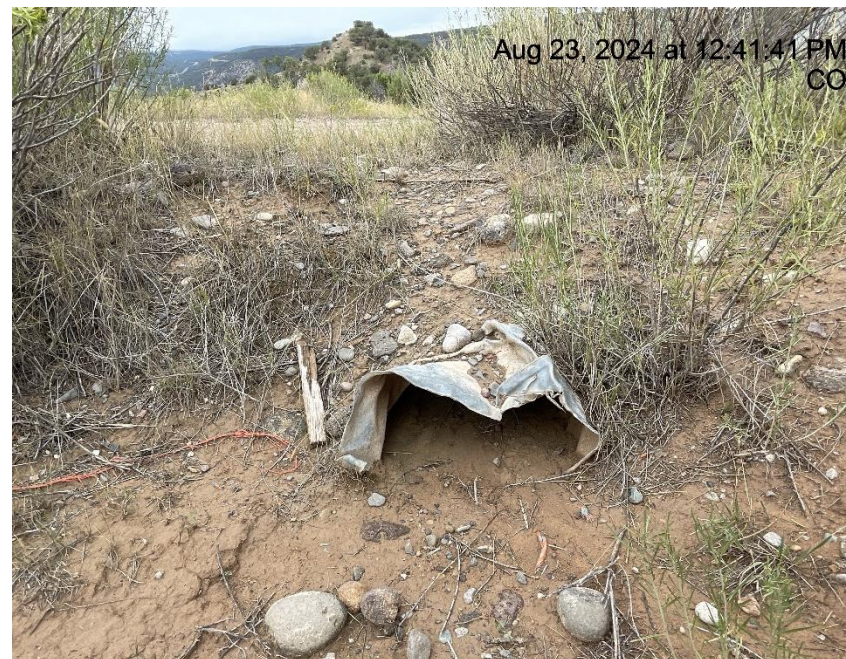
Photo # 6231 Culvert inlet shows some signs of damage & sediment buildup (on lease road near entrance to location)