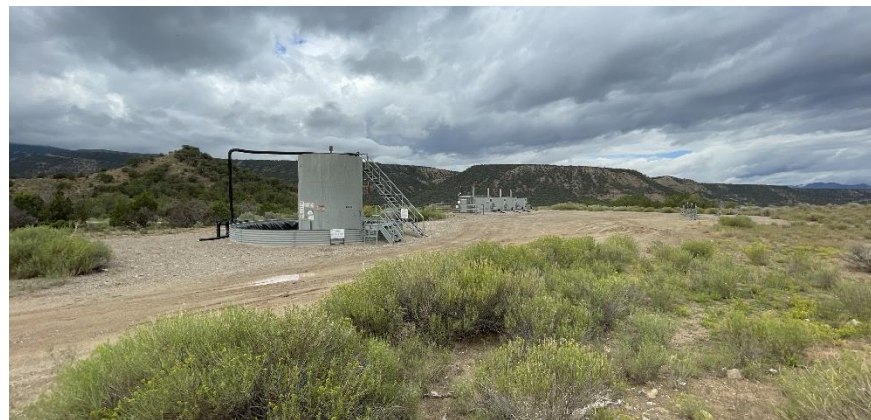
South East corner of location.