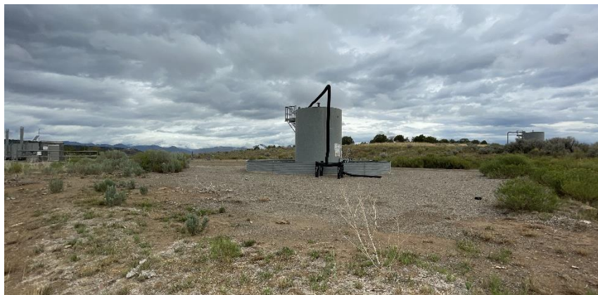
South West corner of location.