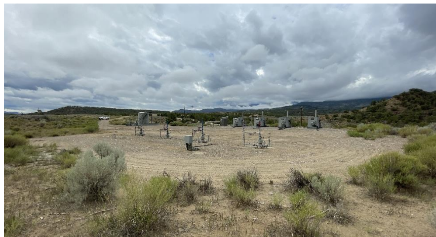
North East corner of location.