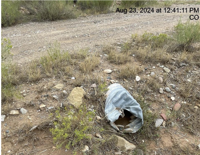
Photo # 6232 Culvert outlet shows some signs of damage (on lease road near entrance to location)