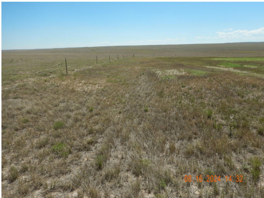
Photo 3. Photo taken from the northeastern pit area within the fenced area, facing South. Photo illustrates the pit area meets vegetation Rule 1004 standards.