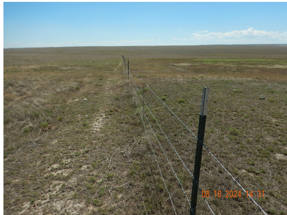
Photo 4. Photo taken from the northeastern pit area outside the fenced area, facing South. Photo illustrates the pit area meets vegetation Rule 1004 standards.

Note- based on the Photo#1, it would appear that the pit disturbance extended beyond the fenced area.