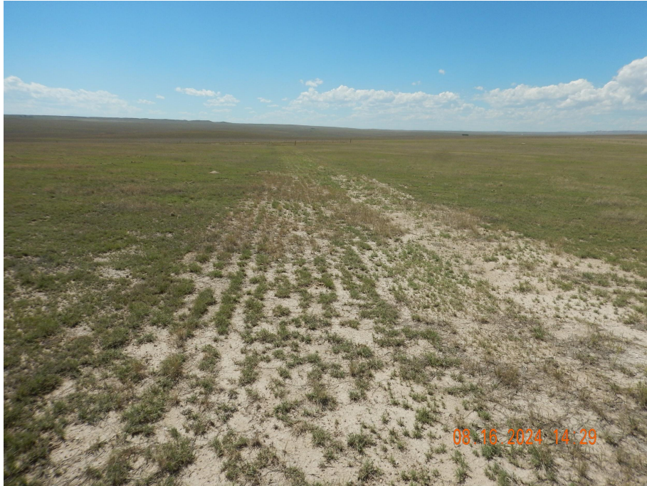
Photo 3. Photo taken from the eastern access road, facing West. Photo illustrates vegetation establishment along the access road is in-process but additional reclamation activities would be recommended along the eastern half of the access road.