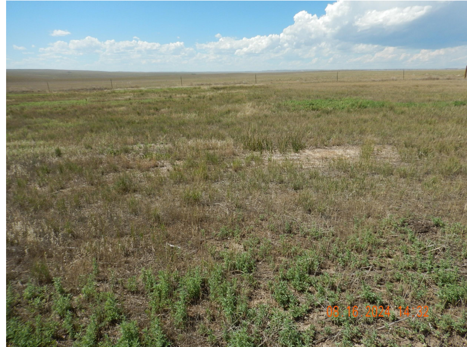
Photo 8. Photo taken from the central pit area, facing West. See comments under Photo 7.