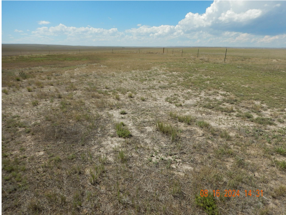
Photo 5. Photo taken from the northeastern pit area, facing West. Photo illustrates the northern half is mostly vegetated and reflective of reference areas.