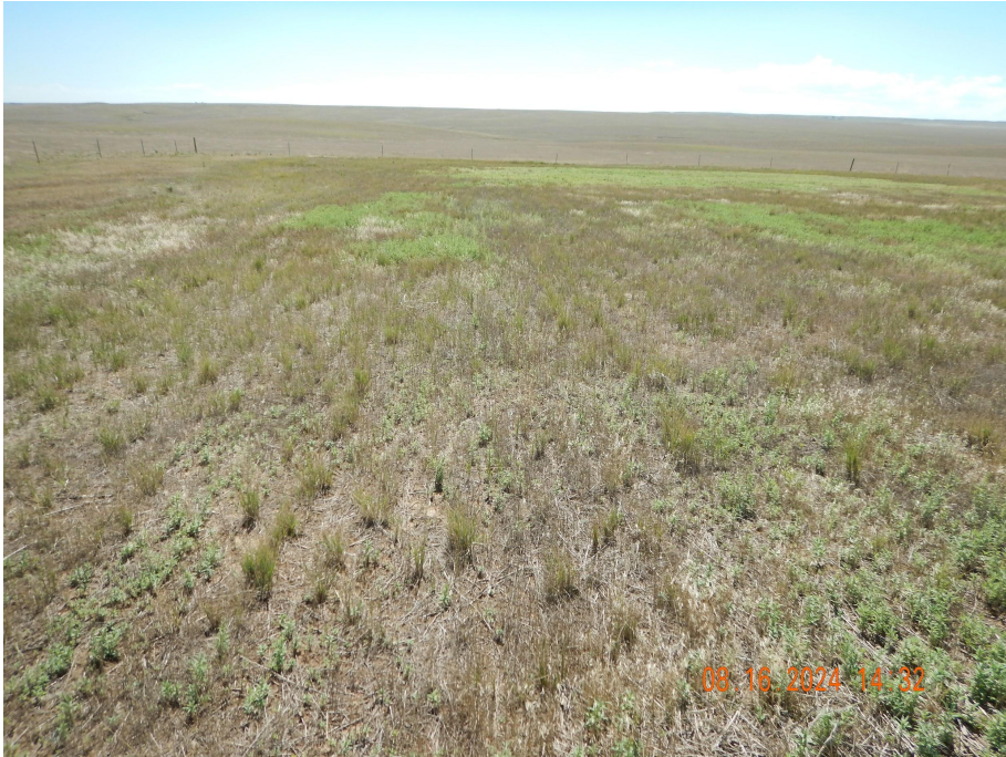
Photo 7. Photo taken from the central pit area, facing South. Photo illustrates the southern half has a higher abundance of annual, weedy vegetation of tumbleweeds and cheatgrass.