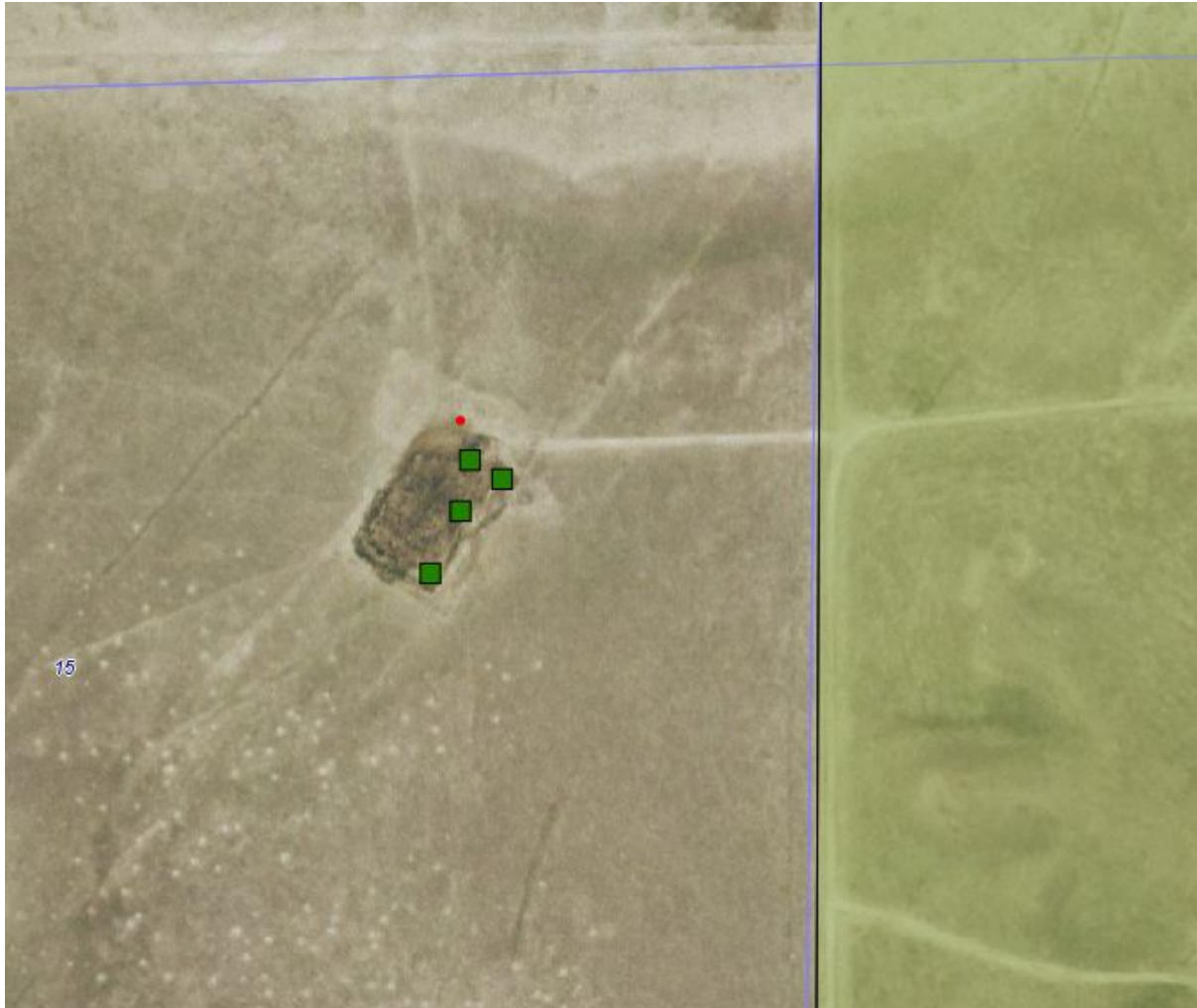
Photo 1. 2021 aerial imagery illustrates the pit area that had four (4) different pits- see Photo 2. Operator has assumed responsibility for final reclamation of the pit area.