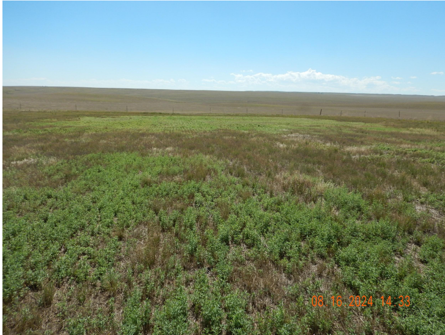
Photo 9. Photo taken from the southern pit area, facing South. Photo illustrates a higher abundance of annual, weedy vegetation of tumbleweeds and cheatgrass.