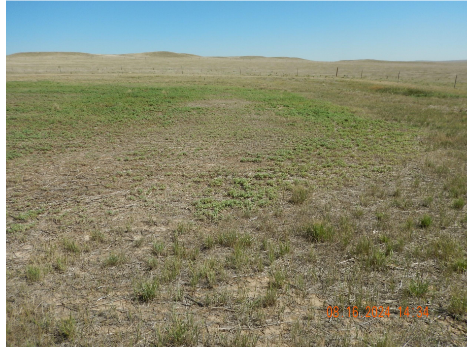
Photo 10. Photo taken from the southern pit area, facing East. See comments under Photo 9.