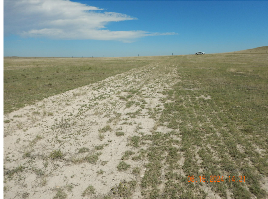
Photo 4. Photo taken from the western access road, facing East. See comments under Photo 3. Additional reclamation activities are needed for the western half of the access road.