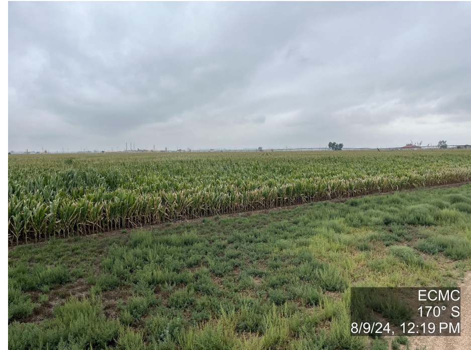
Photo 3. The photo was taken at the entrance to the well location facing Southeast. Refer to the comment for photo 1.

Photo 4. The photo was taken at the entrance to the well location facing South. Refer to the comment for photo 1.