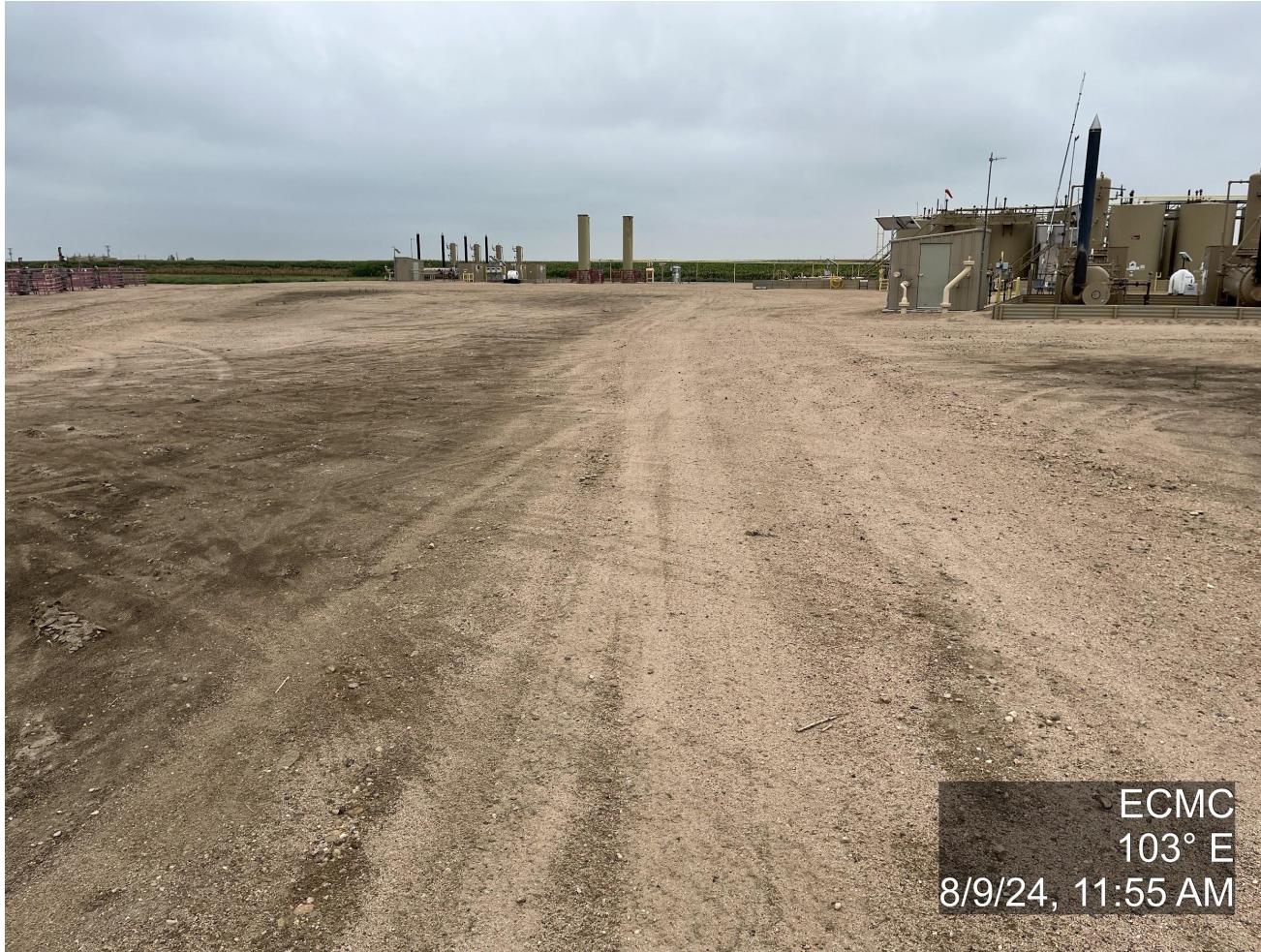
Photo 5. The photo was taken at the tank battery location facing East. The photo illustrates the tank battery remains active for nearby wells.