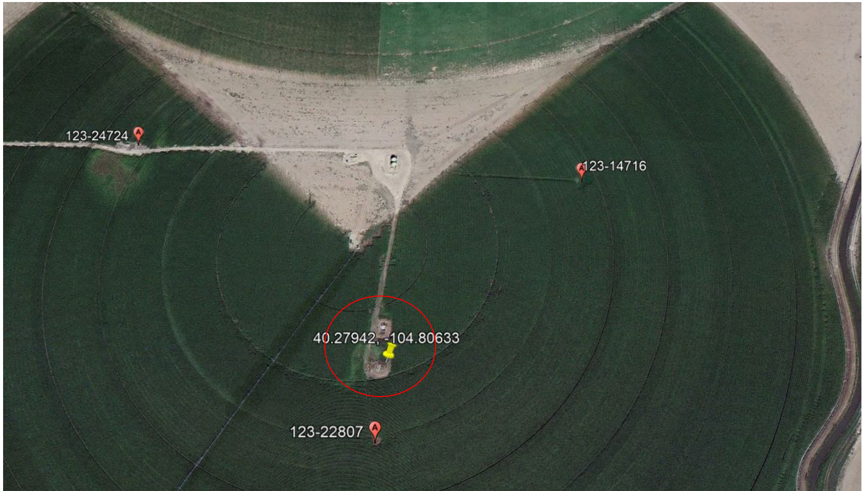
Photo 6. The photo is from Google Earth imagery from 8/18/2012. The photo illustrates the location of the original tank bather for the well location was just Southwest of the well.