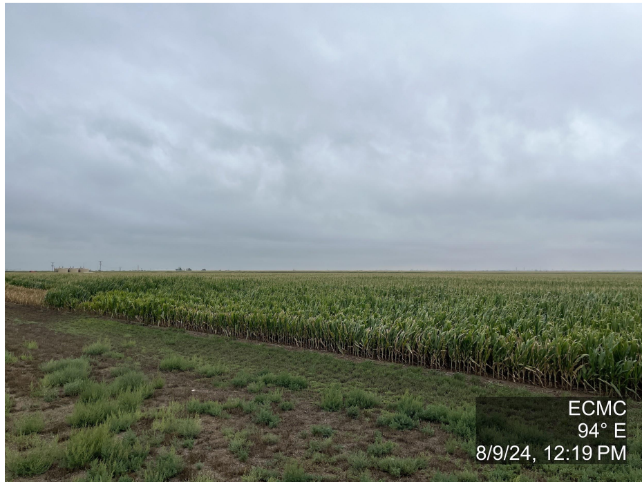
Photo 1. The photo was taken at the entrance to the well location facing East. The photo illustrates the well and tank battery location appear to be reflective of reference crop.