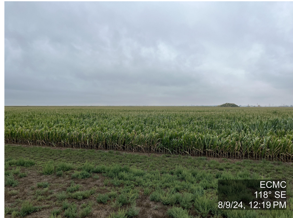
Photo 2. The photo was taken at the entrance to the well location facing Southeast. Refer to the comment for photo 1.