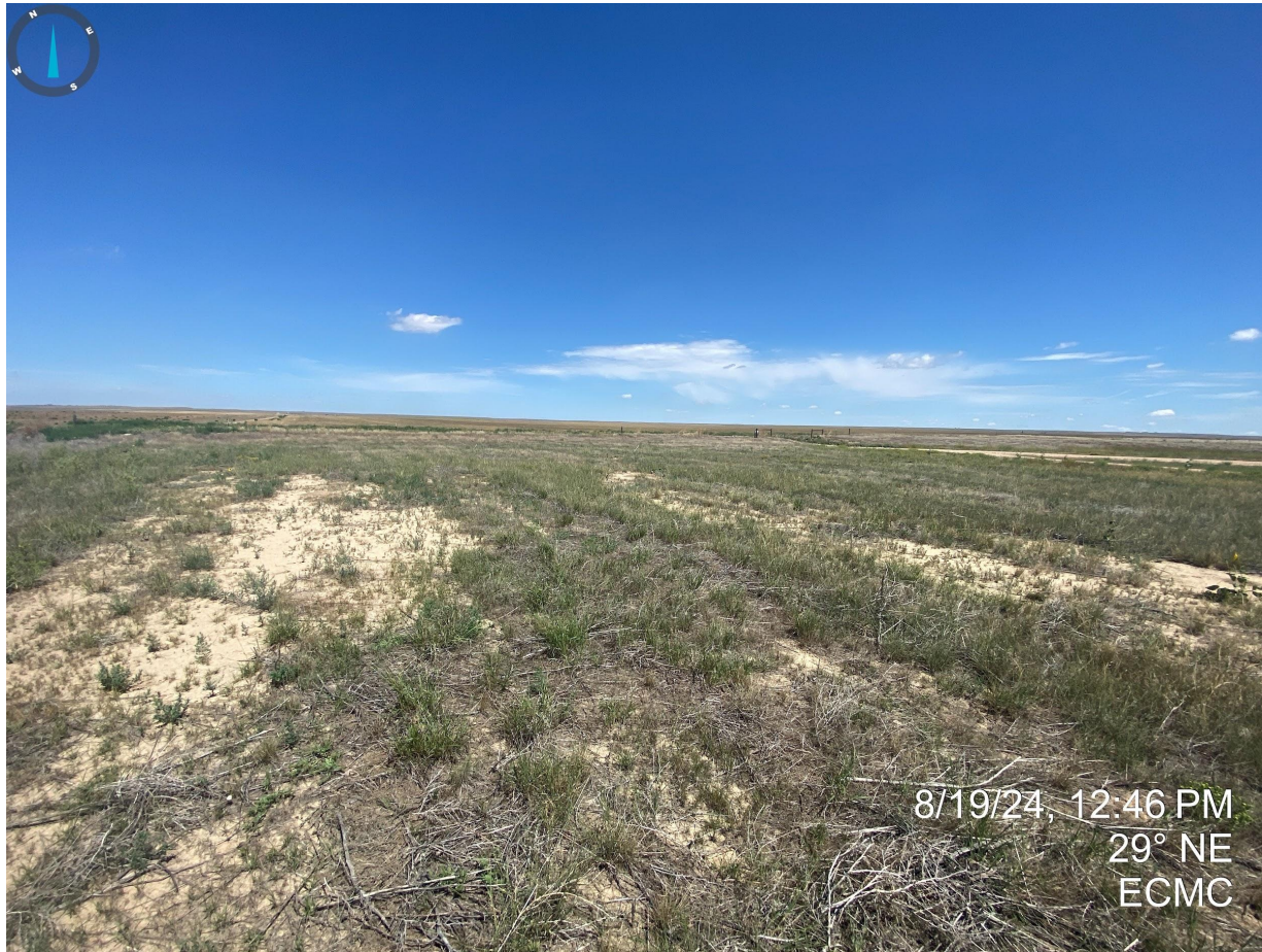
Photo 10. Western interim areas have evidence of non-uniform vegetation cover resulting in bare soil.