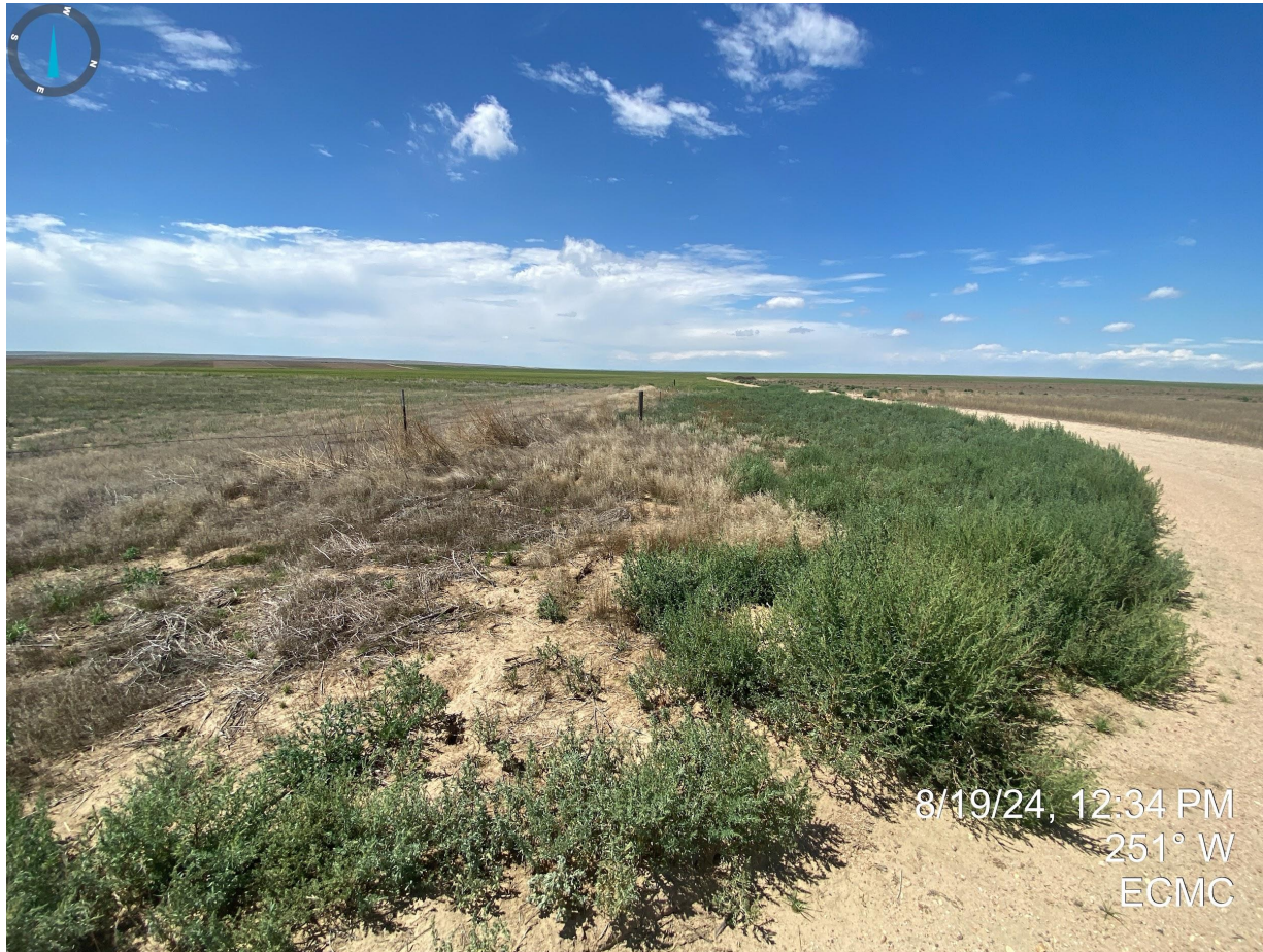
Photo 1. Facing west at the location entrance. Undesirable vegetation (kochia) growing along location and access road.