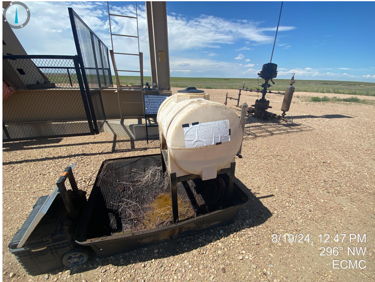
Photo 12. Wildlife BMPs (netting) inadequate, tank labels are not legible, and oily waste within secondary containment needs to be properly disposed of.