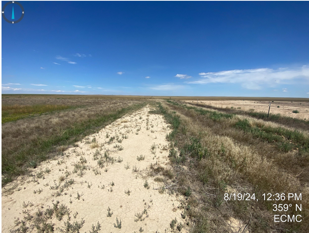
Photo 3. Eastern interim areas have evidence of non-uniform vegetation cover resulting in bare soil and CO List C Noxious Weed - cheatgrass.