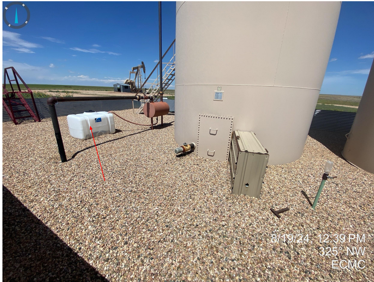
Photo 7. Tank/Container within battery does not appear to be properly labeled.