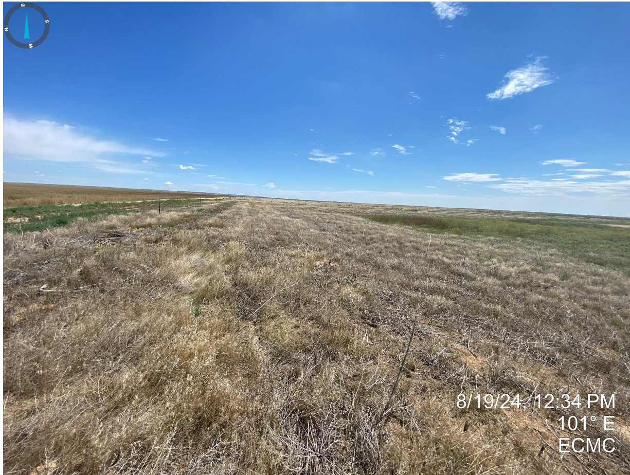
Photo 2. Northern interim areas are comprised of mainly CO List C Noxious Weed - cheatgrass; it appears that cheatgrass has already seeded out at the time of this inspection.