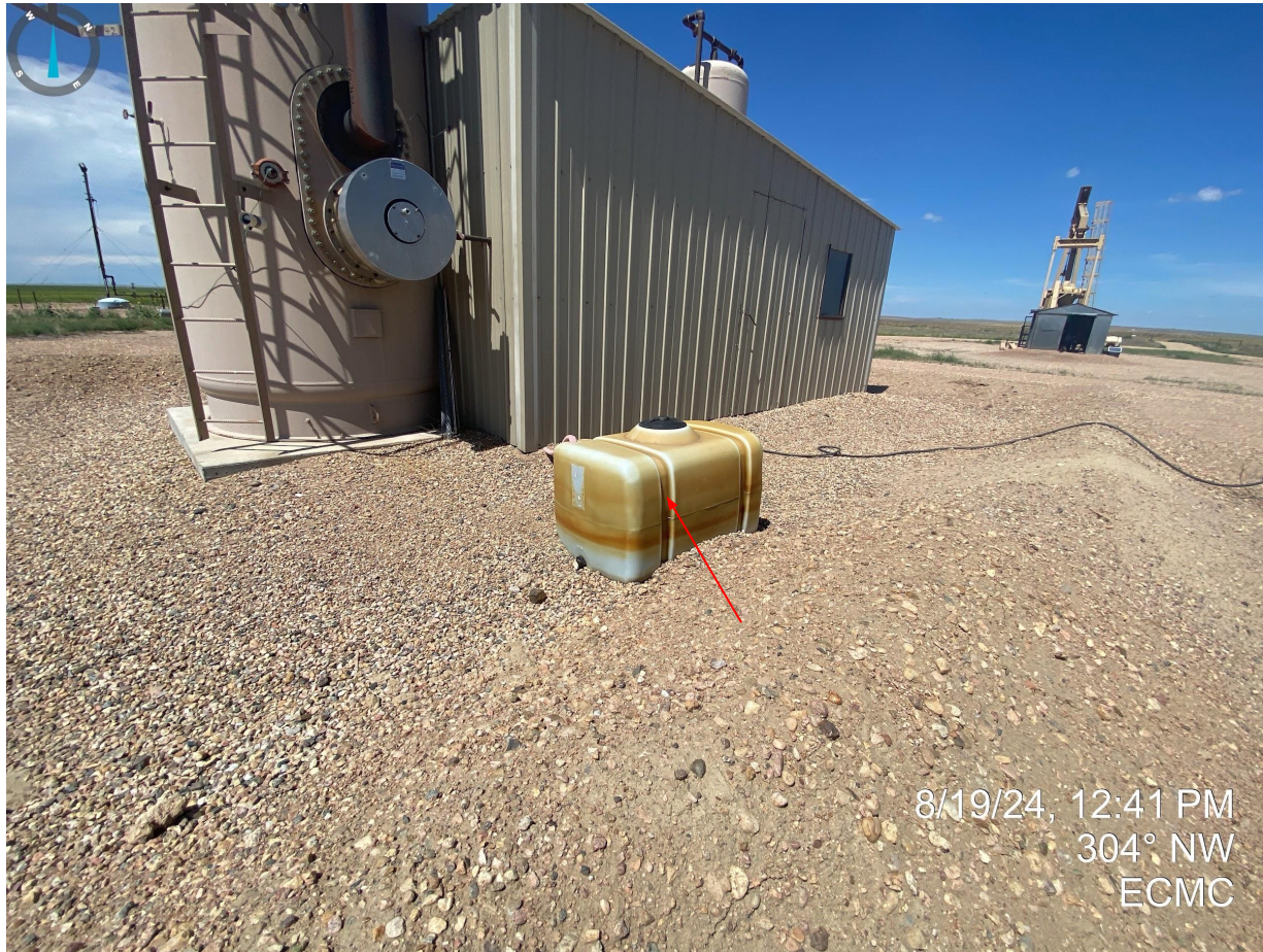
Photo 8. Tank/Container at separator does not appear to be properly labeled.