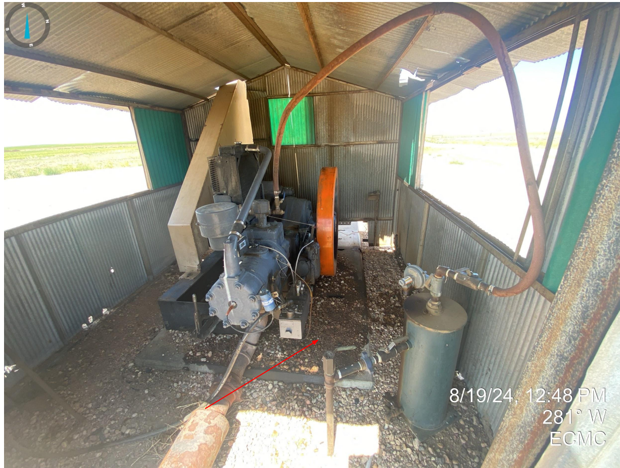
Photo 13. Hydrocarbon staining at pumpjack motor.