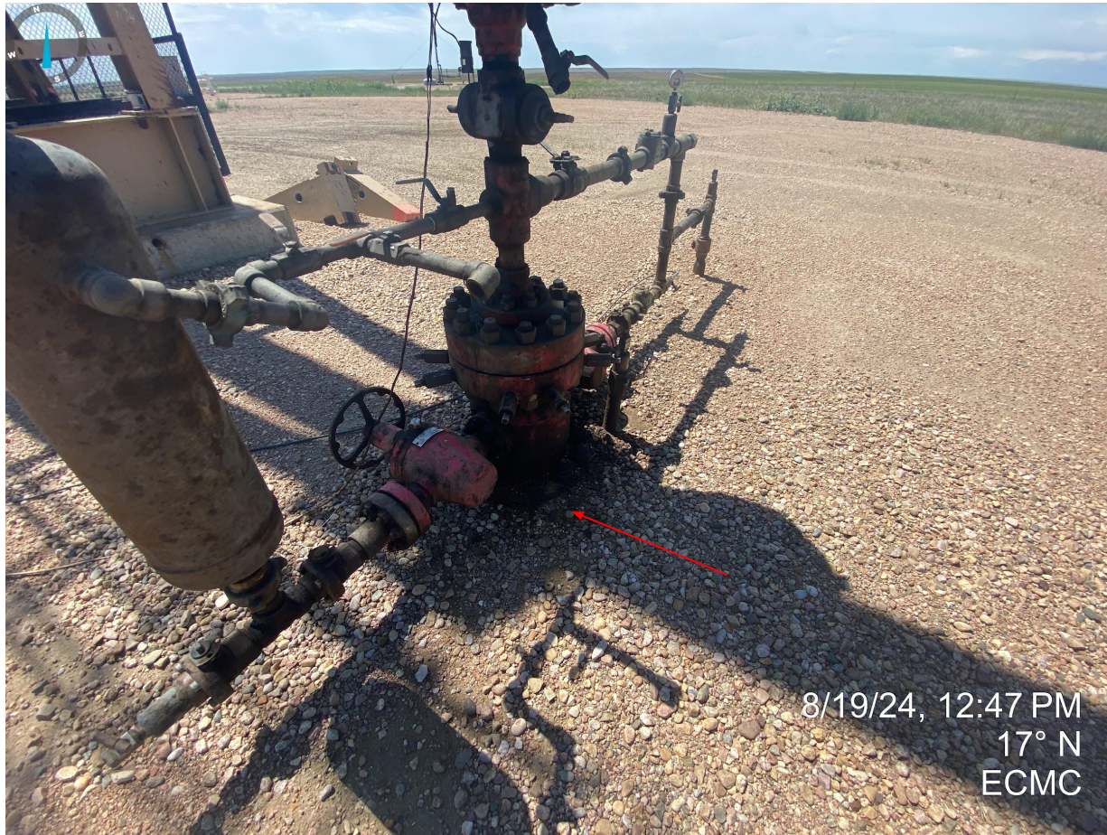
Photo 11. Stained soil around wellhead.