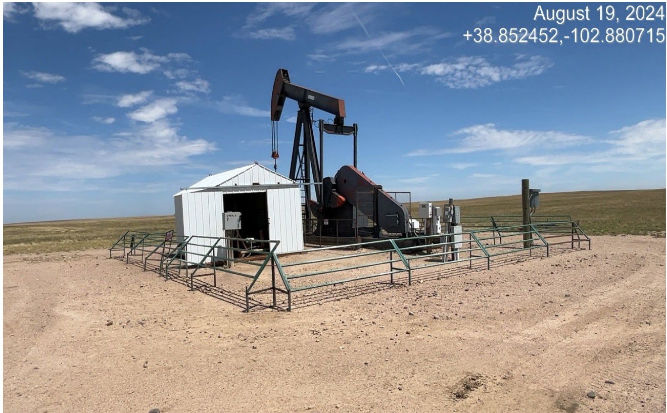
Photo 1. Facing northeast toward wellsite location.