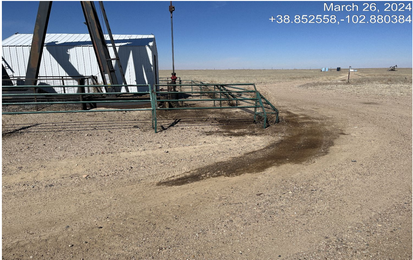
Photo 2. Photo from previous inspection. There is oil stained soils around the wellhead that must be cleaned up. Previous corrective action was not completed.