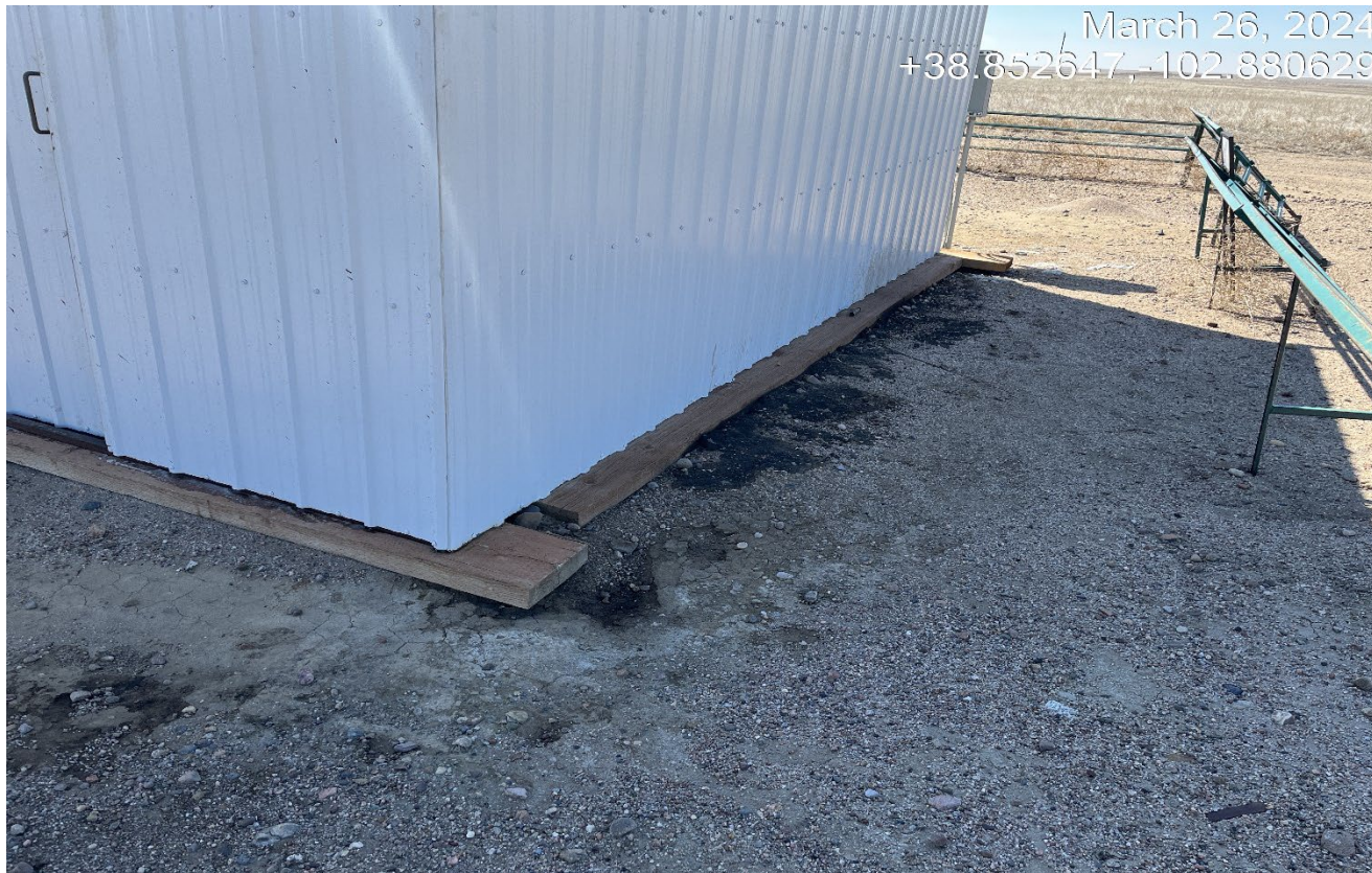
Photo 4. There is oily soils at the base of the shed.