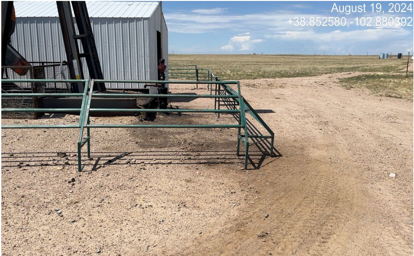
Photo 3. There is oil stained soils around the wellhead that must be cleaned up. Previous corrective action was not completed.