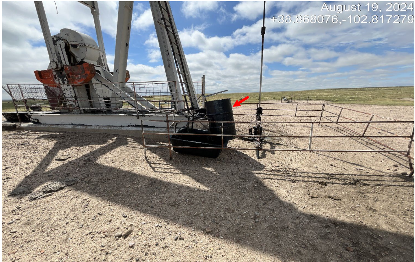
Photo 6. Facing toward the wellhead. The barrel is not properly set in the containment and there is no netting on the secondary containment..