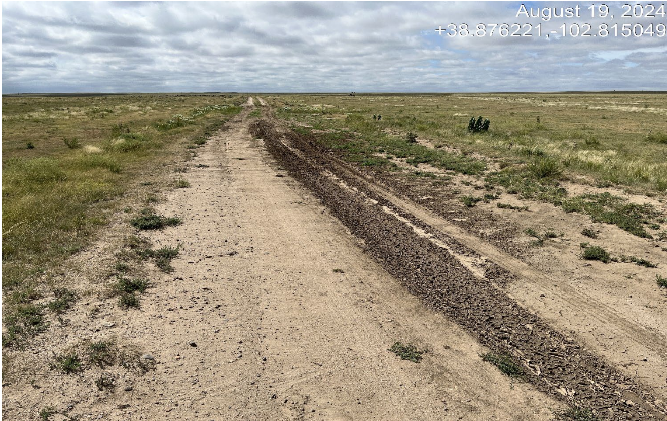
Photo 1. Facing south along the access road. Vehicles are causing unnecessary disturbance driving outside of the access road due to stormwater pooling on the road. The access road must be maintained and vehicles shall not drive outside of the access road boundary. Previous corrective action was not completed.