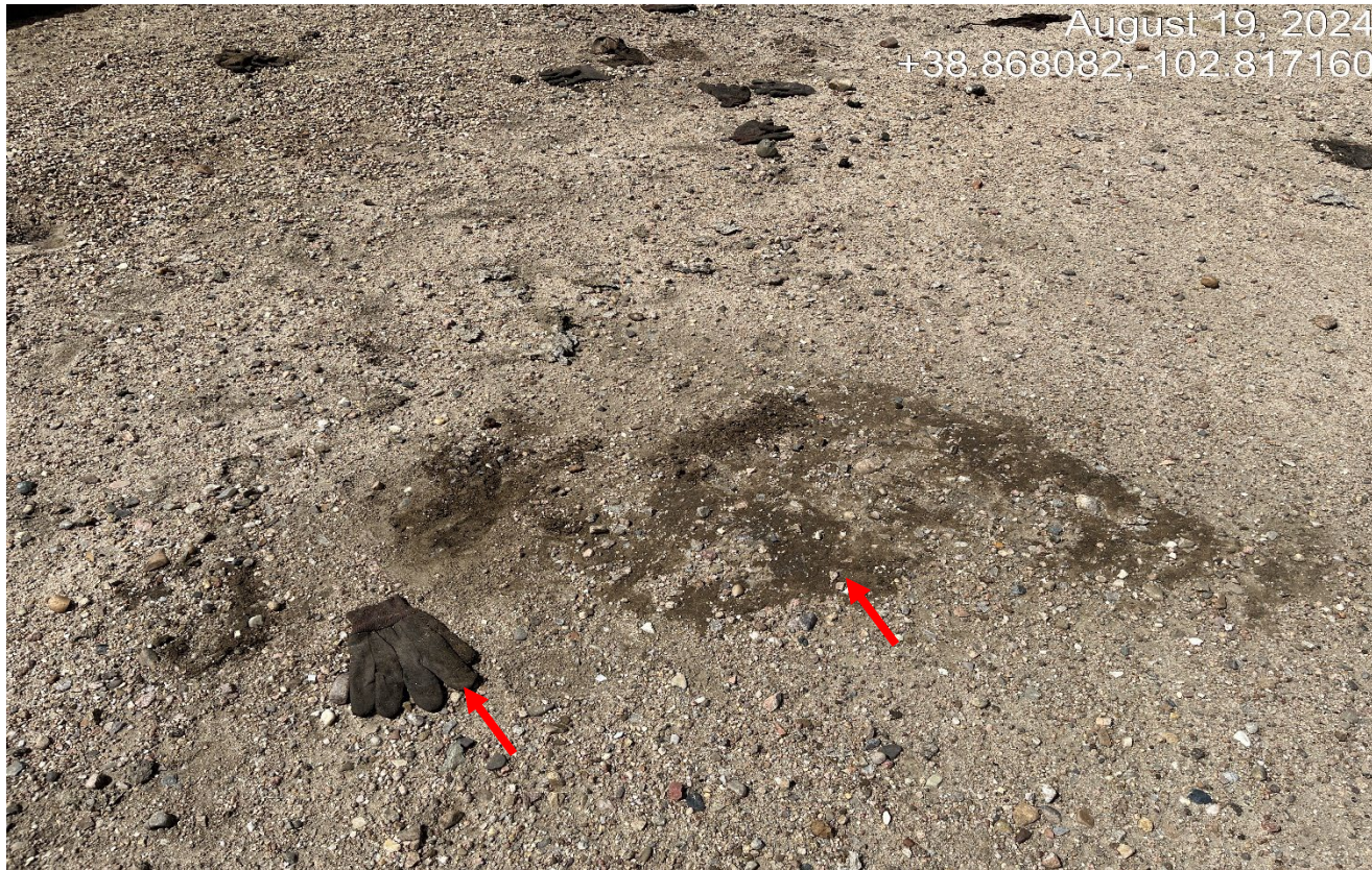
Photo 5. View of stained soils and oily gloves.