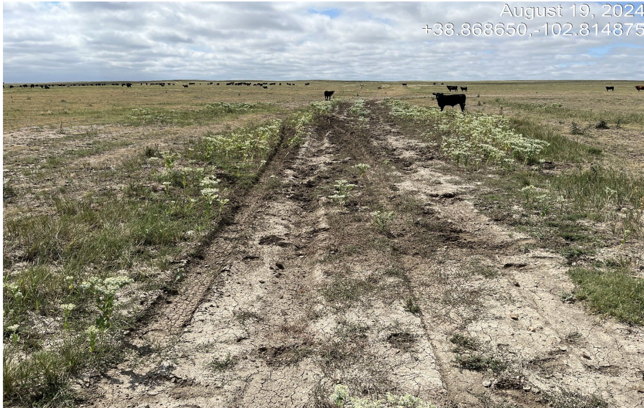
Photo 2. Facing south along the access road. Vehicles are causing unnecessary disturbance driving outside of the access road due to stormwater pooling on the road. The access road must be maintained and vehicles shall not drive outside of the access road boundary. Previous corrective action was not completed.