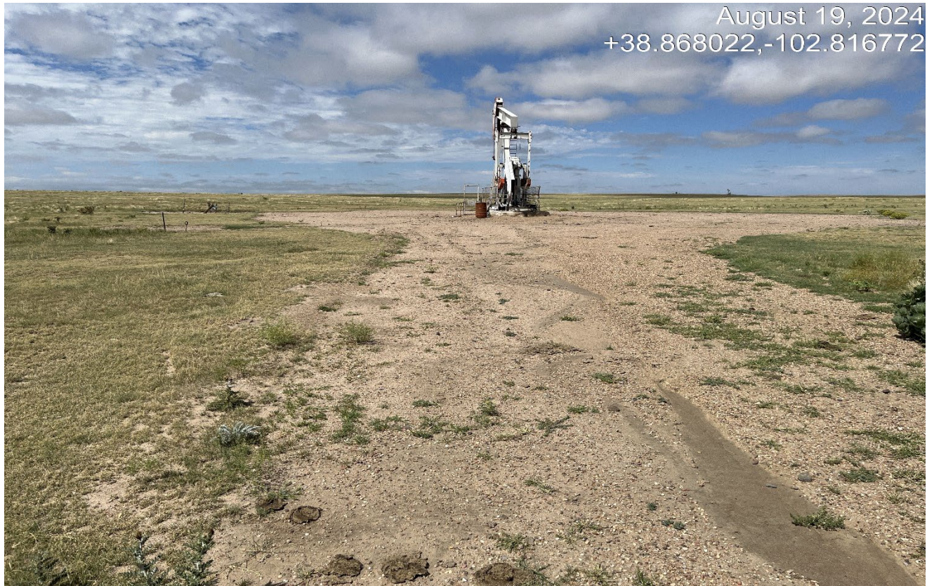
Photo 3. Facing west along the road toward the wellsite. There has been gravel spread along the area where erosion channel was previously observed.