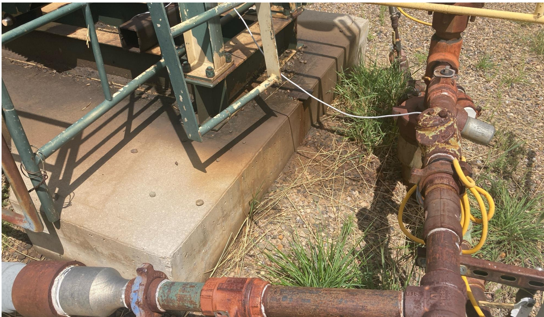
PHOTO 4: AREA OF IMPACTED SOIL NEAR WELLHEAD APPEARS TO BE FROM LEAKING GEAR BOX ON PUMPJACK. Conduct maintenance on equipment, cleanup stained material and review self inspection processes.