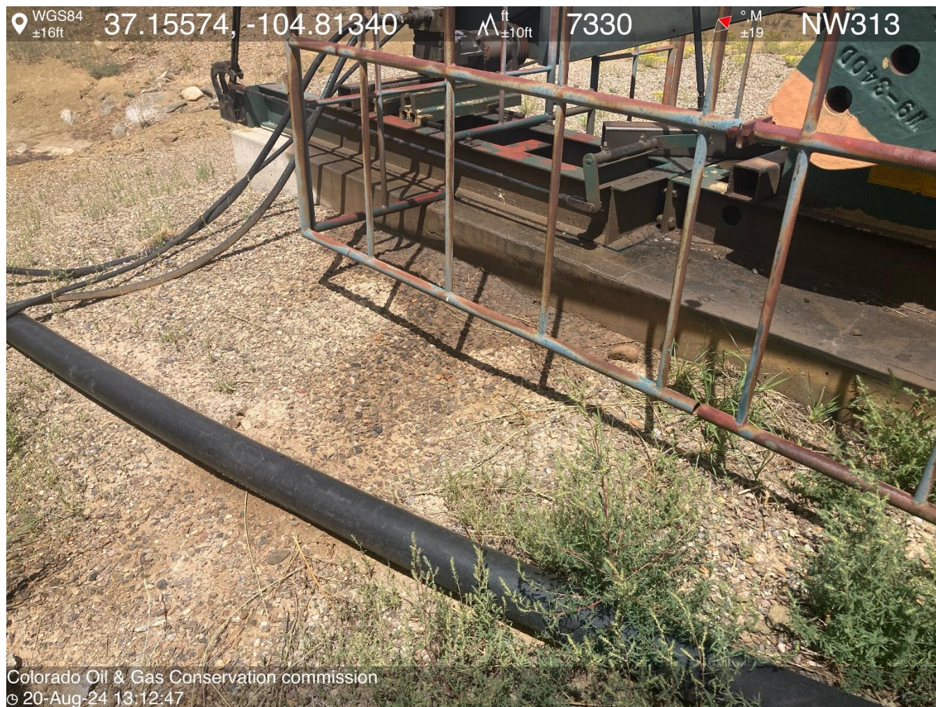
PHOTO 5: AREA OF IMPACTED SOIL NEAR WELLHEAD APPEARS TO BE FROM LEAKING GEAR BOX ON PUMPJACK. Conduct maintenance on equipment, cleanup stained material and review self inspection processes.