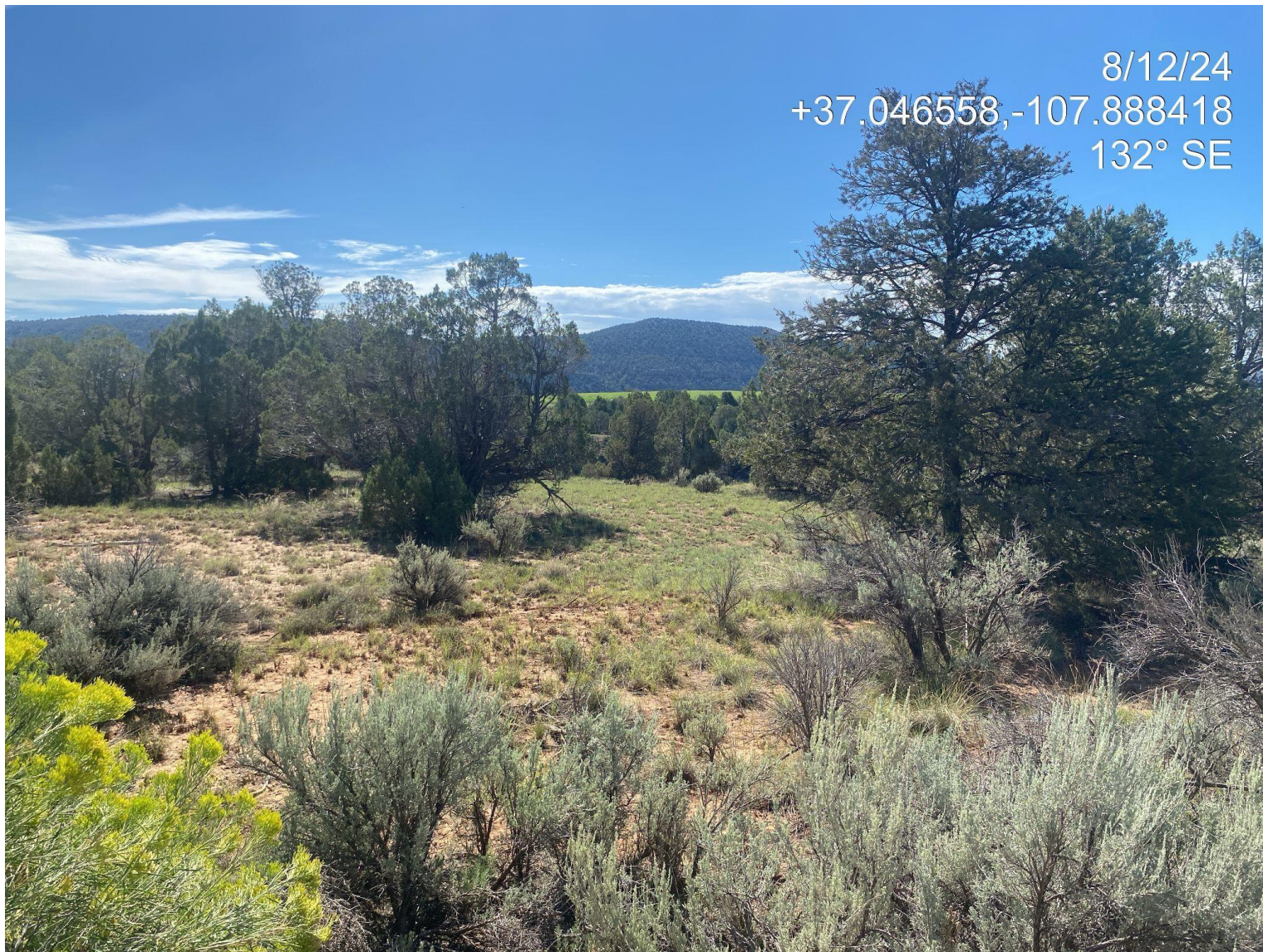
Photo 4. Reference area comprised of Juniper, Pine and Sagebrush.

Inspection Photos Location Name: Bonds 1 Location ID: 325238