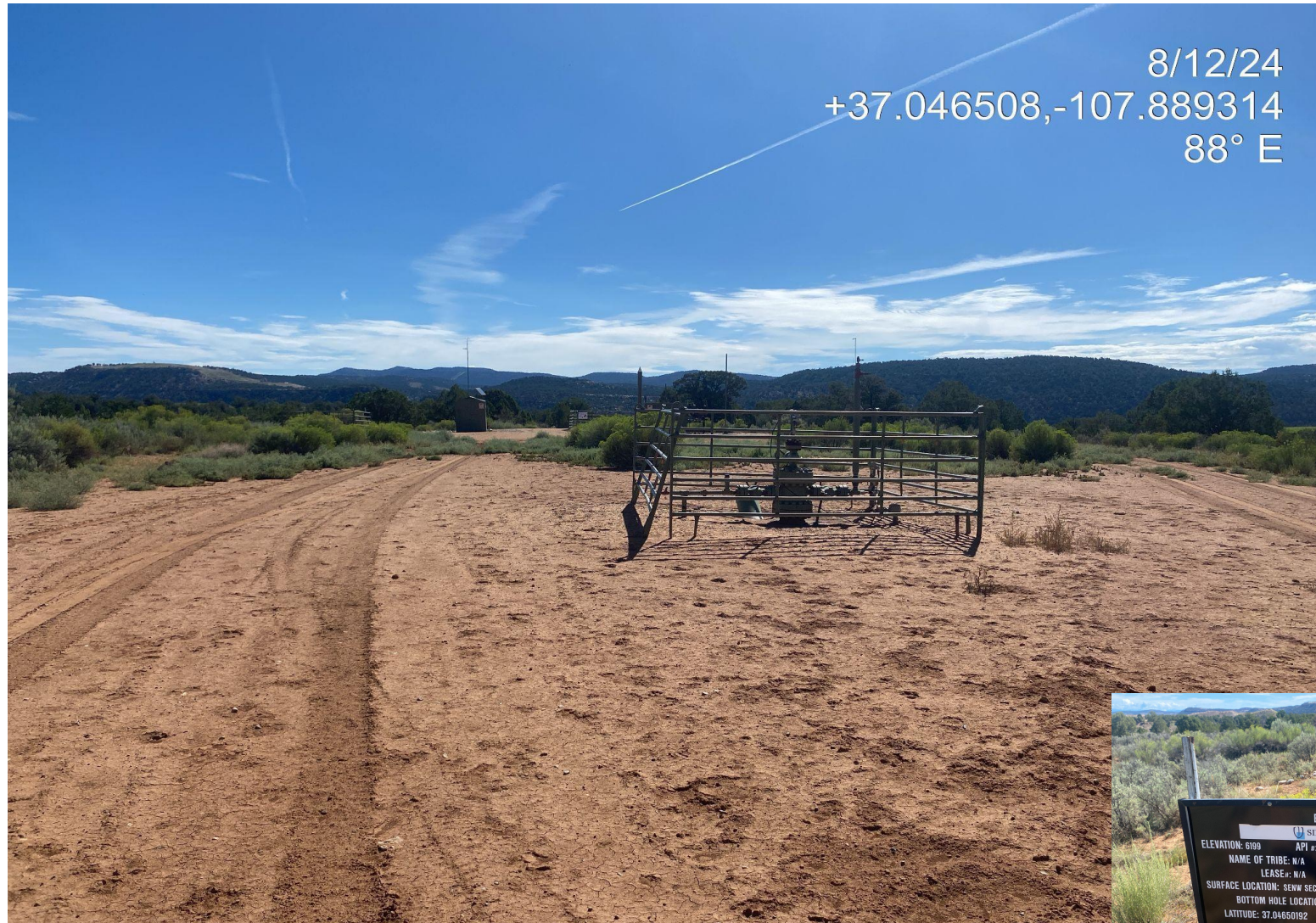
Photo 1. View of the disturbance taken from the access point facing center.