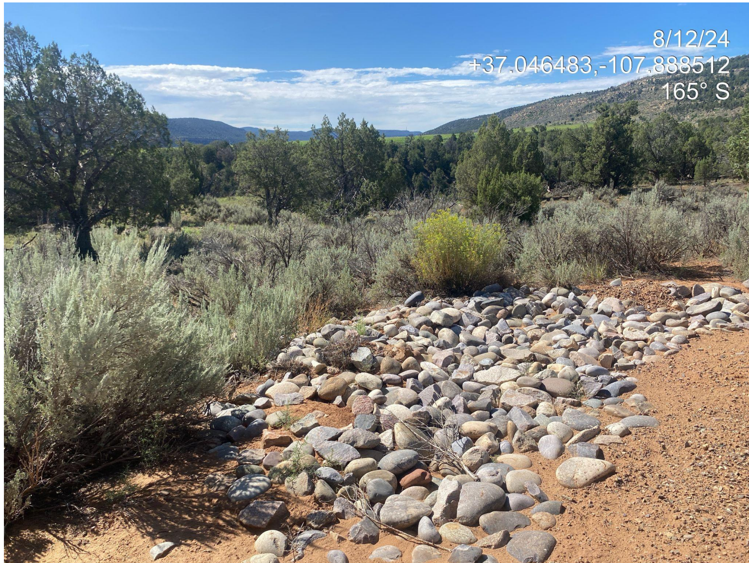
Photo 3. Stormwater appears to be controlled at this time.

Inspection Photos Location Name: Bonds 1 Location ID: 325238