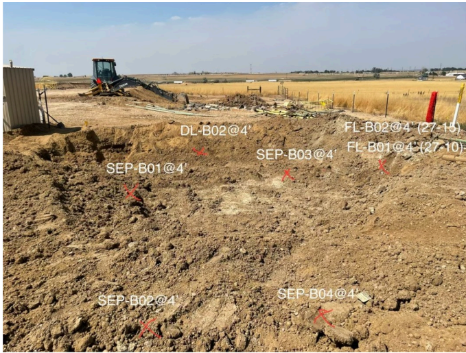
R23 - P1