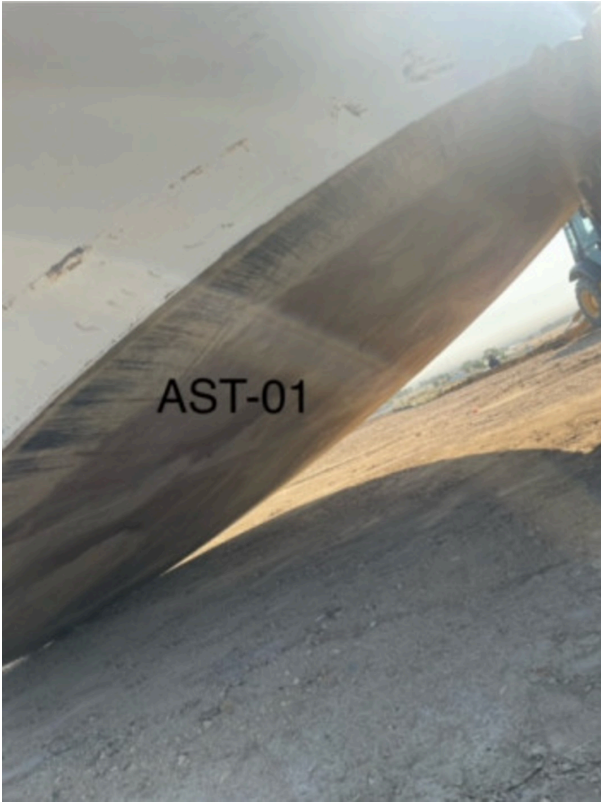
R2 - P1