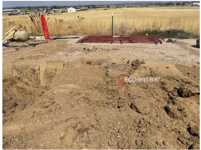
R28 - P1