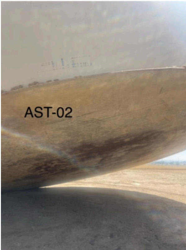
R3 - P1