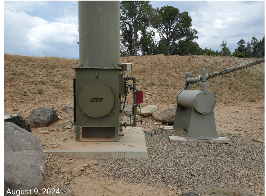
Photo 6: Photo shows Unused equipment identified in previous inspections remains stored on Location.