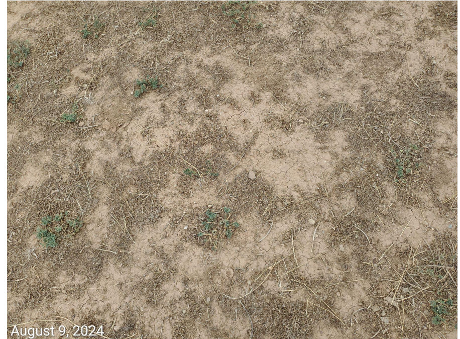
Photo 3: Photos 3-4 taken from the interim areas of the Location. Photos examples showing Location is not progressing towards 1003 reclamation standards; perennial establishment is not uniform and location is predominantly bare or vegetated by Undesirable Plant Species.