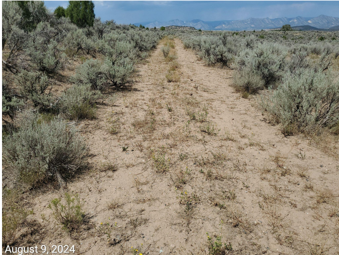
Photo 1: Photo taken from the access road facing north; O&G Access road to Location has not been reclaimed.