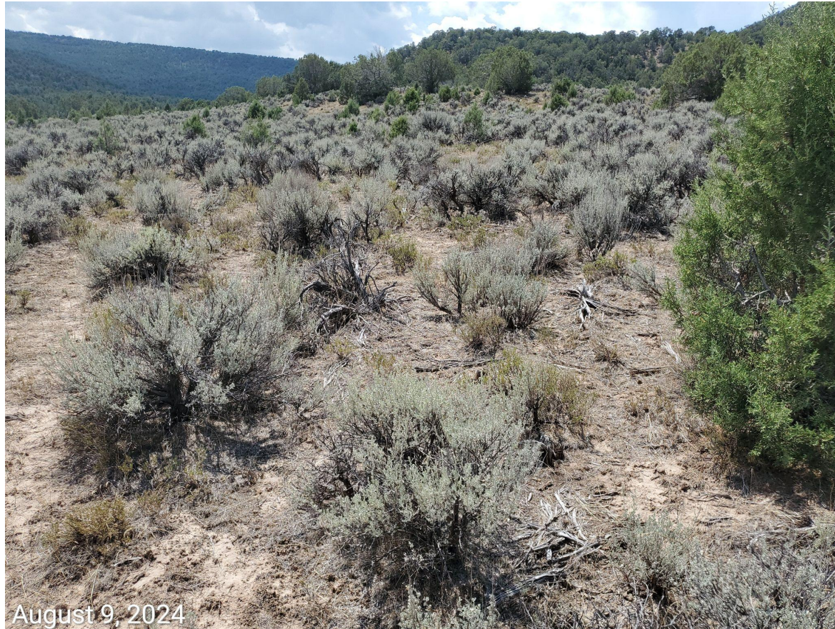
Photo 4: Photo taken from the adjacent reference area for comparison to establishment on the Location.