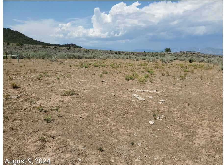
Photo 1: Photos taken from the east end of the Location. Photos provide an overview of the Location from southwest to northwest. Location is not progressing towards 1004 reclamation standards; perennial establishment is not uniform and location is predominantly bare, or vegetated by Undesirable Plant Species, including noxious weeds such as Jointed Goatgrass and Knapweed.