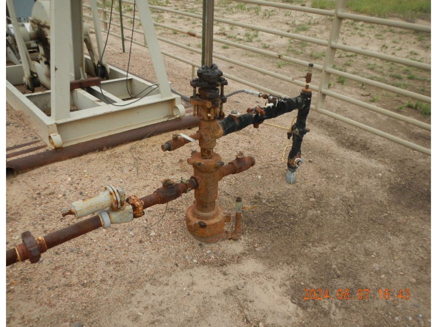
2. View of wellhead.