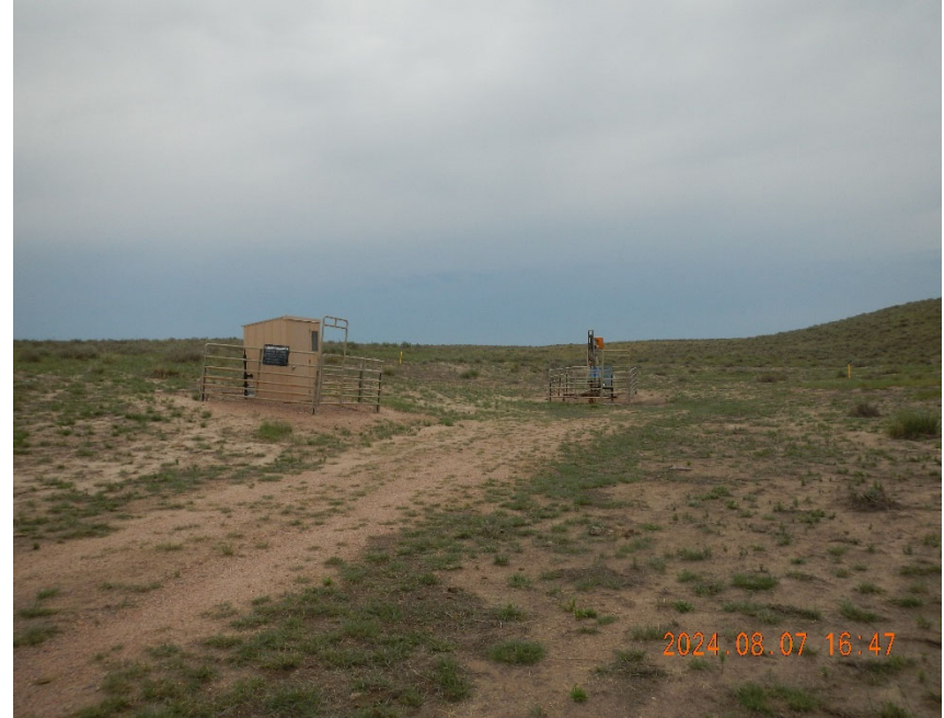
4. Location overview.