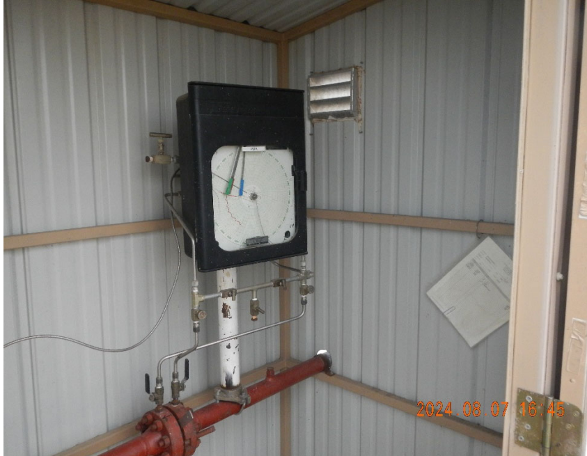
3. Gas meter inside meter shed.