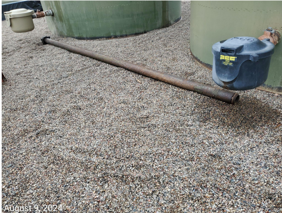
Photo 6: Photo taken from the battery facility. Photo shows unused pipe stored in containment. Photo also show stained soils due to spill.