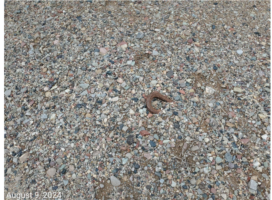
Photo 4: Photos 4-5 example showing anchors missing required marking, or marker is in disrepair.