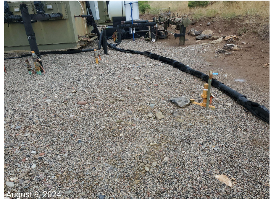
Photo 8: Photos examples showing unused risers remaining on the Location.