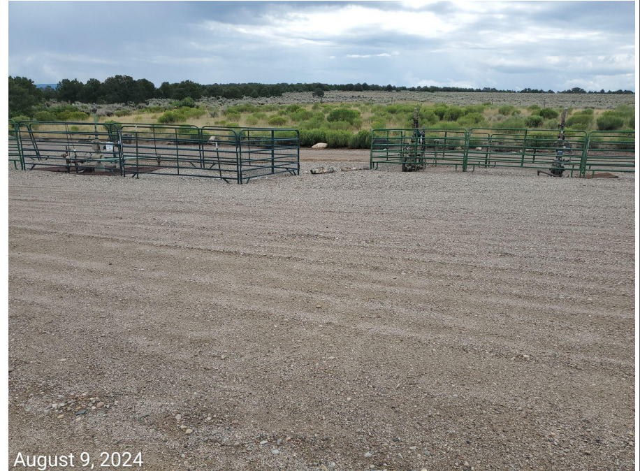
Photo 1: Photos 1-2 taken from the north end of the Location. Photos provide an overview from east, southeast, southwest to west.