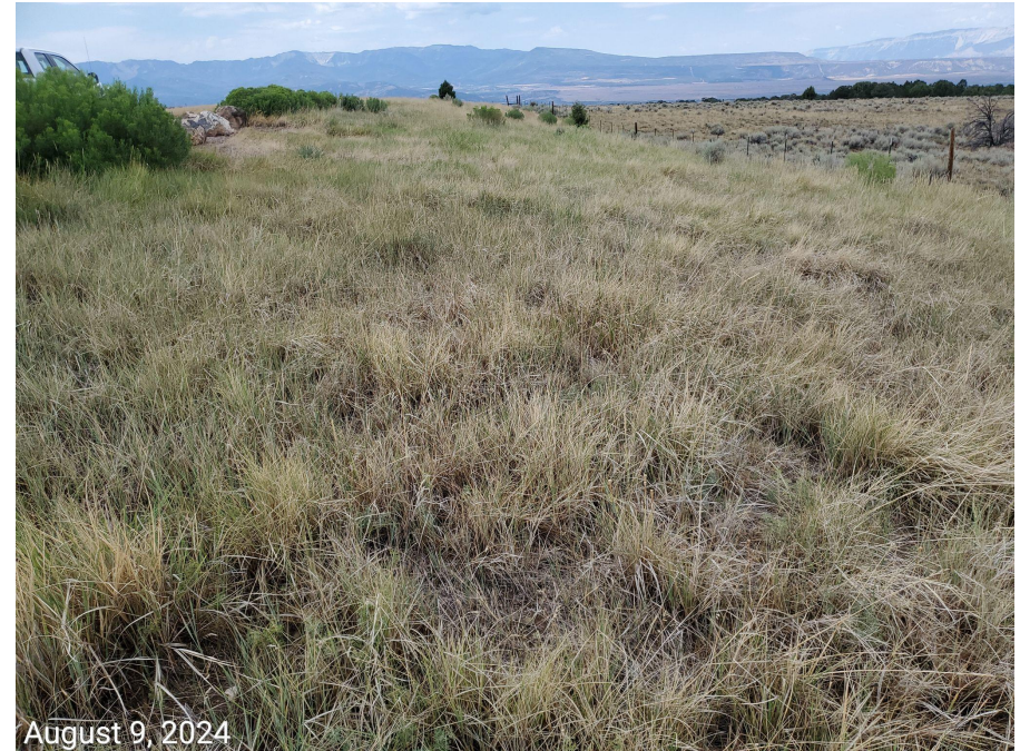
Photo 9: Photos taken from the interim areas on the south and north ends of the Location. Vegetation observed is predominantly perennial plant species; establishment is uniform. Noxious weeds not observed at time of inspection.