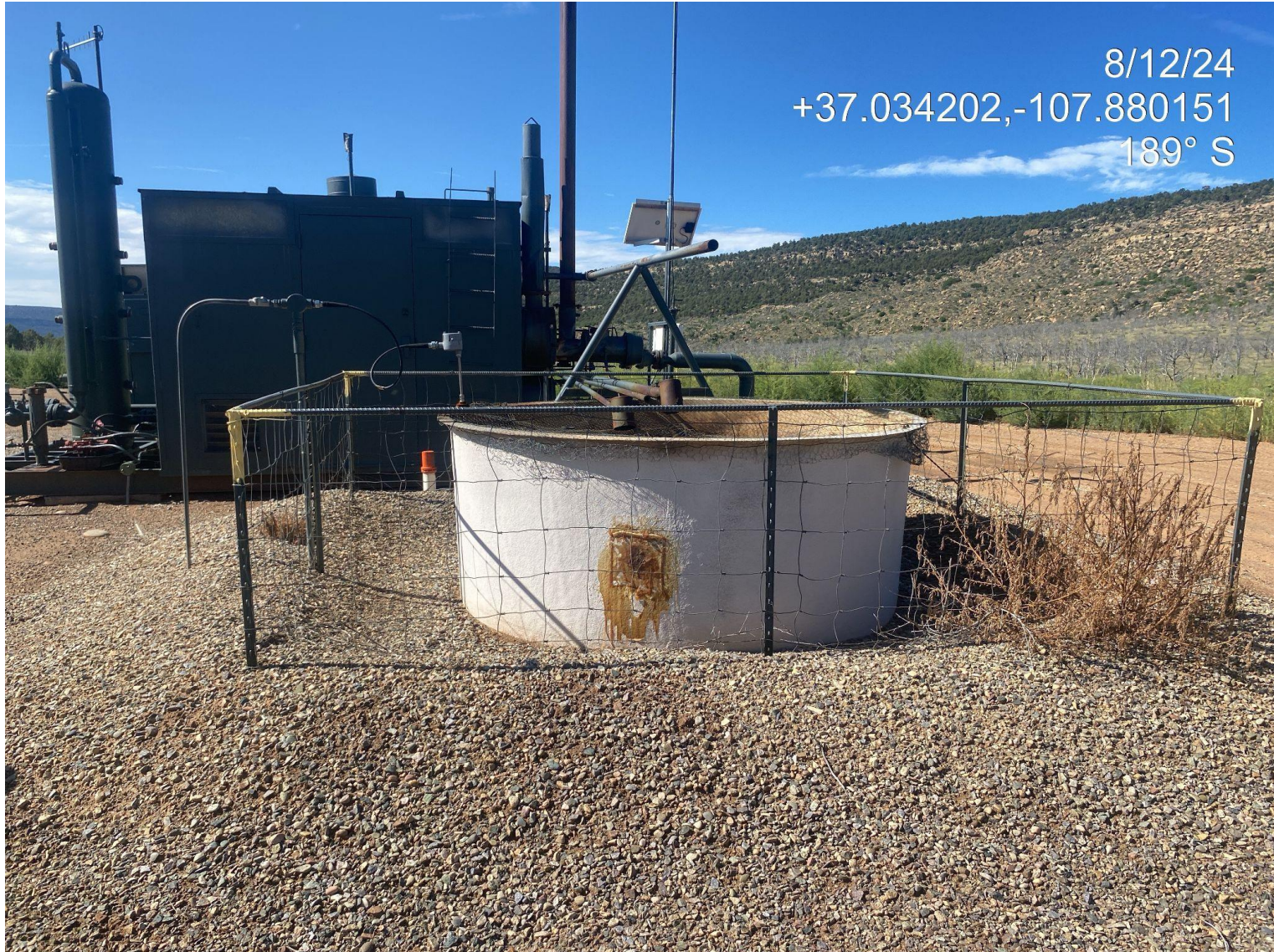
Photo 3. Unlabeled tank on location.