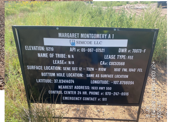
Photo 1. View of the location taken from the access point facing center.