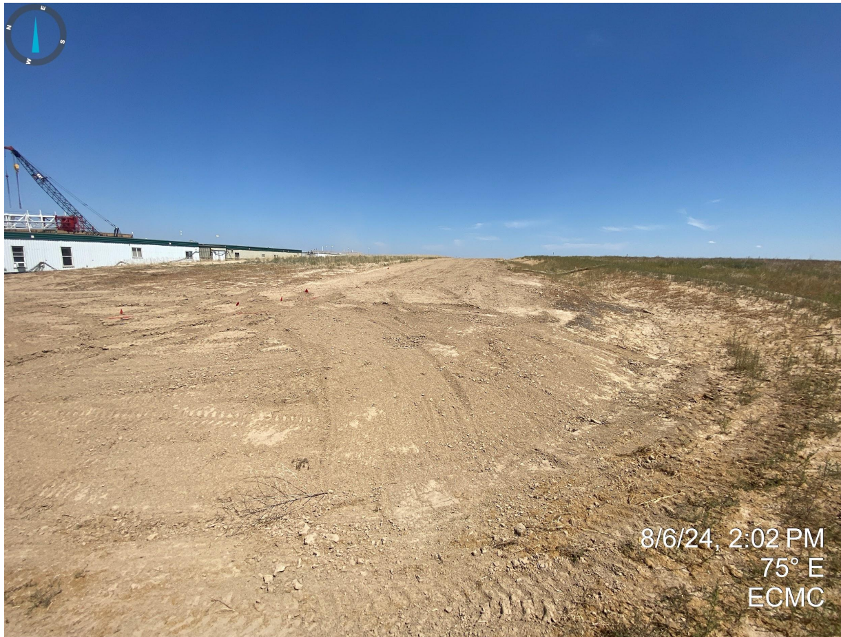
Photo 3. Southwestern portion of the location. It appears that recent dirt work is associated with pipeline/flowline installation. All soils shall be stabilized in order to comply with Rule 1002.c.