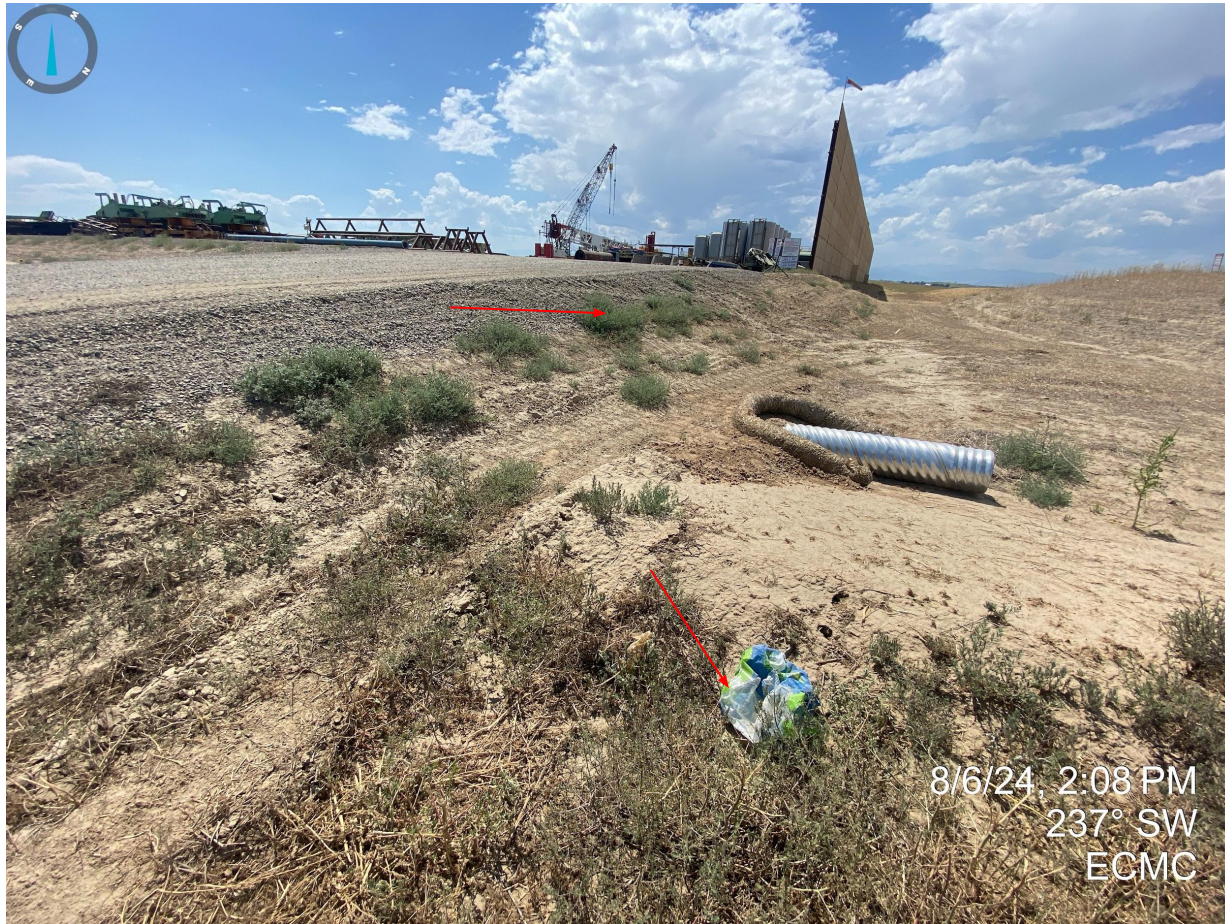
Photo 9. Example of trash and undesirable vegetation observed near the location entrance.