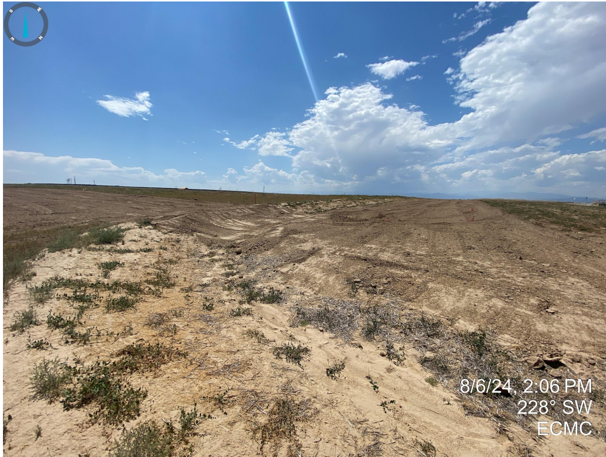
Photo 5. Continued from Photo 3; facing southwest from the southeast end of the location.