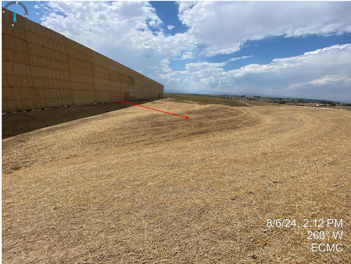
Photo 13. Imported topsoil stockpile appears to have been seeded with straw crimped mulch for stabilization.