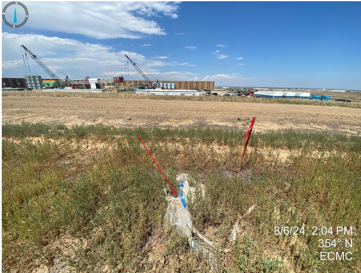
Photo 6. Examples of trash observed on the south side of the location.