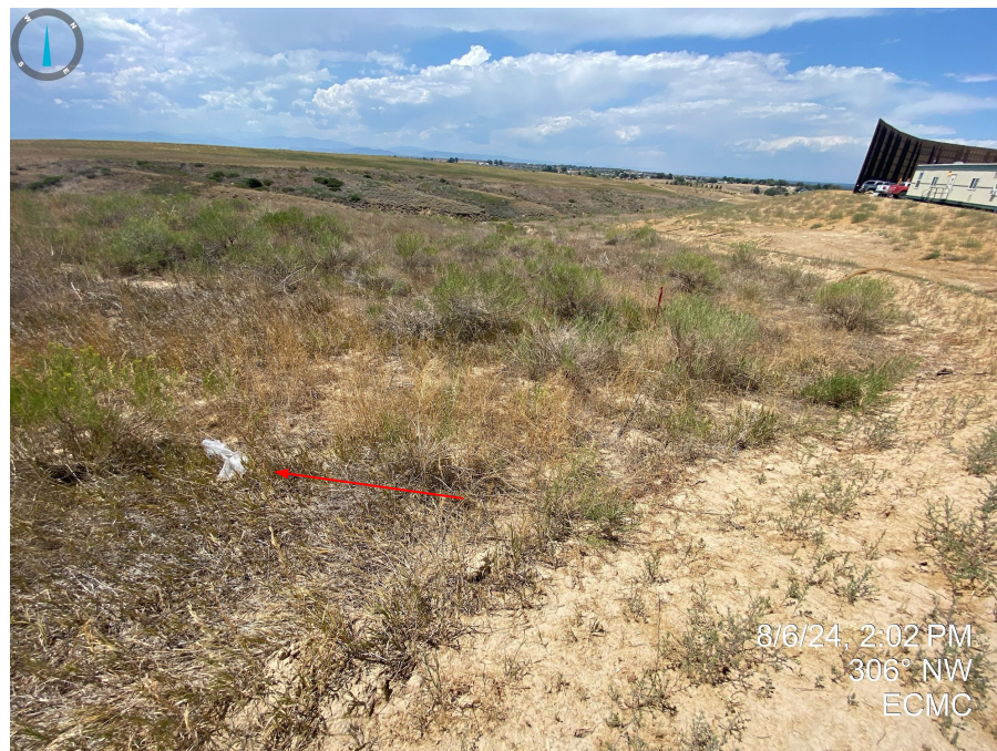
Photo 2. Examples of trash observed on the west side of the location.