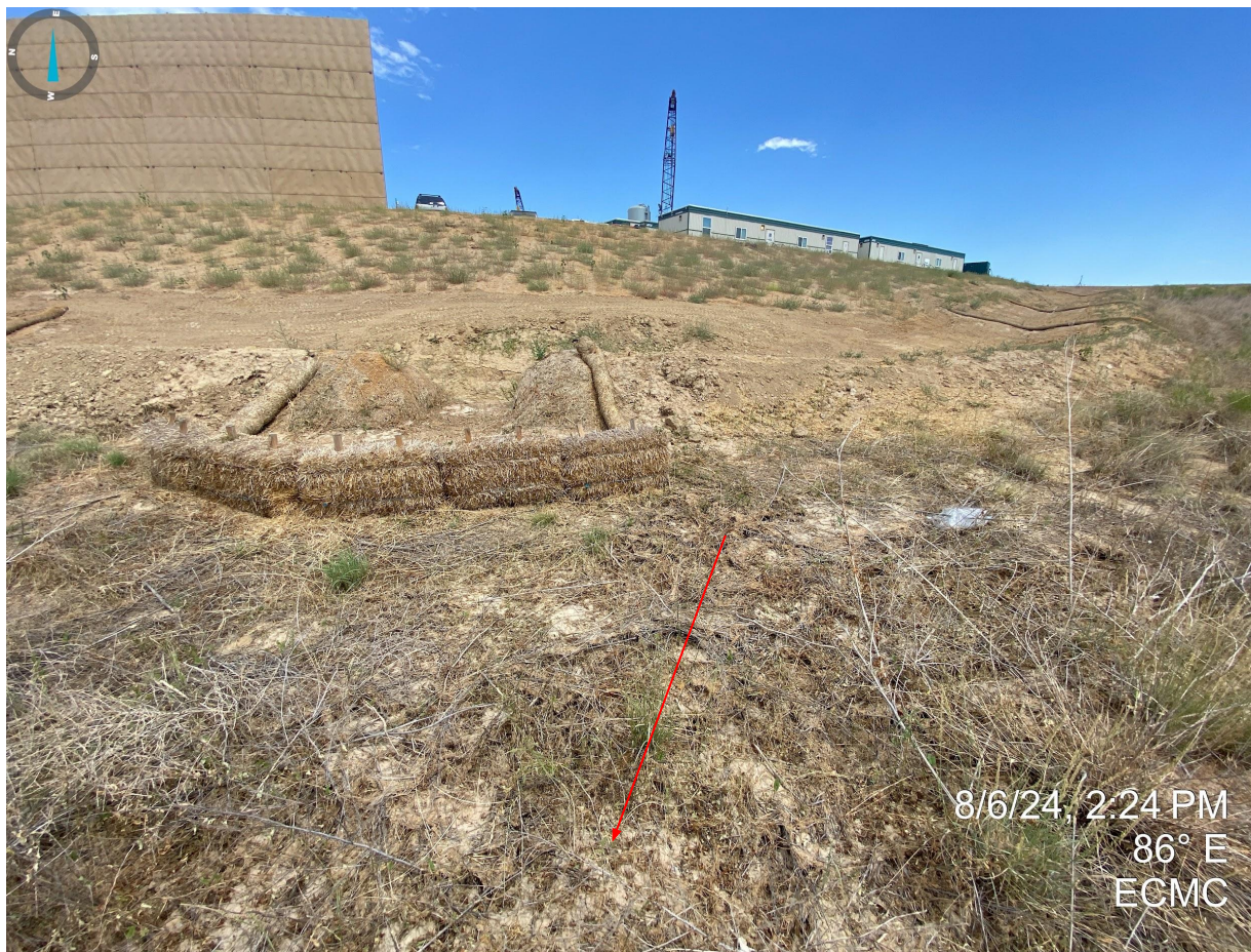
Photo 21. Taken near the northwestern portion of the construction area. Evidence of off location sediment transport observed near one of the sediment traps.