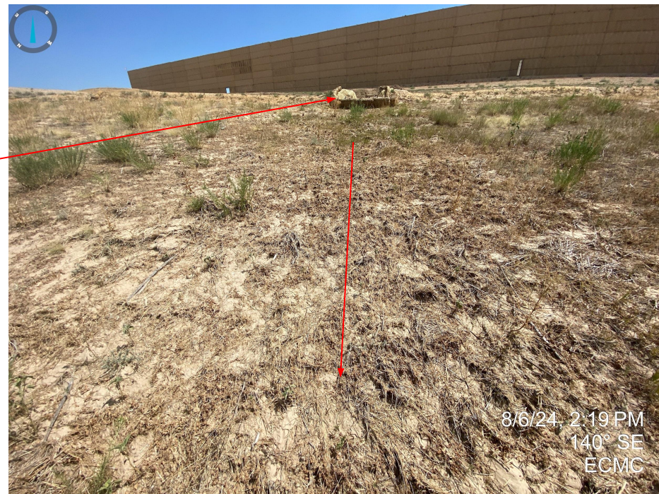
Photo 15 & 16. Taken near the northern portion of the construction area. Evidence of off location sediment transport observed near one of the sediment traps.