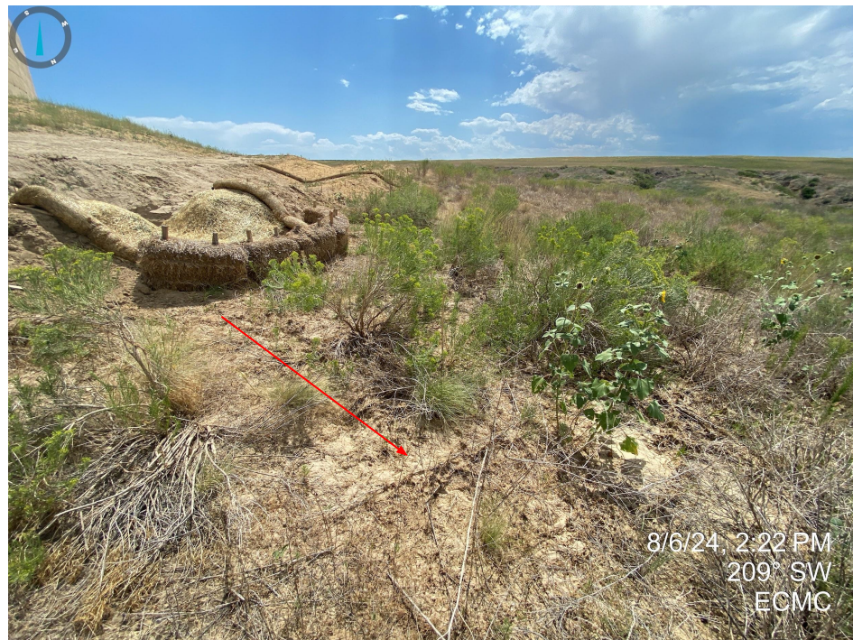
Photos 17 & 18. Taken near the northern portion of the construction area. Evidence of off location sediment transport observed near one of the sediment traps.