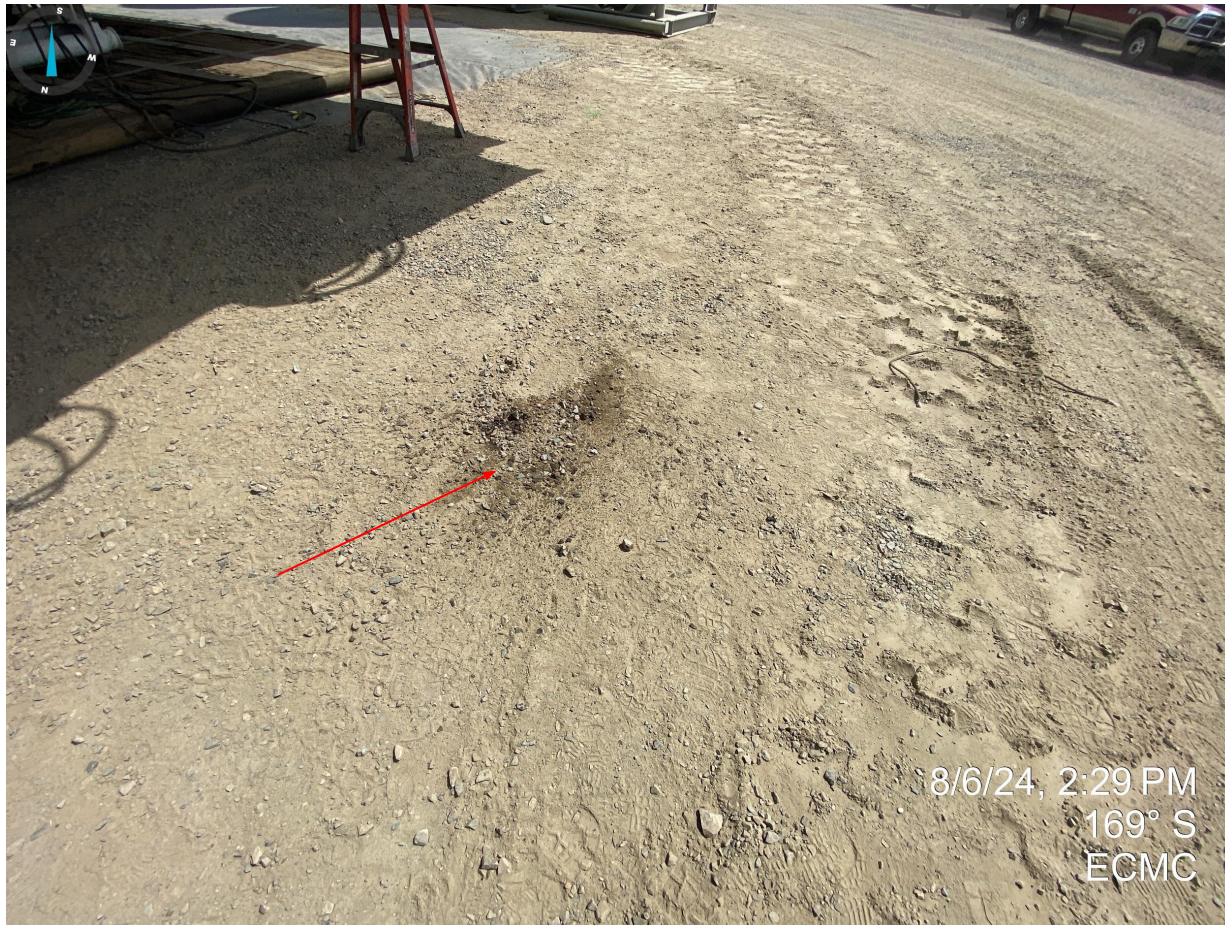
Photo 22. Stained soil observed near drilling rig.