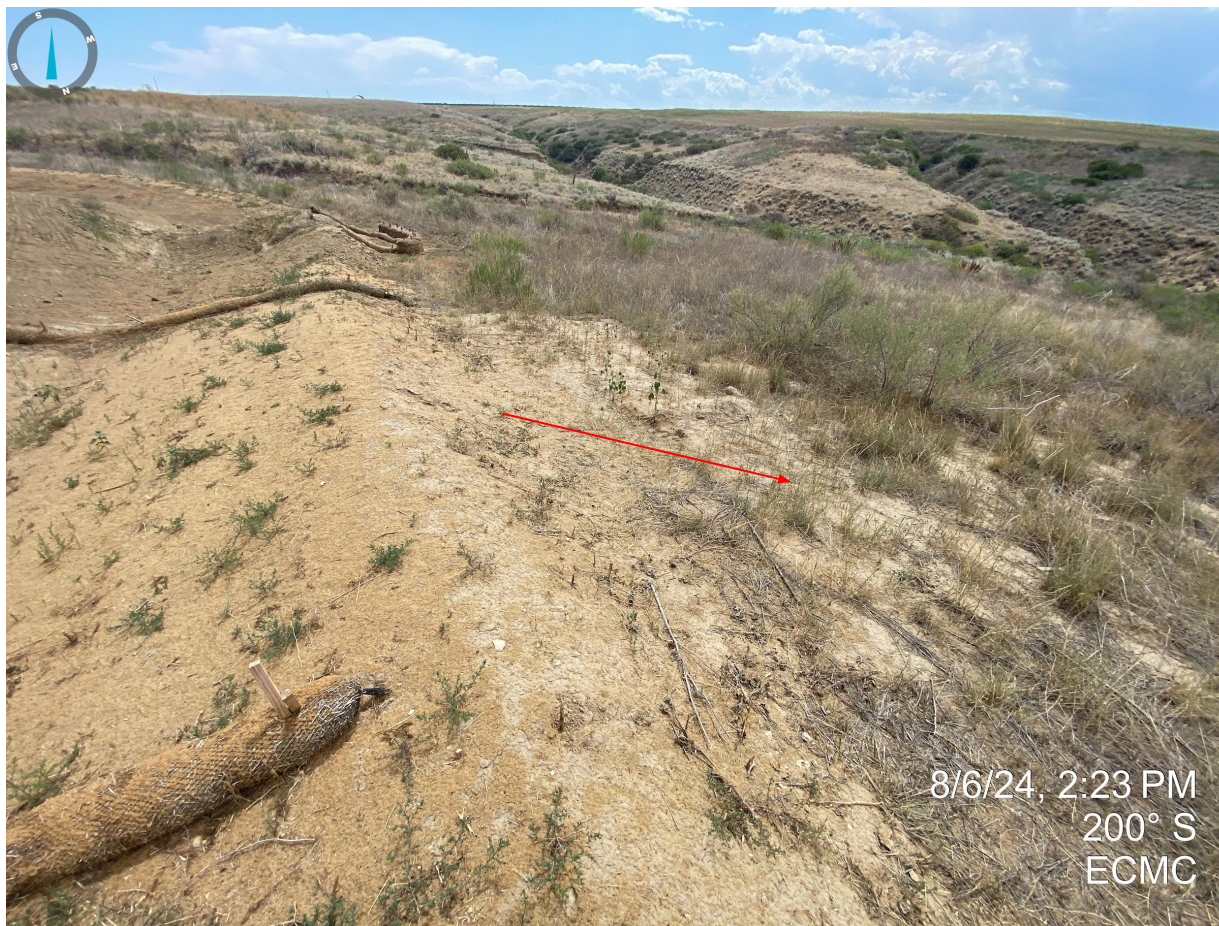
Photo 20. Taken near the northwestern portion of the construction area. Evidence of off location sediment transport observed along the exterior of the perimeter ditch and berm.