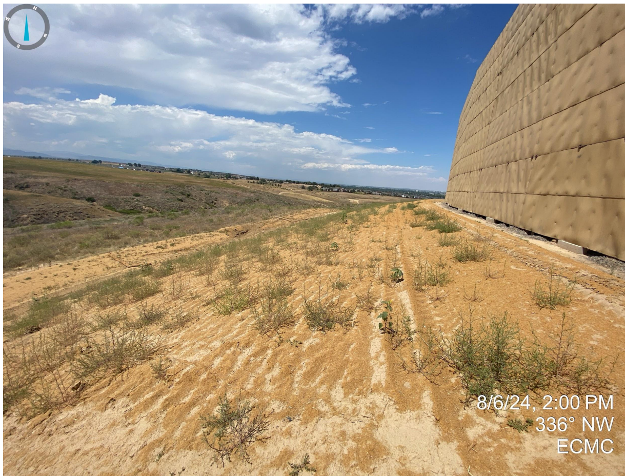
Photo 1. Western portion of the location. Undesirable vegetation (russian thistle and kochia) was observed to be growing throughout. No germination observed throughout the hydroseeded portions.