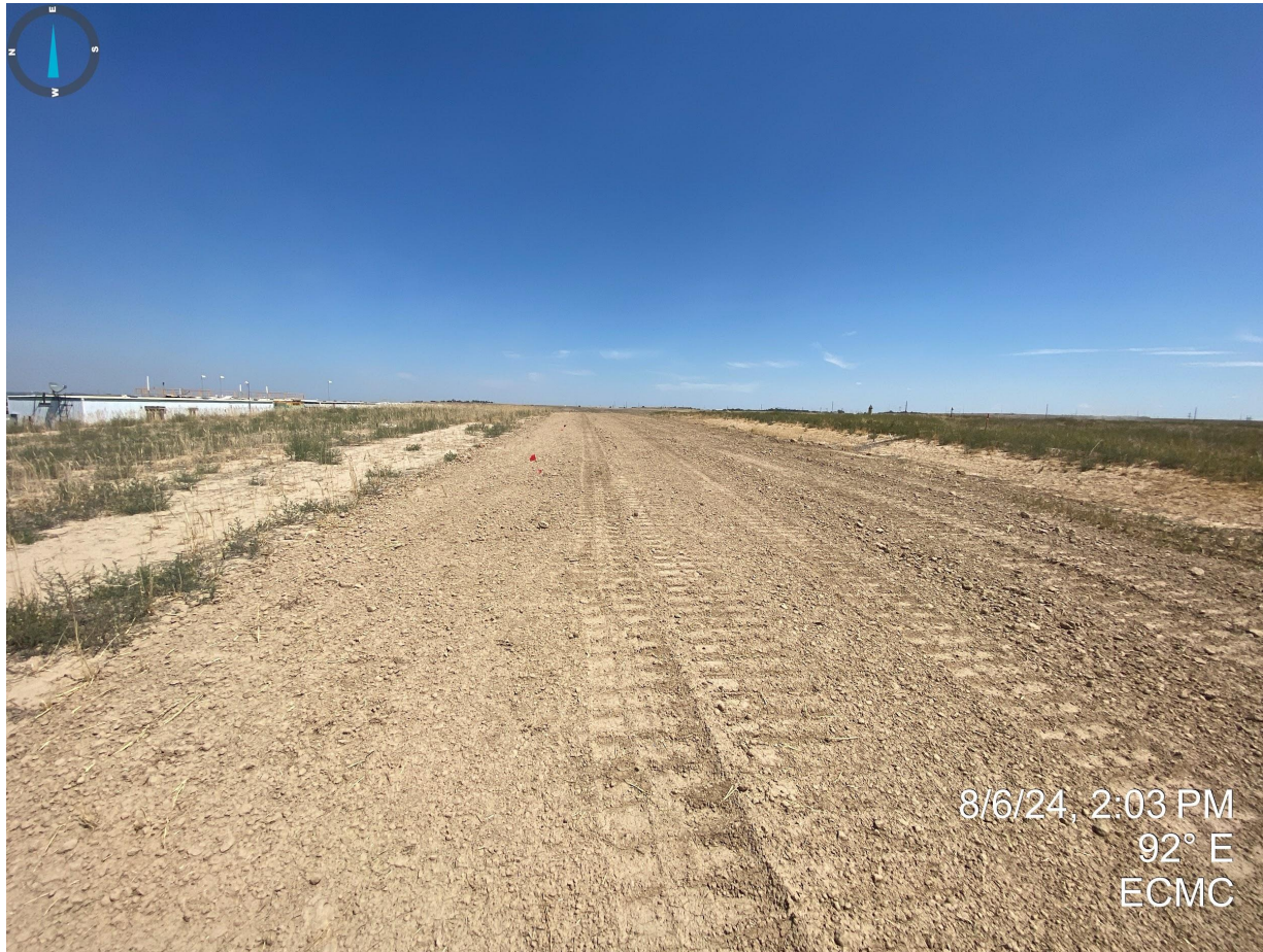
Photo 4. Continued from Photo 3; facing east from the center/southern portion of the location.