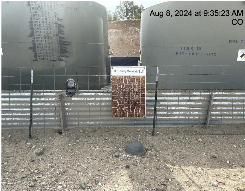
Photo # 5341 Battery sign weathered & cracking/starting to become illegible