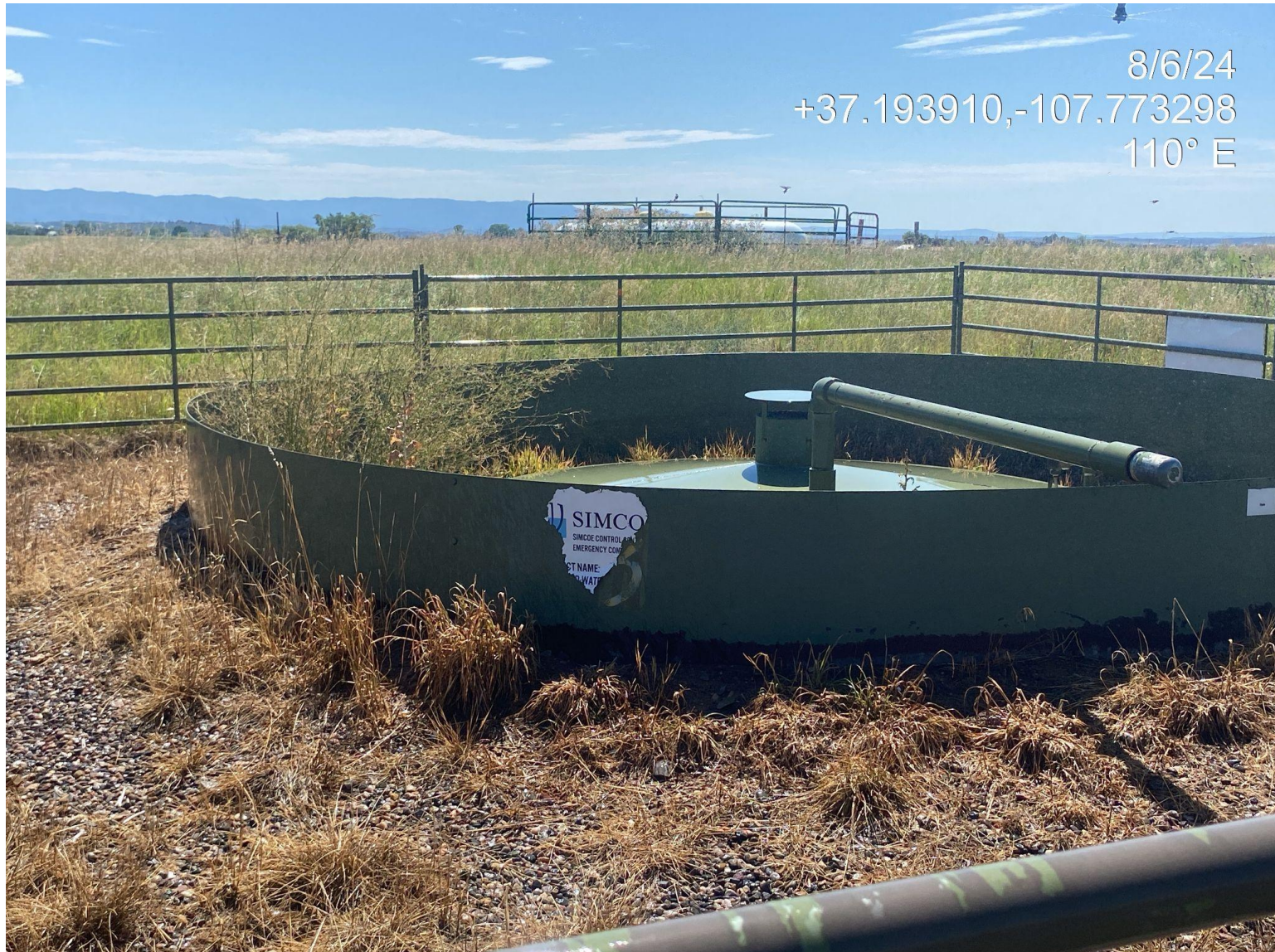
Photo 3. Produced water tank placard/label is damaged and illegible.