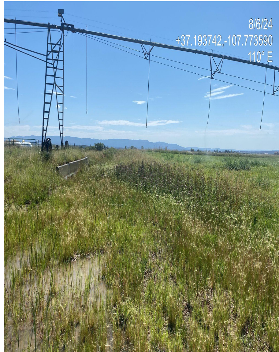
Photo 2. Patches of flowering Musk and Canada thistle observed throughout the active disturbance.