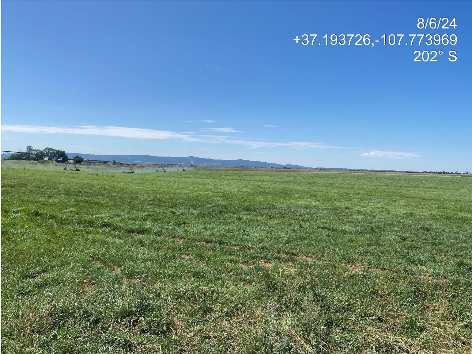
Photo 5. Grass agriculture field reference area.