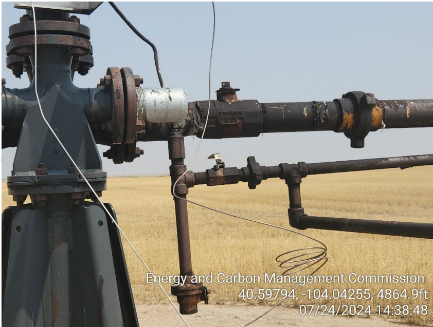
Photo 5 – Pilot Supply Valve appears to be in closed position. Inlet Valve appears to be in the open position