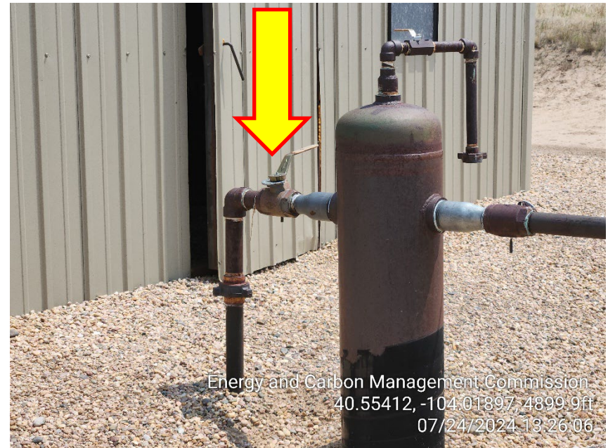
Photo 4 – Sales Line appears to be in the closed position Upstream of the Sales Meter