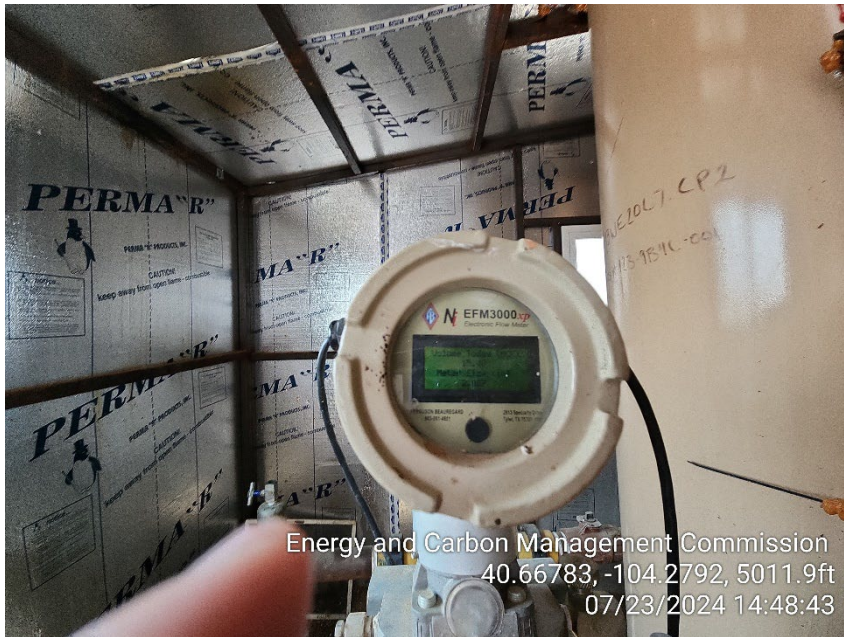
Energy and Carbon Management Commission 40.66783, -104.2792, 5011.9ft 07/23/2024 14:48:43