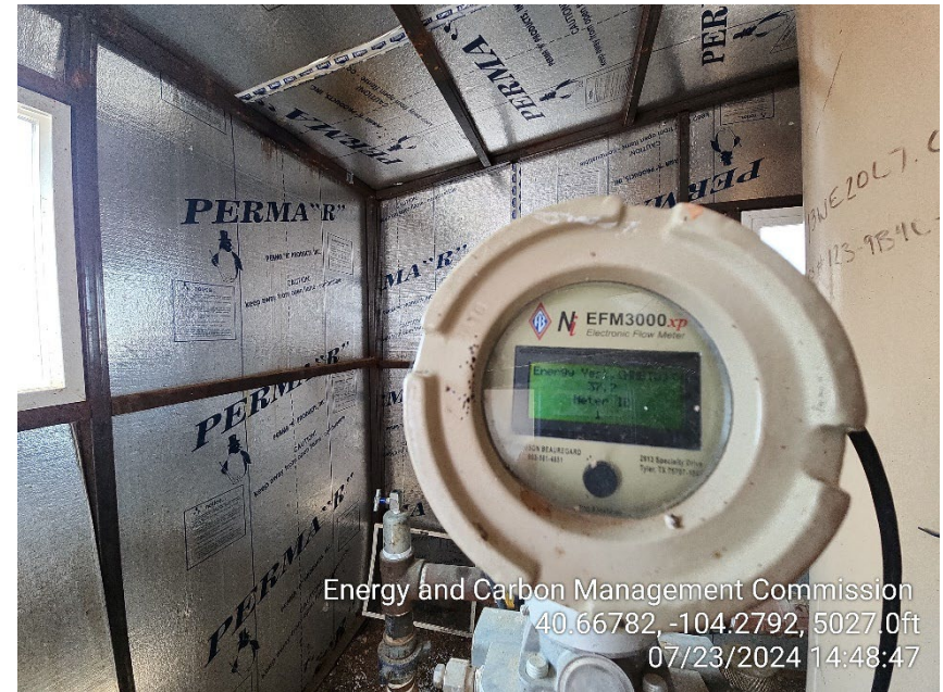
Energy and Carbon Management Commission 40.66782, -104.2792, 5027.0ft 07/23/2024 14:48:47