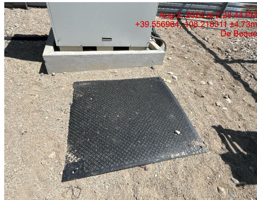
Debris - Photo #04049