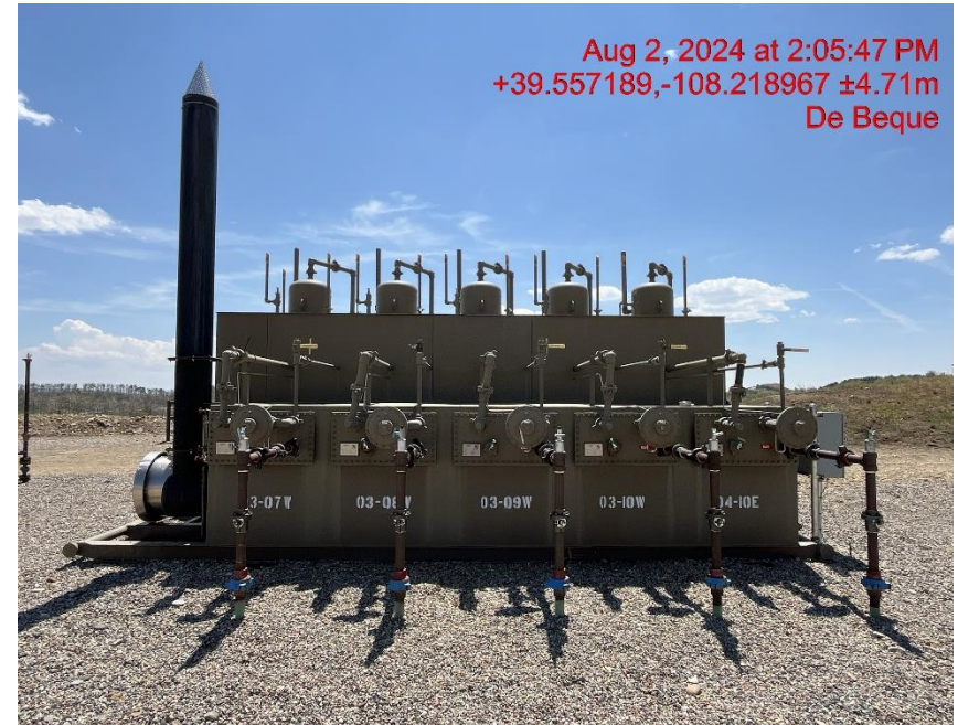
Separators - Photo #04018