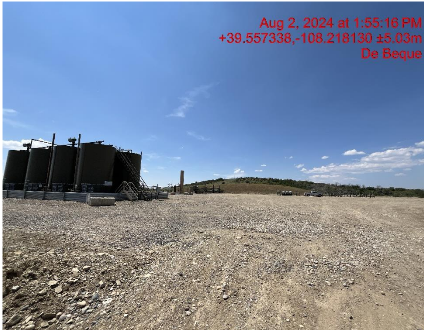
Entrance to location - Photo #04009