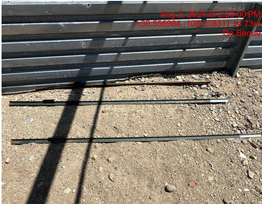
Debris - Photo #04050