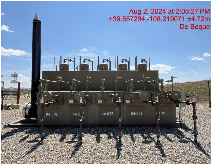
Separators - Photo #04017