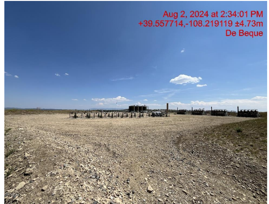
Northwest corner of location - Photo #04055