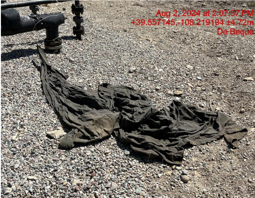
Debris - Photo #04021