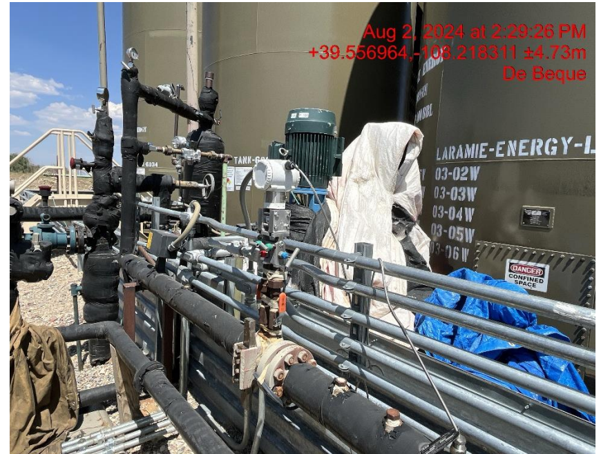
Debris - Photo #04051