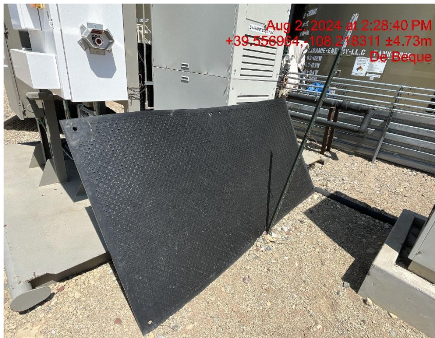
Debris - Photo #04048