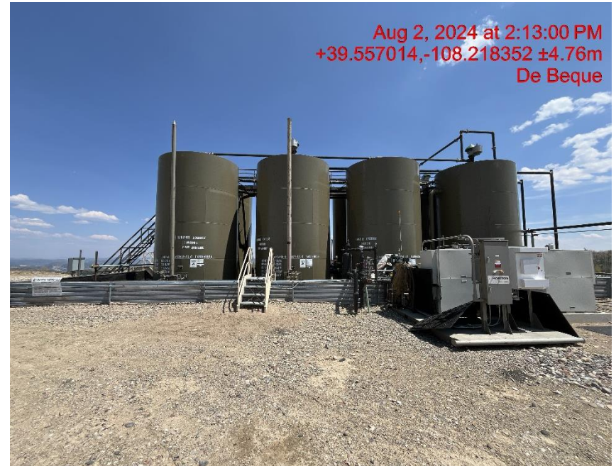
Separators - Photo #04019

Aug 2, 2024 at 2:13:00 PM +39.557014,-108.218352 ±4.76m De Beque