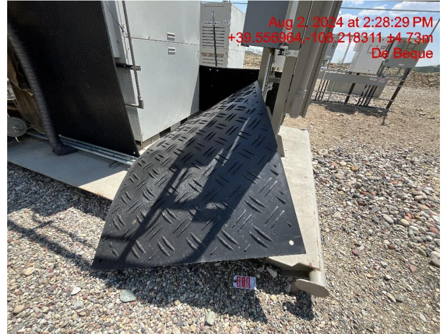
Debris - Photo #04047