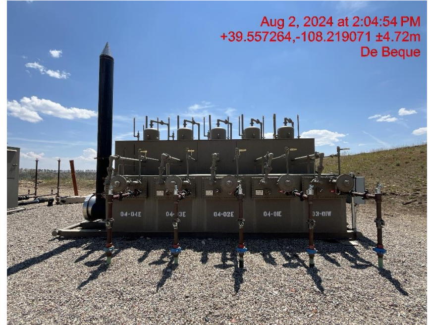
Separators - Photo #04016