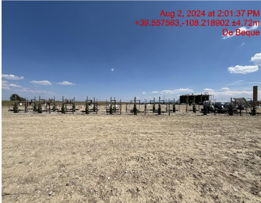
Wellheads - Photo #04011