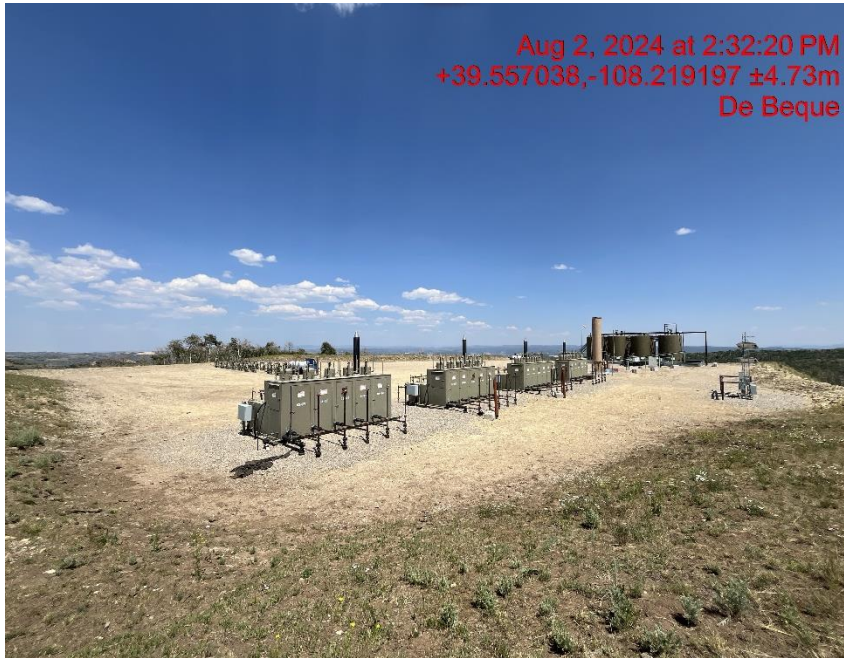
Southwest corner of location - Photo #04054