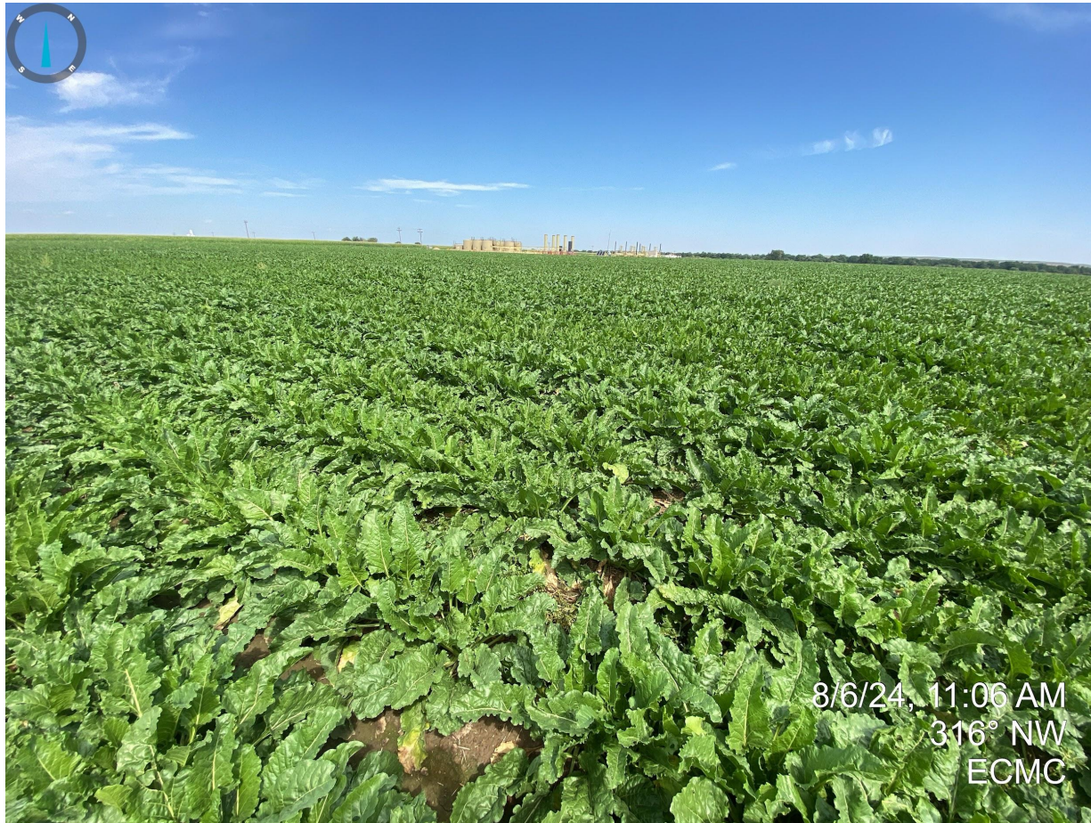
Photo 5. Adjacent reference area northwest of the former well location.