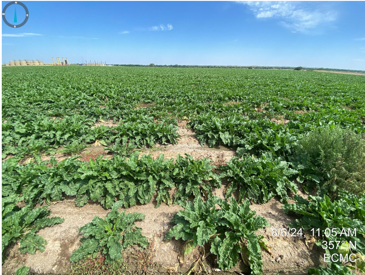
Photo 1. Facing north at the former location of Well API 123-25134. It was observed that the former well location does not appear reflective of adjacent reference areas as non-uniform vegetation cover was observed.