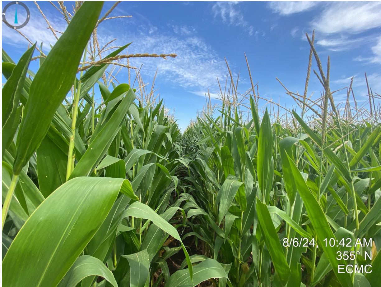
Photo 1. The well location (Location ID 306705 with API 123-25137) meets final reclamation regulations and standards. Unable to find evidence of oil and gas activities and/or disturbances. Well location and access road appear reflective of reference crop areas.