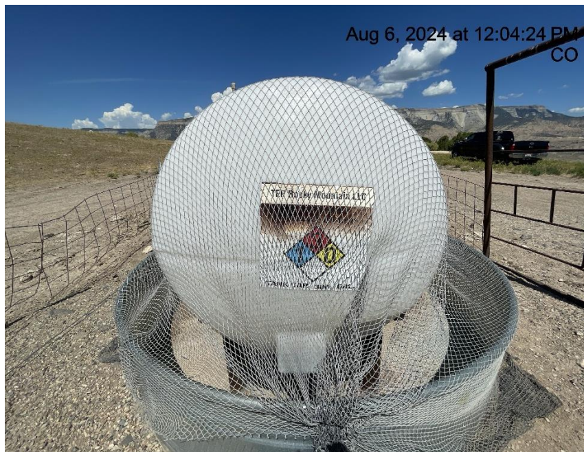
Photo # 5016 Some required info on chemical tank label is illegible/does not comply with CECMC labeling rules