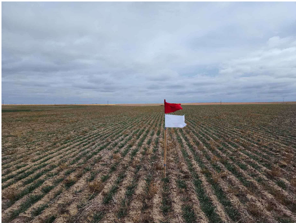
WELL LOCATION LOOKING EAST 11/4/22