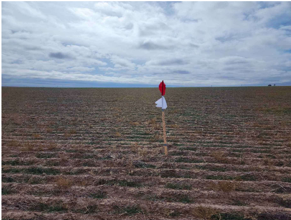
WELL LOCATION LOOKING SOUTH 11/4/22