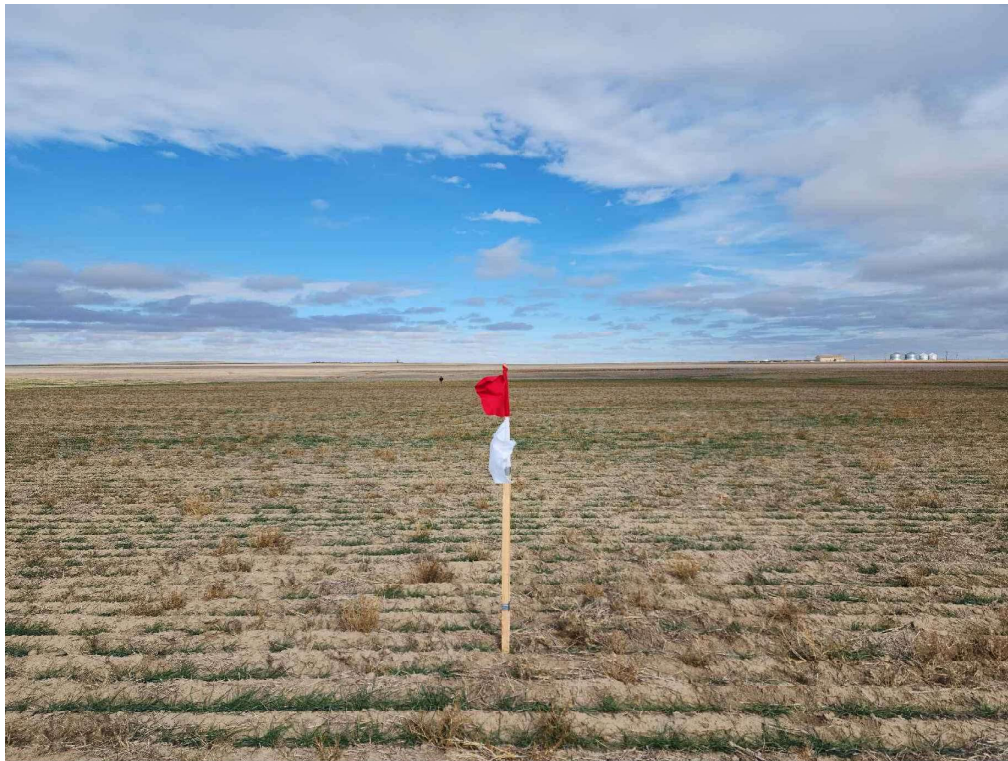
WELL LOCATION LOOKING NORTH 11/4/22