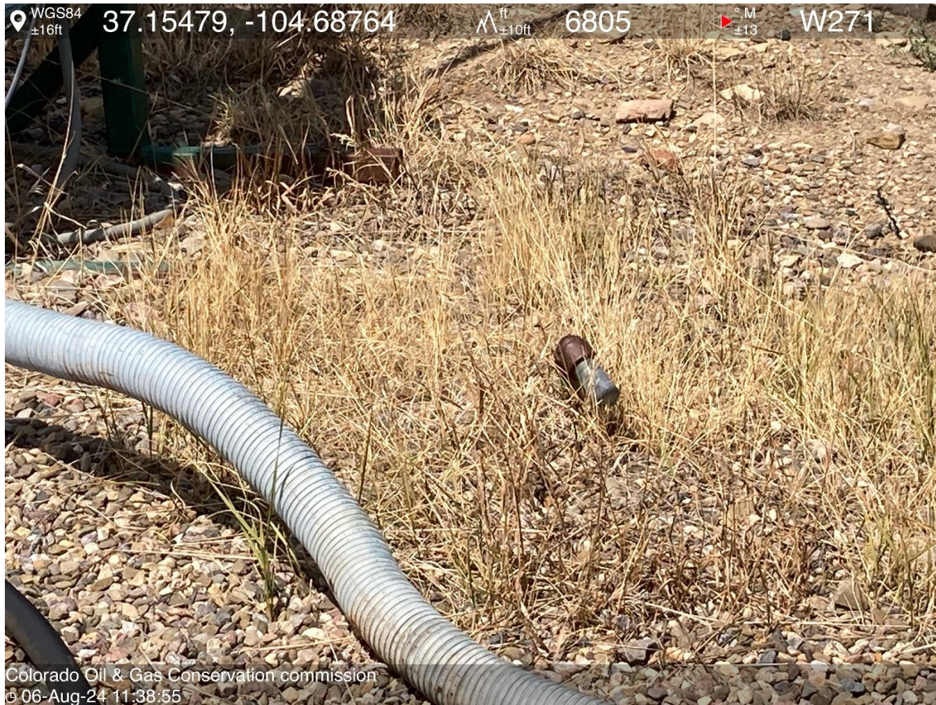
PHOTO 5: UNUSED EQUIPMENT (1" RISER NORTH OF WELLHEAD). REMOVE OR MARK UNUSED RISER PER RULE 606. CA DATE 9-6-2024.