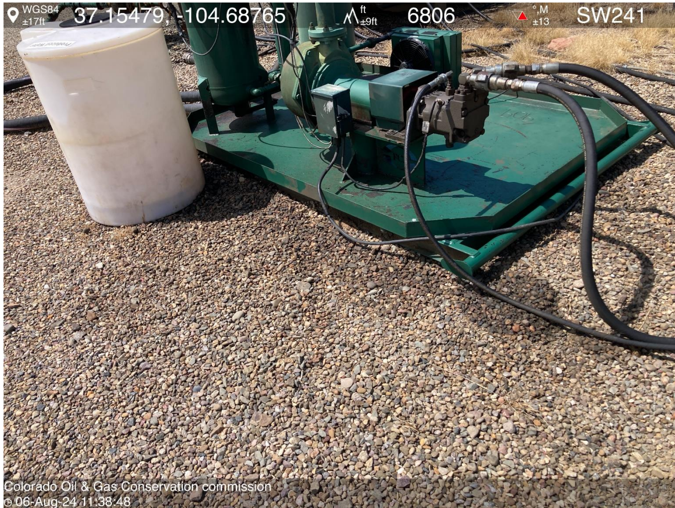
PHOTO 7: AREA OF IMPACTED SOIL AROUND COMPRESSOR SKID. REVIEW Self-inspection, maintenance, and good housekeeping procedures and schedules, REMOVE OR TREAT IMPACTED MATERIAL AND REPAIR LEAKING EQUIPMENT BEFORE PUTTING BACK ON LINE PER RULE 1002..(2).D. CA DATE 9-6-2024.