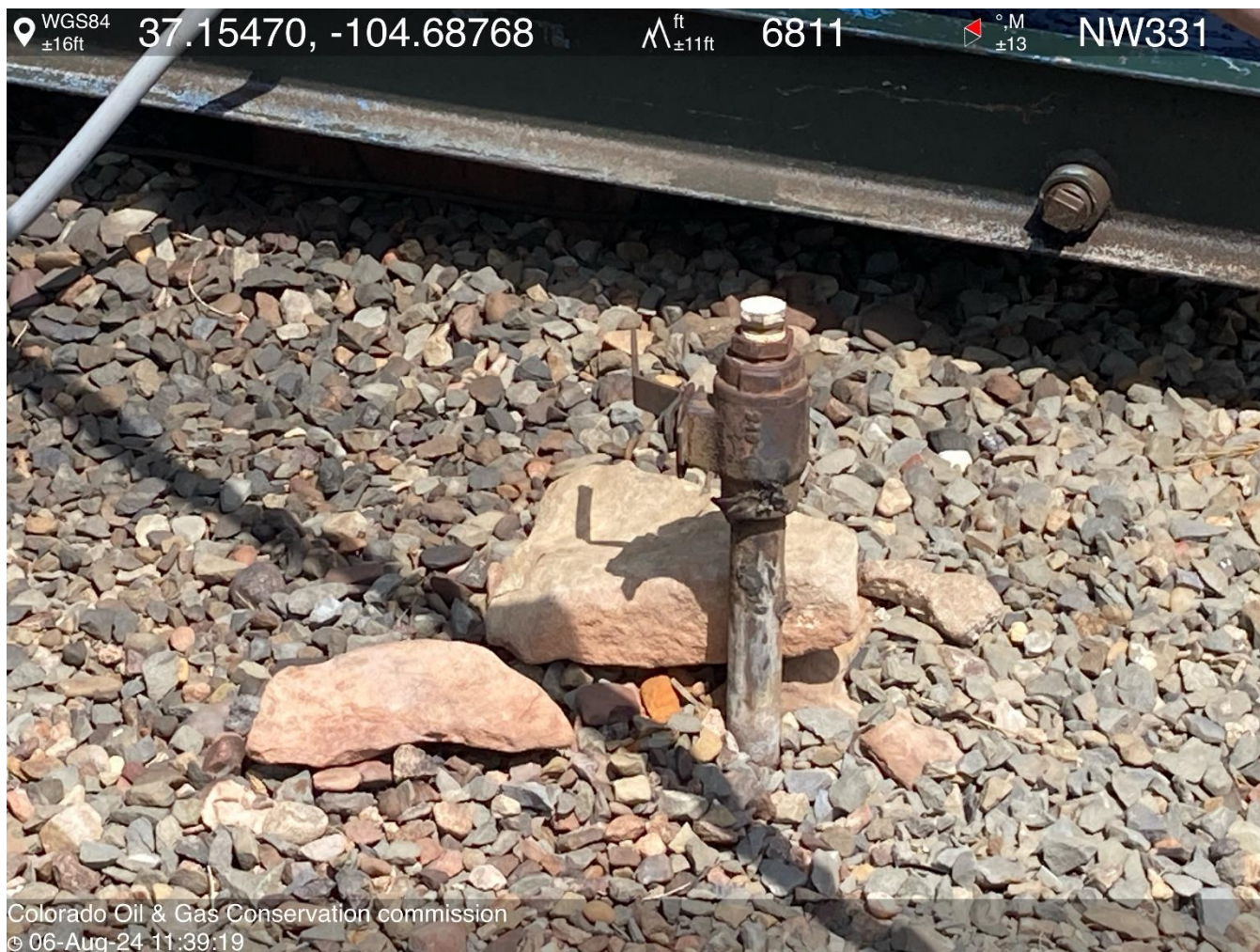
PHOTO 4: UNUSED EQUIPMENT (1" RISER WEST OF WELLHEAD). REMOVE OR MARK UNUSED RISER PER RULE 606. CA DATE 9-6-2024.