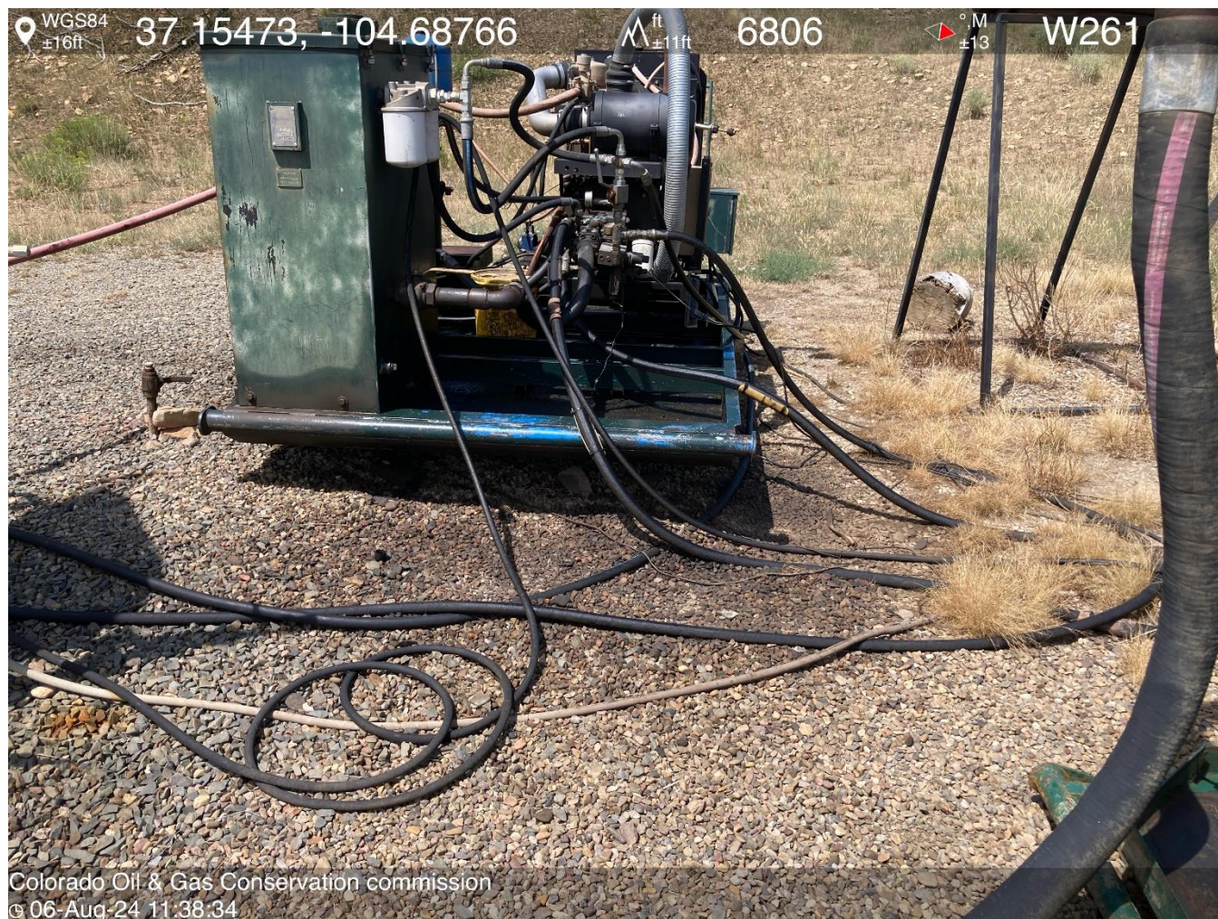
PHOTO 6: AREA OF IMPACTED SOIL AROUND COMPRESSOR PRIME MOVER. REVIEW Self-inspection, maintenance, and good housekeeping procedures and schedules, REMOVE OR TREAT IMPACTED MATERIAL AND REPAIR LEAKING EQUIPMENT BEFORE PUTTING BACK ON LINE PER RULE 1002..(2).D. CA DATE 9-6-2024.